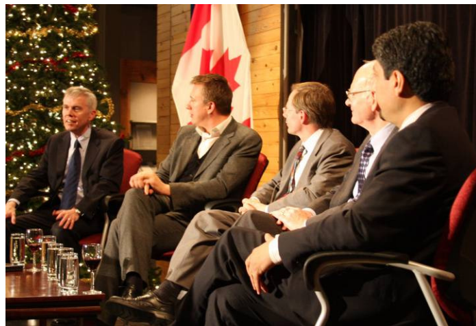
The panel of experts assembled in CIGI’s atrium

On December 9, 2008, the Canadian International Council (CIC), in cooperation with The Centre for International Governance Innovation (CIGI), convened a Town Hall on The Way Forward in Afghanistan , in Waterloo, Canada. Convened shortly after national elections in Canada and the United States, the Town Hall was framed as a mechanism to collect input and advice for new governments in both countries. The purpose of this discussion was threefold: to provide Canadians with a comprehensive view of the current situation in Afghanistan, to offer a forum for a wide variety of interested individuals to express their views and opinions, and to spur a genuinely inclusive national debate.