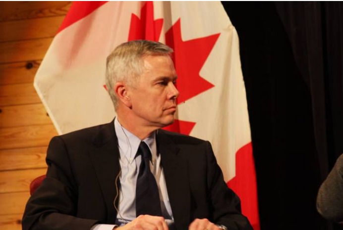
Deputy Minister David Mulroneu

Just as worrying for policy makers and military strategists as the growing intensity of violence in the south and east of the country, the centre of gravity for the insurgency, has been the gradual expansion of insurgent activity into previously stable areas, like the central provinces of Wardak and Loghar. Mr. Mulroneu noted that the Taliban has “largely been displaced rather than defeated,” in effect creating numerous and shifting frontlines. The Taliban lack the capacity to unseat the central government in Kabul, but that is not their short or medium-term strategy. Rather, they seek to prevent the state from fully establishing its presence across the country and delivering public goods, thereby de-legitimizing it in the eyes of the population.