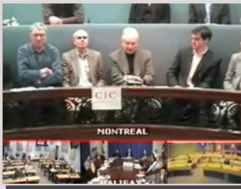
Image at right gives a screenshot of the video broadcast

Video conferencing made the Town Hall a truly national event, enabling interactive dialogue between the panel of experts and participants at six CIC branch locations across the country.