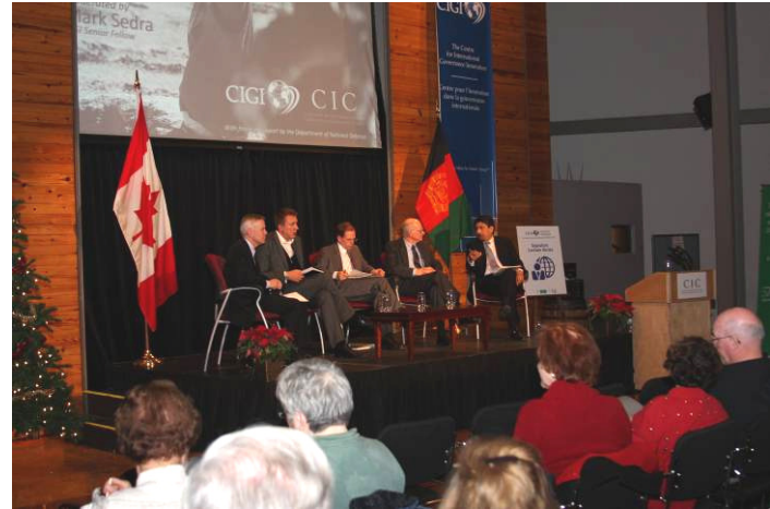
The panel of experts makes their concluding remarks

Some isolated efforts such as the Peace Through Strength (PTS) program have been implemented in recent years to draw moderate Taliban away from the movement in exchange for small-scale incentives; however, such initiatives have had mixed results and were aimed at splitting the Taliban movement rather than finding a peace settlement. Developments in 2008 and early 2009 show that more serious efforts may be underway to find common ground. For instance, in October 2008, the Saudi King sponsored informal talks between the Karzai government and former Taliban leaders in Saudi Arabia. As several Town Hall participants remarked, peace talks with the Taliban will be difficult as it is not a homogenous group and many of its leaders see no reason for compromise while in a position of perceived strength. While the Afghan government has not publicly outlined its "red lines" for any prospective negotiation with the Taliban, the integrity of the constitution and its protections for individual rights, including those of women, would surely be a big one. Nonetheless, it is a positive sign that a process to forge a more inclusive political settlement may be possible and has the support of international donors.