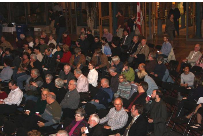
Town Hall participants in Waterloo

On the security front, it is now widely accepted that there is no military solution to the Afghan conflict. The cornerstone of NATO's strategy should be an integrated approach that prioritizes support for development and governance promotion activities over combat operations. Clearing areas of insurgents has not been the problem of NATO and the Afghan government; holding and building areas liberated from the Taliban have. NATO forces must work to develop closer synergies with development agencies and NGOs to achieve greater joint effect in insecure areas.