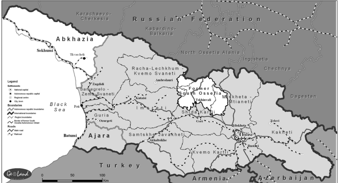
Administrative map of Georgia