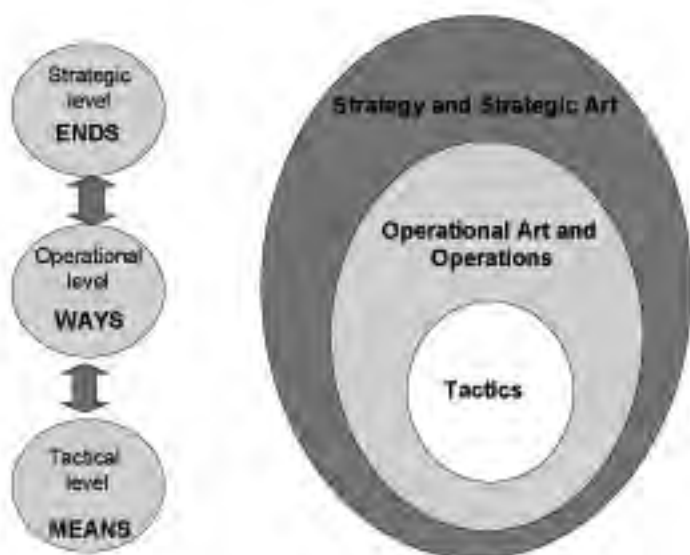
Figure 1. Two Contending Views of the Ends-Ways-Means Relationship.

assembly line with Frederick Taylor measuring progress. It demeans the importance of the continuous and intimate two-way conversation that is essential for success. A more satisfactory perspective would notice that these are nested. These two contending views are shown diagrammatically at Figure 1. In practice – but not in our current theory – tactics and operational art are a part of – and not subordinate to – strategy.