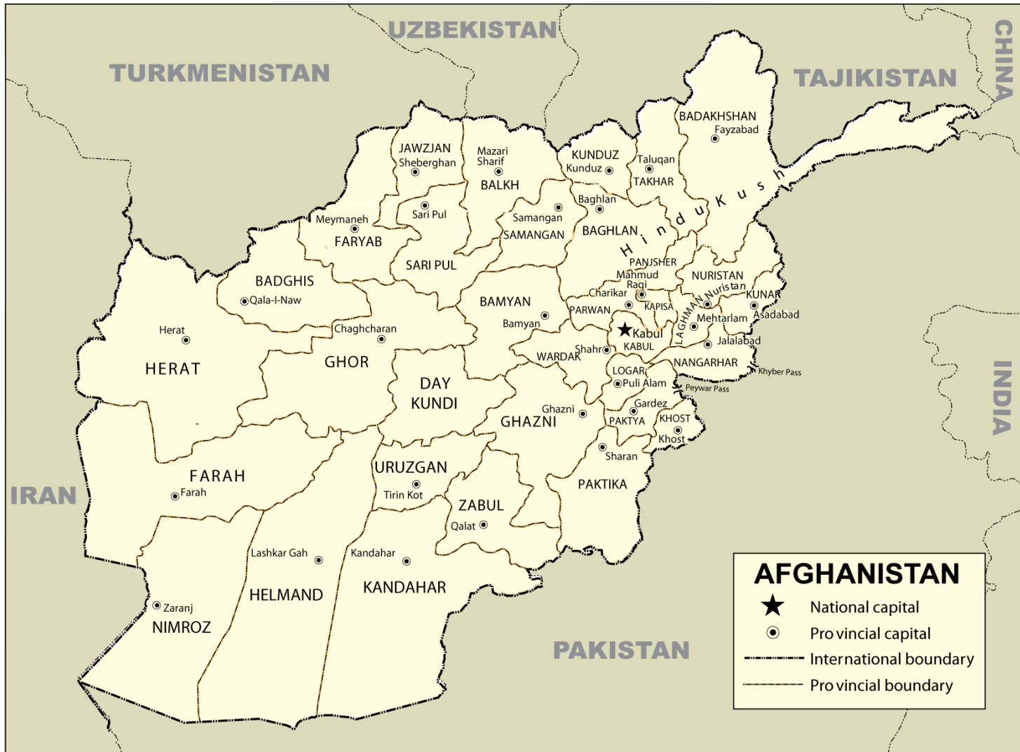
Figure A-I. Map of Afghanistan