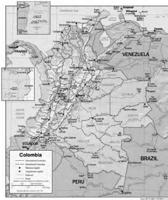
Map of Colombia.

actively patrol rural Colombia, providing presence in areas of conflict and assisting in the counternarcotics campaign.