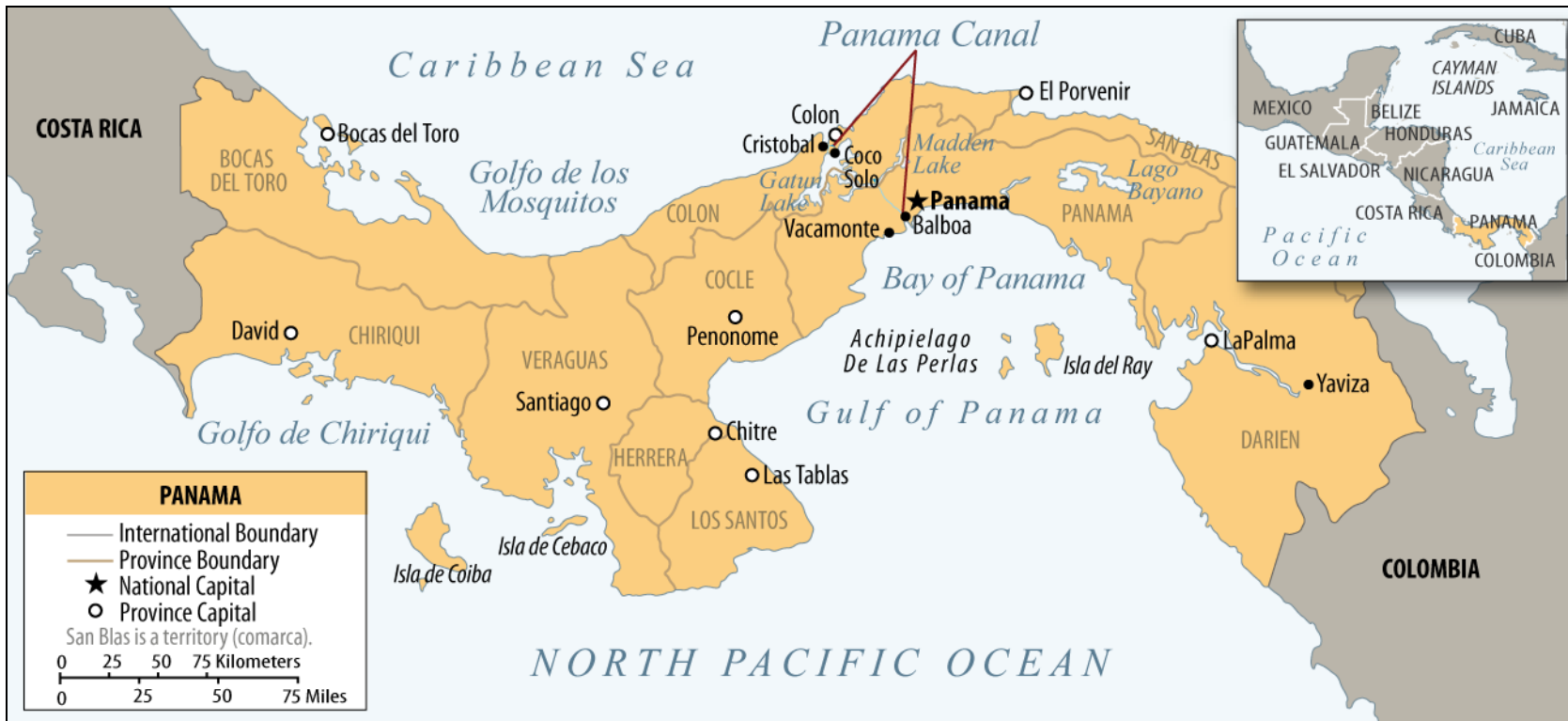
Figure I. Map of Panama