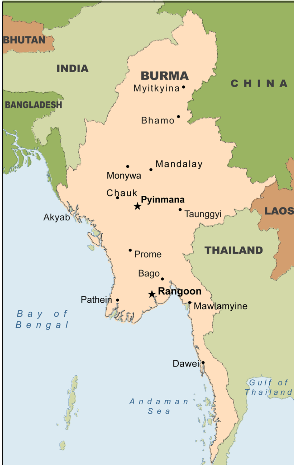
Figure 2. Map of Burma