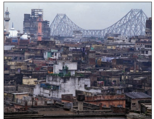
Progress on poverty requires the fair distribution of the benefits of growth.

The UN Secretary General's report for the UN Summit on the MDGs in September 2010,