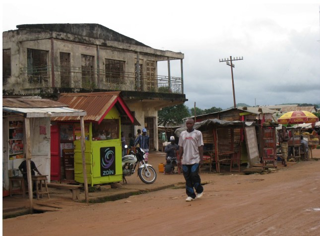
War destruction in Sierra Leone

The claim commonly made for power-sharing institutions is that they promote not only civil peace but also democracy. Consensus democracy, which