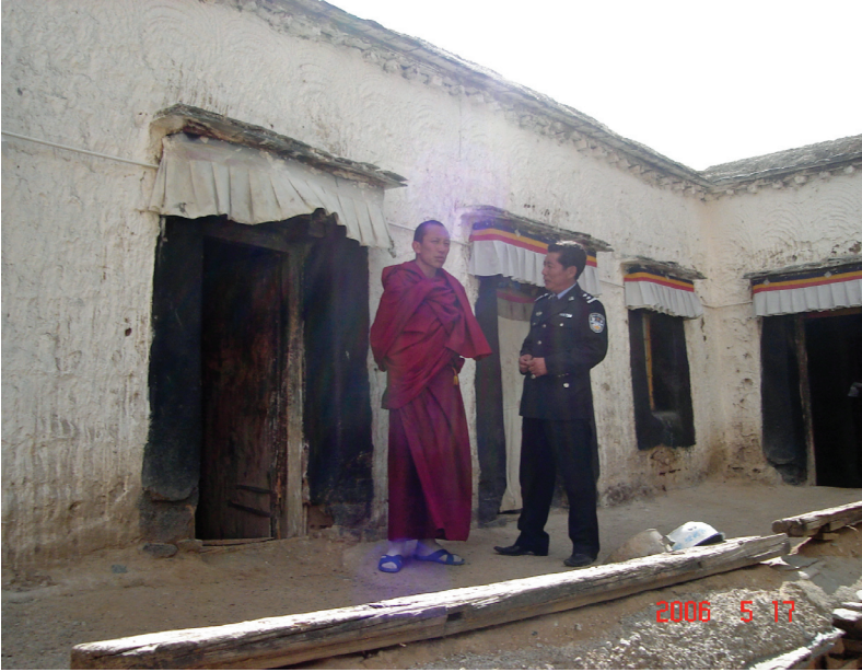
Photo 1. A Policeman Questioned a Tibetan Monk After Our Visit. Photo by Wenfang Tang, 2006.

“Oppose separatism! Oppose infiltration!” Inside the main building, there was a huge billboard, taking up an entire wall. It listed seven don’ts in both Chinese and Uyghur (photo 2):