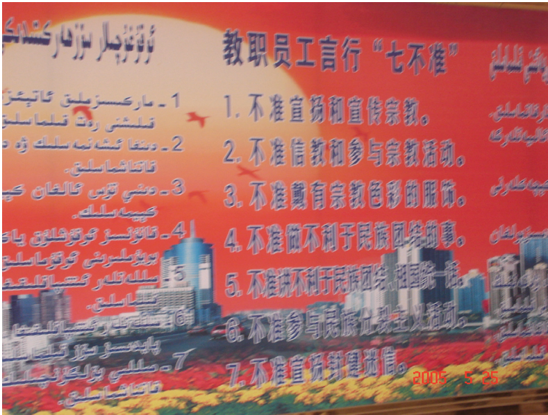
Photo 2. A Billboard Banning Religious Practices in Uyghur and Chinese at the Kashgar Keshan Teacher's School.

Ethnicity Surveys whether they believed in any religion. Only about 8 percent of Han students reported that they were Buddhists, and 89 percent did not have any religious affiliation. We were somewhat surprised to find a high degree of religious affiliation among minority students. In spite of the ban on religion in public schools, 63 percent of Tibetan and 88 percent of Mongol respondents declared that they were Buddhists, and 75 percent of Uyghur, 86 percent of Hui, and 95 percent of Kazak respondents reported that they were Muslims. As with many other aspects of Chinese life, the official policy is harsh, yet people routinely find a way around the rules. State officials are well aware of the transgression, but they mostly leave violators alone, as long as they do not threaten national security. The high percentage of reported religious believers is also an indication that the respondents were not afraid of telling the truth. That is good news for the reliability of the surveys.