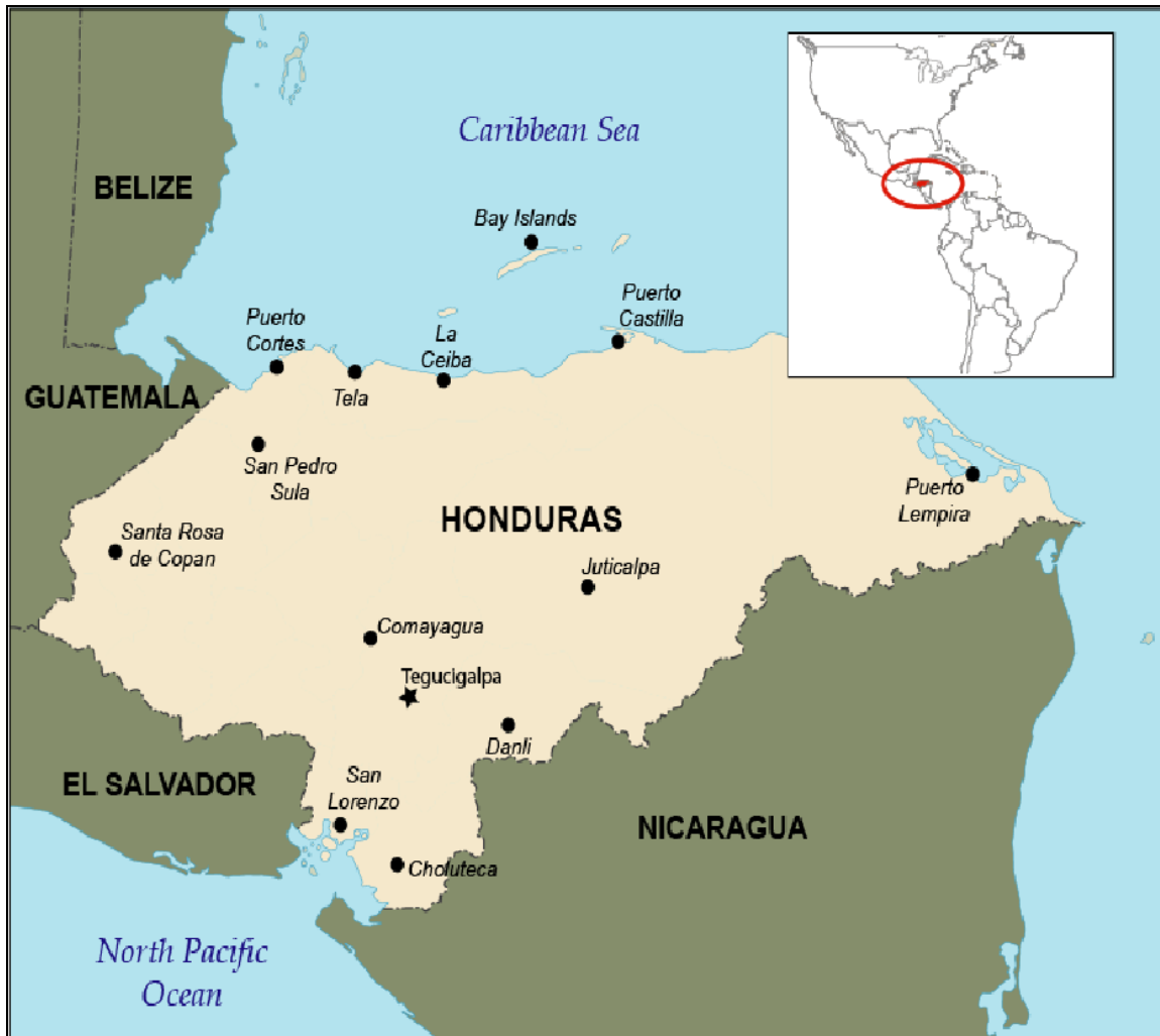
Figure 1. Map of Honduras