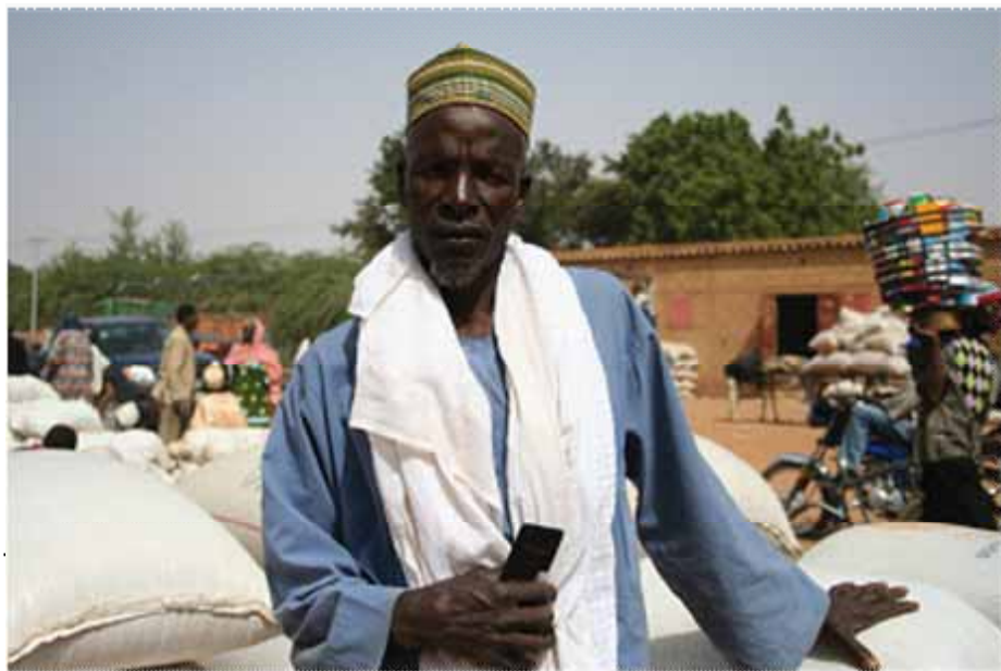
Figure 2. Grain intermediary in the market of Dogondoutchi, Niger.

roads. This effect has also intensified over time: the reduction in inter-market price dispersion has increased as a higher percentage of markets have cell phone coverage.