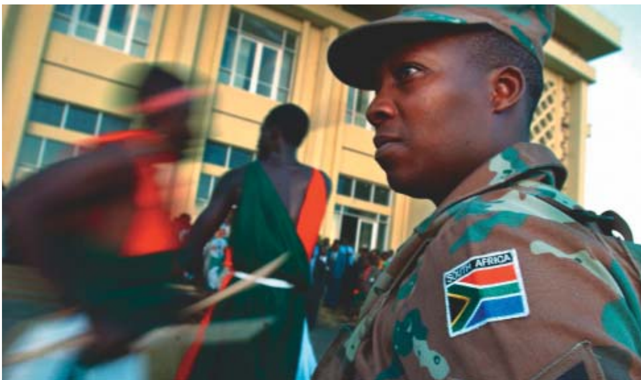
A South African National Defence Force soldier in Bujumbura, as part of the Africa Union Mission in Burundi

Fund (UNICEF) and the World Health Organisation (WHO).