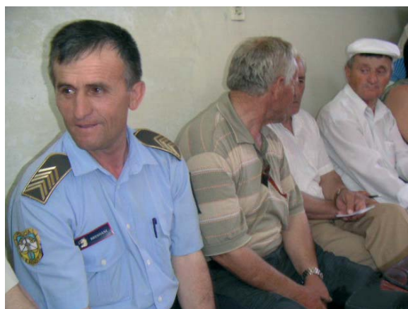
Picture 2: Community Problem-Solving Group in Vlora, 2004