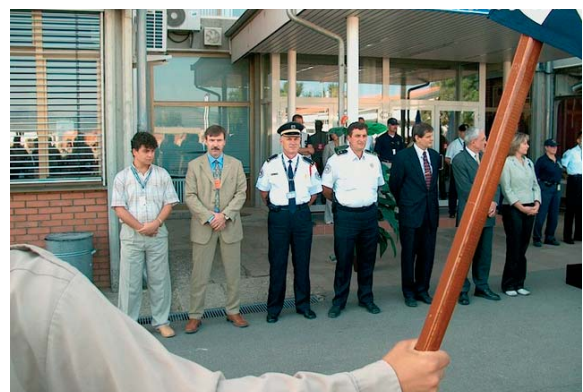
Picture1: Training at the Kosovo Police Service School, 2004

In referring to ‘partnership’ policing it needs to be understood that CBP implies a new contract between the police and the public they are there to serve. It seeks to reverse resentment, apathy and opposition to the police whilst restraining the impulse for the public to take the law into their own hands. This new relationship based on mutual trust and respect also suggests that the police can serve as a catalyst challenging people to accept their share of responsibility for the overall quality of life in their neighbourhood. Both sides of the partnership therefore have to know their responsibilities.