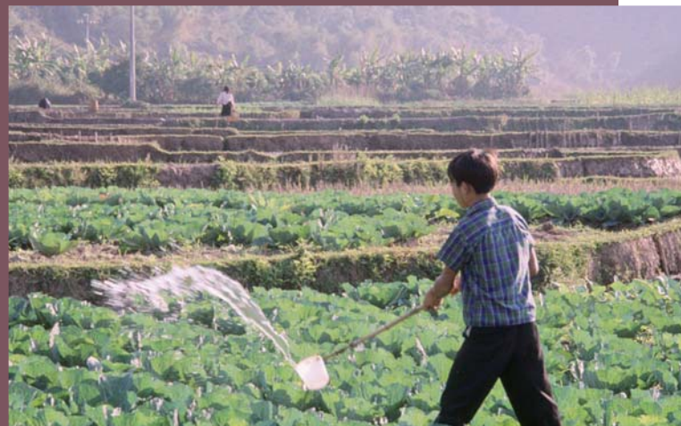
Manual irrigation (Vietnam)

More generally speaking, as part of its cooperation policy regarding water and sanitation, France delivers aid to the African Development Bank, providing financial support to two dedicated trust funds: the African Water Facility (AWF) and the Rural Water Supply and Sanitation Initiative (RWSSI), to which France is the largest contributor, and which has provided access to water and sanitation for 27 million and 22 million people respectively since its creation.