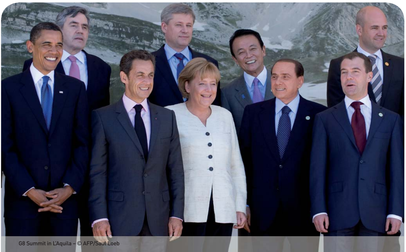
G8 Summit in L'Aquila

This document does not aim to be exhaustive, but, as a complement to the G8 report, presents several significant examples of France's specific contributions to this collective effort. It bears witness to a renewed willingness to engage in dialogue with all stakeholders, who see even more effective and transparent development assistance, combined with international cooperation adapted to the realities of the 21st century, as meaningful responses to the challenges raised by globalization.