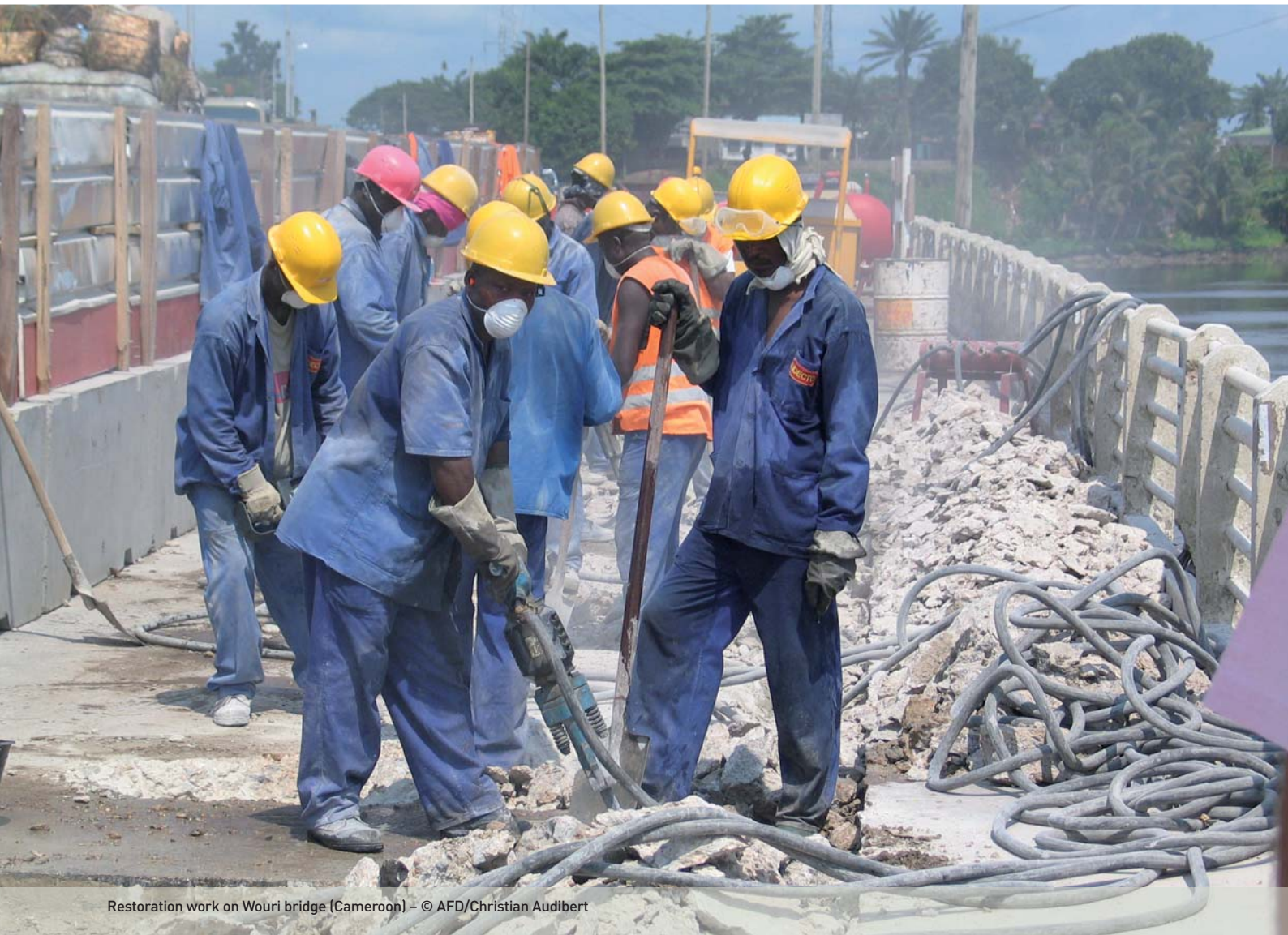
Restoration work on Wouri bridge (Cameroon)