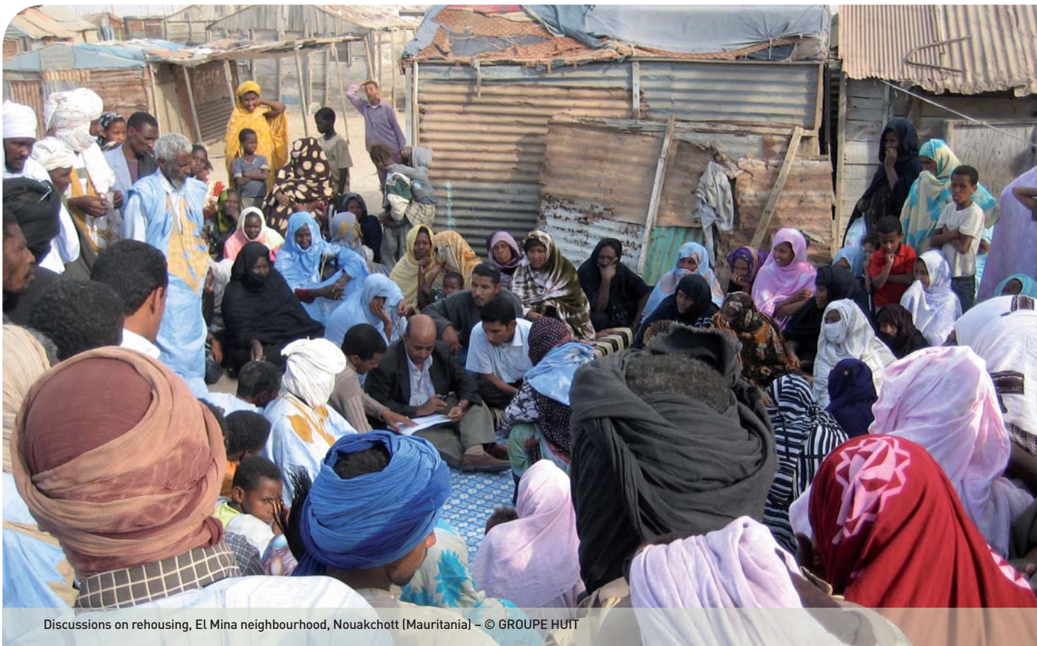
Discussions on rehousing, El Mina neighbourhood, Nouakchott (Mauritania)

French action therefore fully complies with the commitments defined in the Accra Agenda for Action.