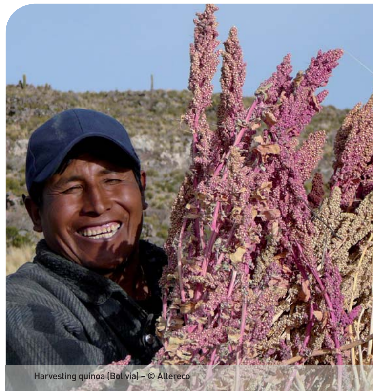
Harvesting quinoa (Bolivia)