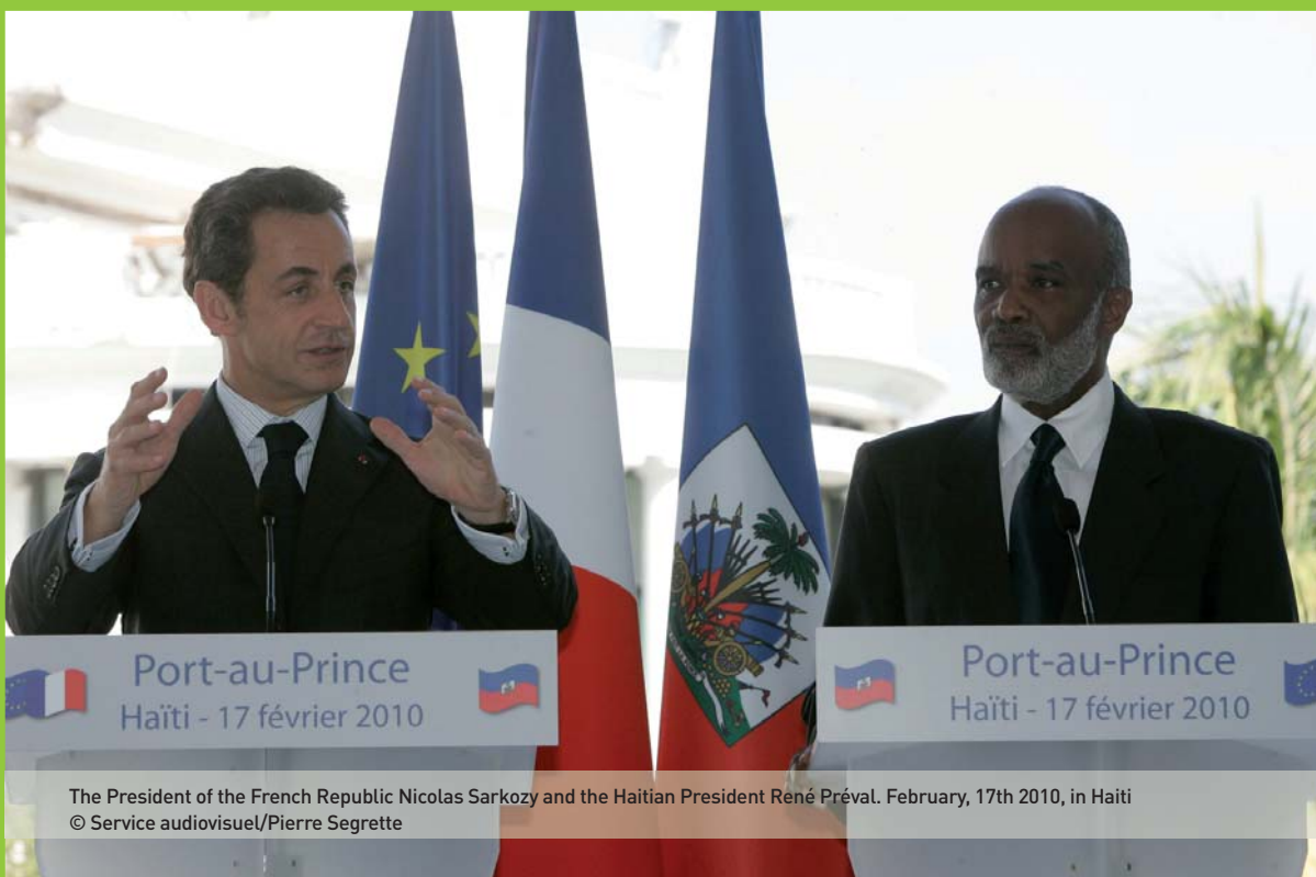
The President of the French Republic Nicolas Sarkozy and the Haitian President René Préval. February, 17th 2010, in Haiti