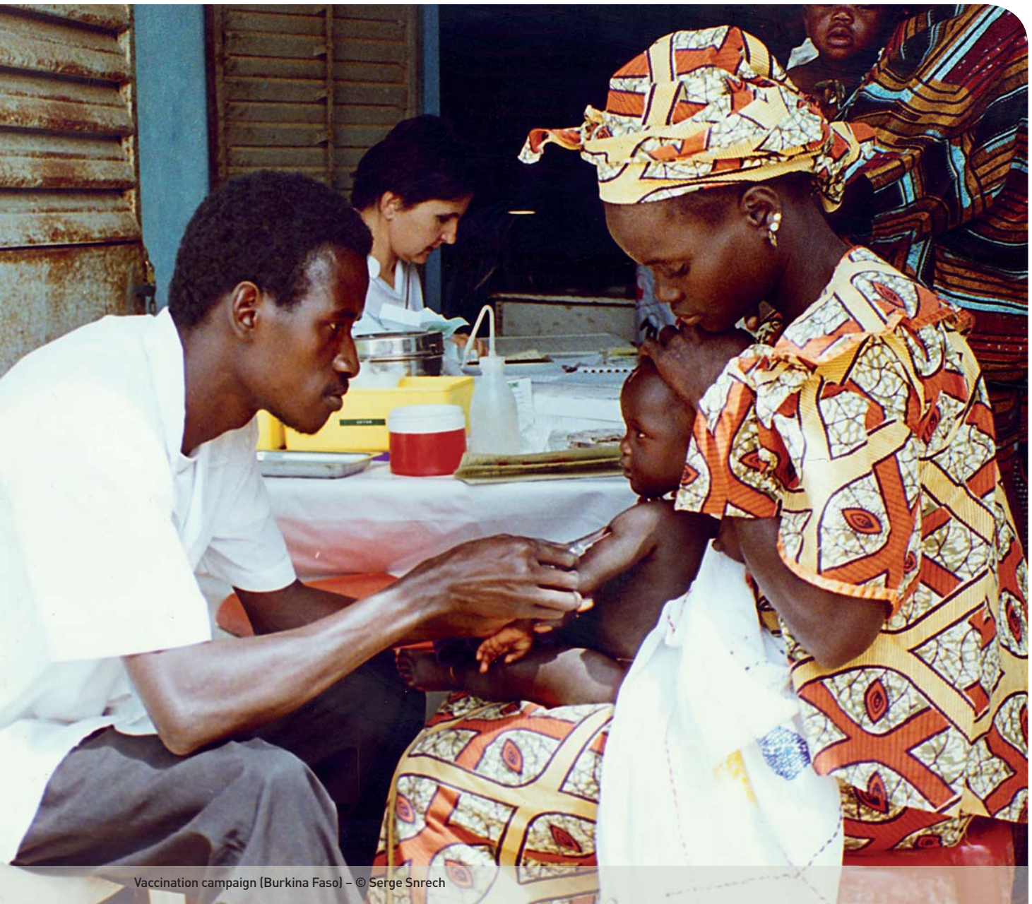
Vaccination campaign (Burkina Faso)

Moreover, out of France's total contributions to the Global Fund and UNITAID, which demonstrate the country's significant commitment to MDG 6 (Combat HIV/AIDS, malaria and other diseases) 50% goes toward to achieving MDGs 4 and 5 as well.