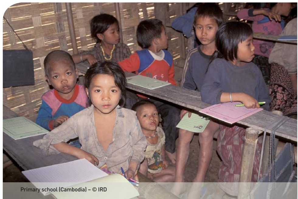
Primary school (Cambodia)

has renewed its support and involvement by donating €50 million to the initiative's Catalytic Fund for the 2010-2012 period. It also mobilized €957 million in bilateral contributions to basic education for the 2003-2008 period.