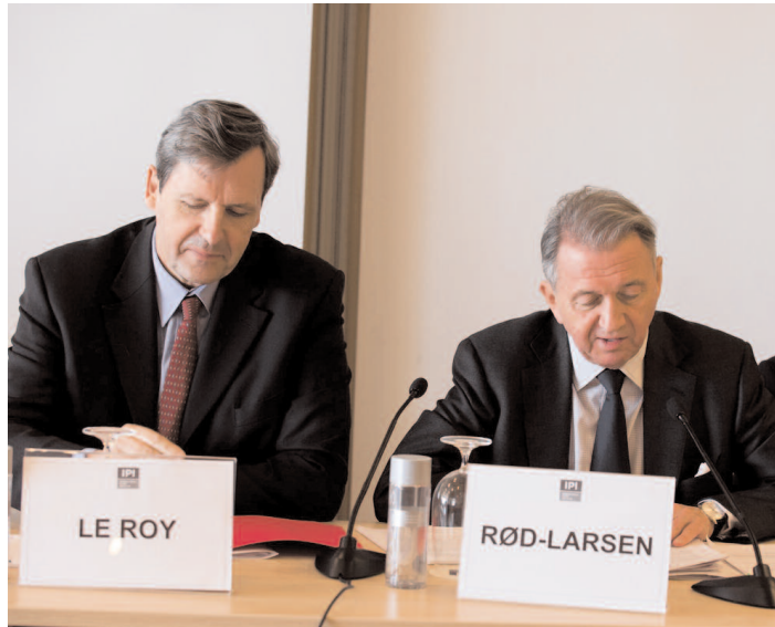
Mr. Alain Le Roy, United Nations Under-Secretary-General for Peacekeeping Operations, and H.E. Mr. Terje Rød-Larsen, IPI President.

Serious disruptions at any one of these levels may threaten the success of a complex peacekeeping operation. Yet, we must remember that, even with all this inherent instability, UN peacekeeping operations often represent the most stable and robust institution in the postconflict environment. They are often the most critical prop upon which weak governments lean as they build strength and legitimacy and make the transition from conflict to peace. Millions depend on UN peace operations as the main bulwark between state collapse and hopes for peace.