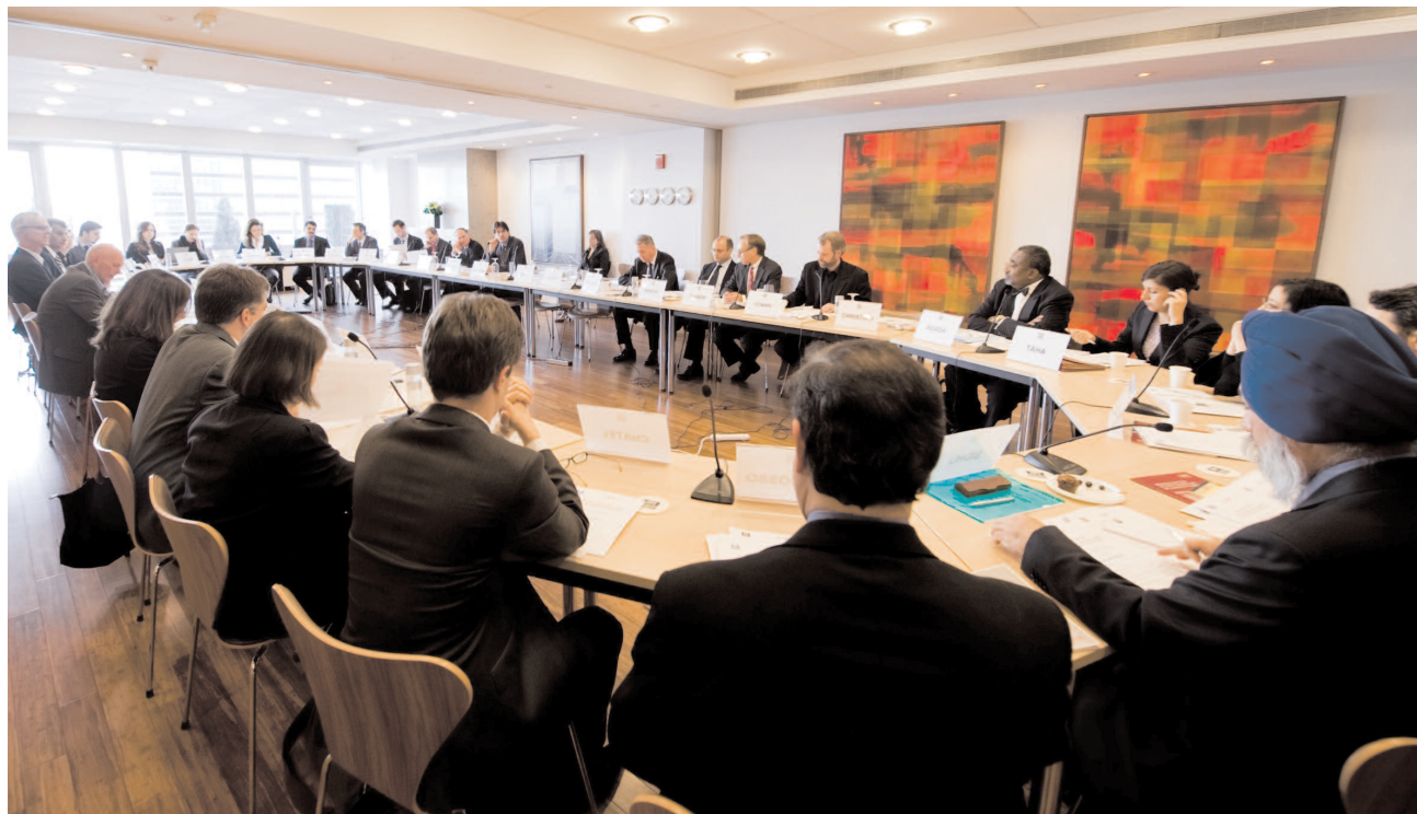
Participants at the conference, "Managing Complexity: Political and Managerial Challenges in United Nations Peace Operations," December 1, 2008 at IPI.

Clearly, peace operations no longer function as they once did. Once peacekeepers observed ceasefires and maintained buffer zones; now they advise