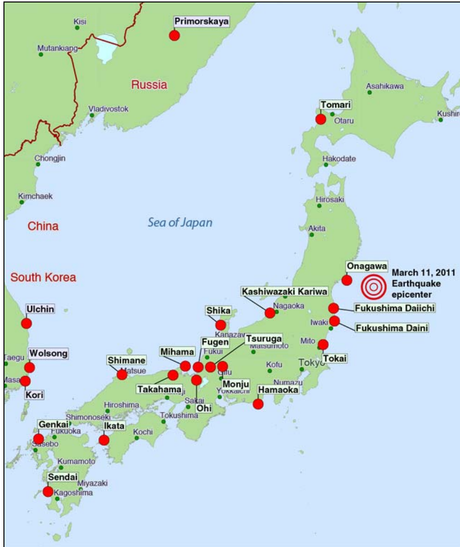
Figure 1. Japan and Earthquake Epicenter