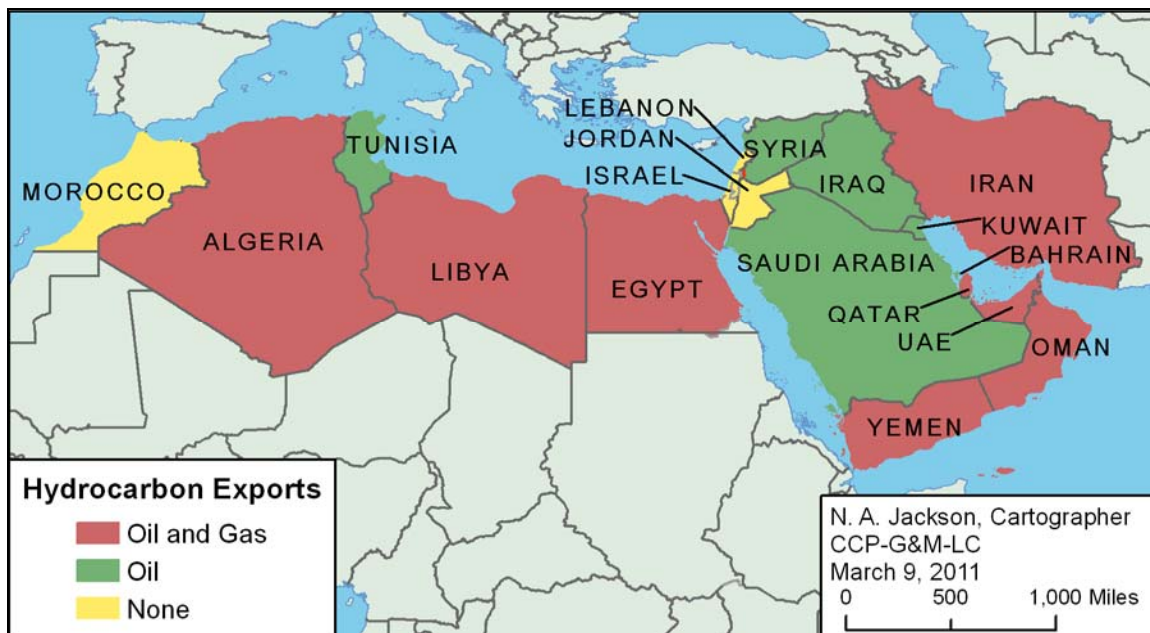
Figure I. Map of the Middle East and North Africa