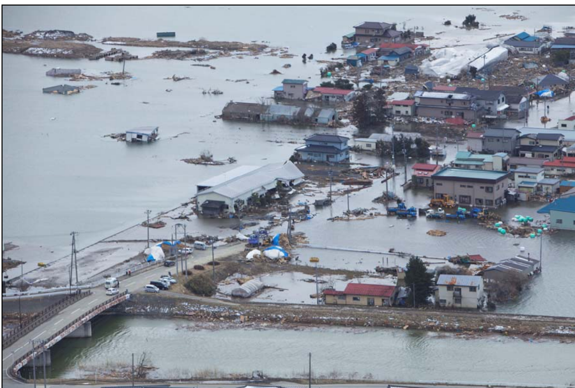
Figure 4. Aerial View of Minato, Japan, a Week After the Tsunami