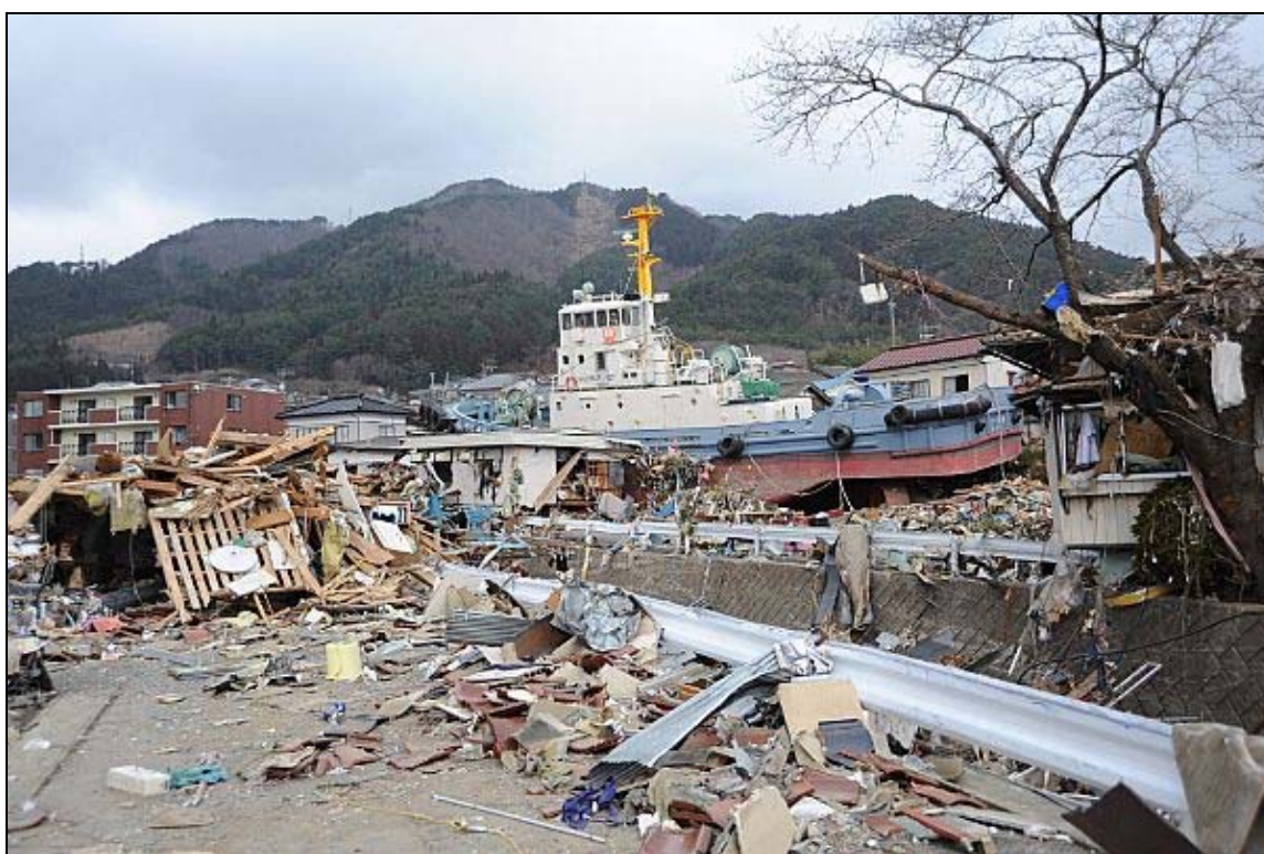
Figure 2.A Tug Boat among Debris in Ofunato, Japan