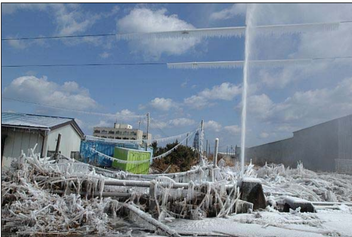
Figure 3.A Damaged Water Pipe Shoots into the Air, Hachinohe, Japan