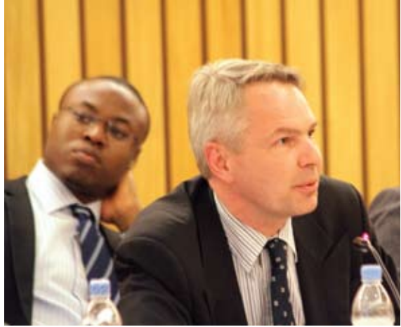
Pekka Haavisto, Special Envoy of the Minister for Foreign Affairs of Finland

The AU's future mediation efforts will face other procedural, administrative and capacity challenges. While Article 4(h) of the AU's Constitutive Act defines the right to intervene in the case of war crimes, genocide, crimes against humanity and serious threats to peace and security, there are no definitive guidelines that determine the process and point of entry for mediation. In addition, deployed mediators may not be trained specifically in mediation techniques. Furthermore, there are no formal processes to record mediation efforts or to build general guidelines from them.