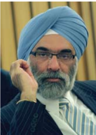
Gurjit Singh, Ambassador of India to Ethiopia

these changes, while those that have been denied access may lose patience with the slow pace of the transition. It is thus critical to develop local capacities to manage these tensions. International civil society organisations tend to have a long-term engagement with post-conflict countries, and seem to work better with local civil society partners, and indeed, often become localised over time. Sustained post-settlement engagement with all levels of society is critical, and requires close collaboration in efforts at both the international/local and governmental/non-governmental interfaces.