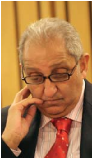
Aziz Pahad, Former Deputy Minister of Foreign Affairs, South Africa