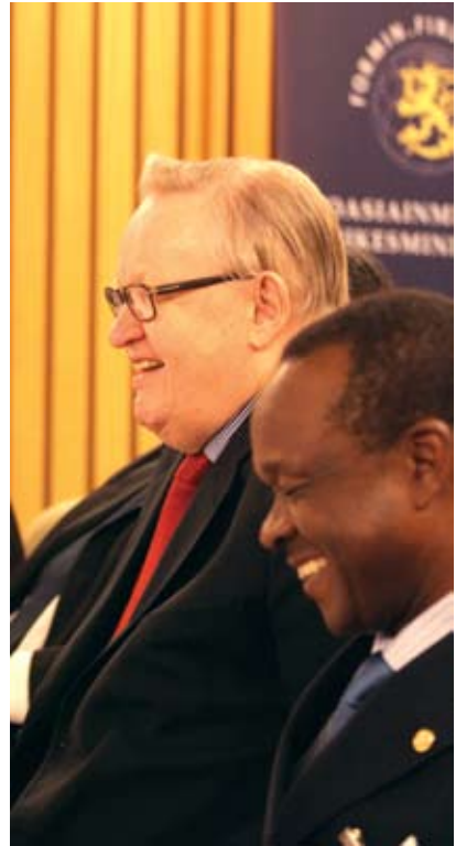
Martti Ahtisaari, Chairman, CMI Erastus Mwencha, Deputy Chairperson, AU

The adoption of the Constitutive Act of the AU in July 2000 has been hailed as the dawn of a new era in Africa, propelled by a vision to regenerate the continent (Juma, 2006:45). Indeed, the regeneration of Africa has been underpinned by the challenge of achieving peace, security and development where the conventional frontiers of security from the Cold War era have been expanded from ideologically defined state security to human security. Africa's new security architecture recognises the shifts in the sources of insecurity from external to internal and from military to non-military, which would include HIV/AIDS, internal displacement and poverty (Akokpari, 2008). In addition to establishing new institutions and organs for building continental peace and prosperity such as the AU Commission, the AU summit in July 2002 adopted the