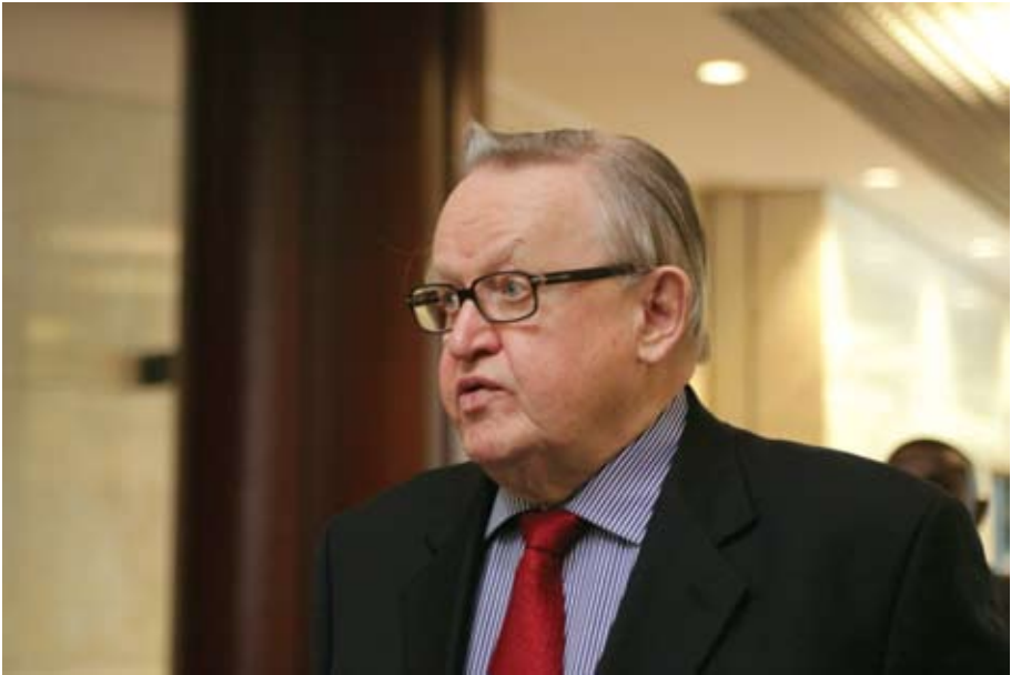
Martti Ahtisaari, Chairman, CMI