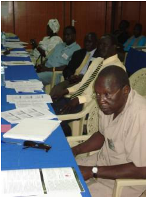
Participants during a session