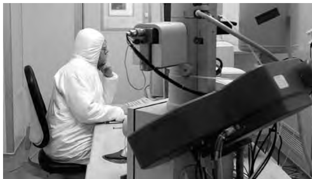
A Nuclear Research Laboratory