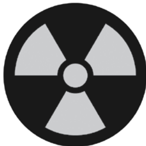
International Symbol for Radiation