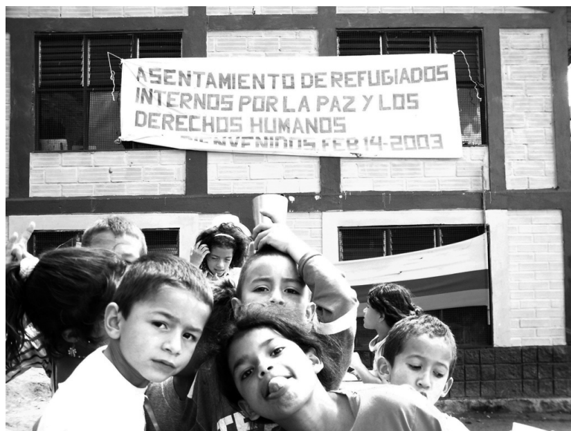
The community school in La Honda. The sign reads “Settlement of internal refugees for peace and human rights. Welcome. February 14 2003.

The consolidation of a paramilitary presence in the La Cruz and La Honda areas had been hampered by the presence in these communities of various local and international human rights NGOs. For this reason, Colombian and foreign human rights activists accompanying these communities have faced repeated threats and attempts to open legal proceedings against them on the basis of spurious information from military intelligence.