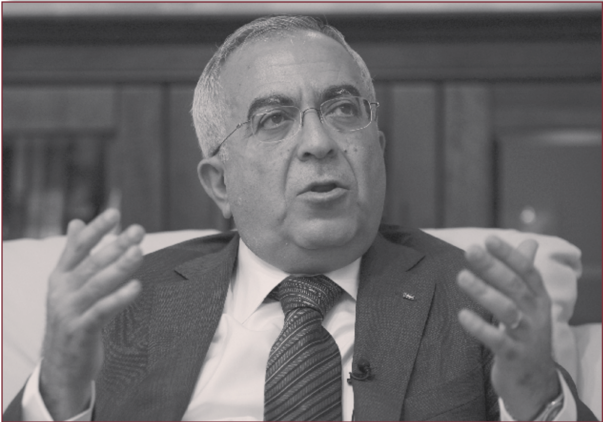
Palestinian Prime Minister Salam Fayyad, June 28, 2011

The Palestinian unilateral drive for statehood would pick up steam in the months ahead. Just ninety days after the inauguration of Israel’s government in May 2009, when Benjamin Netanyahu, Israel’s newly elected prime minister, announced a major shift in policy and accepted a Palestinian state with given security provisos, Fayyad announced a major two-year state-building project for the Palestinian-controlled areas of the West Bank, which he said would result in the creation of a “de facto” Palestinian state by September 2011. The Fayyad plan, as it came to be known, elicited great enthusiasm and gained broad financial and political backing from the United Nations, the Quartet, as well as European leaders and the Obama administration. 17