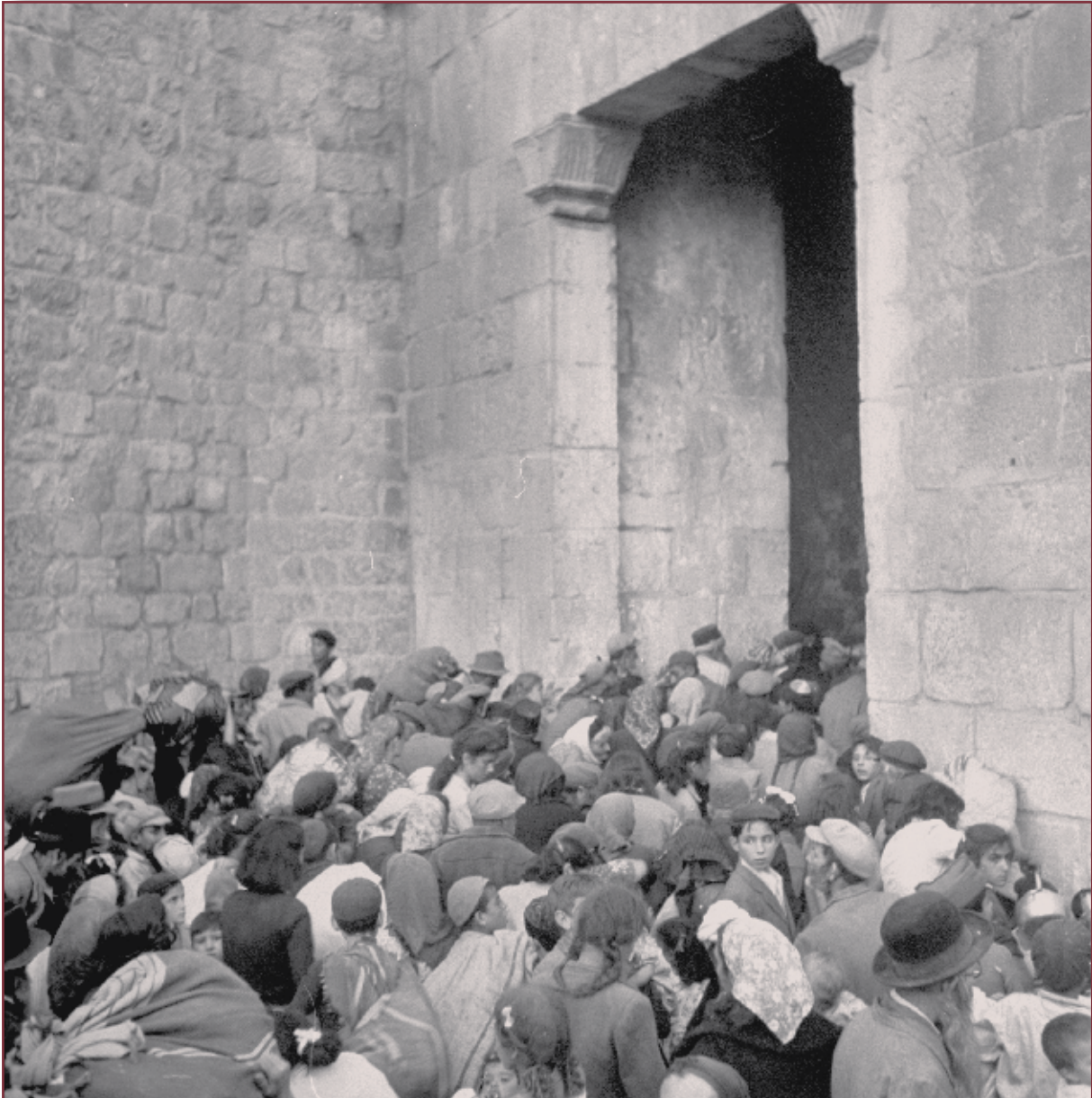
Jewish refugees stream out of the Old City of Jerusalem in 1948 escaping the invading Arab Legion.

What struck legal experts writing in this period was the fact that the Jewish people never renounced those rights and indeed acted upon them through prayer, fasting, and pilgrimage. In the diplomacy of modern Israel, that refusal continued in one form or another, especially after the Six-Day War. Significantly, these rights were backed by some of the most important authorities on international law.