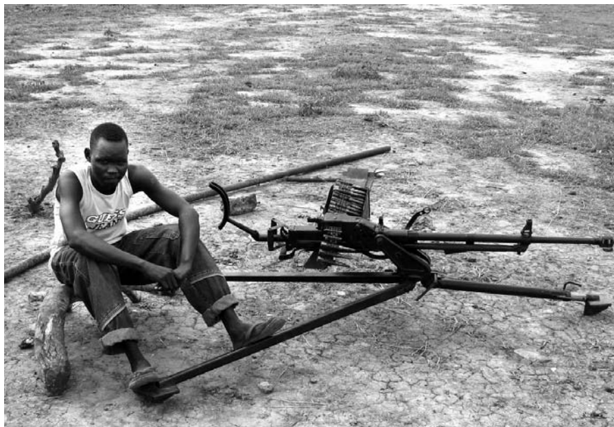
A young man next to his heavy machine gun in Akobo, Jonglei State, South Sudan. Violence in the state is delaying the repatriation of displaced civilians.

the Type 77), followed by the QJZ89 (which reduced the Type 85's weight by another 30 percent) (Jane's, 2000, p. 316). The US developed the XM312 .50 calibre HMG but it is not likely to produce it in large numbers because of perceived under-performance. It has awarded General Dynamics with a contract to develop a lighter-weight version of the M2, which is still under development. 4