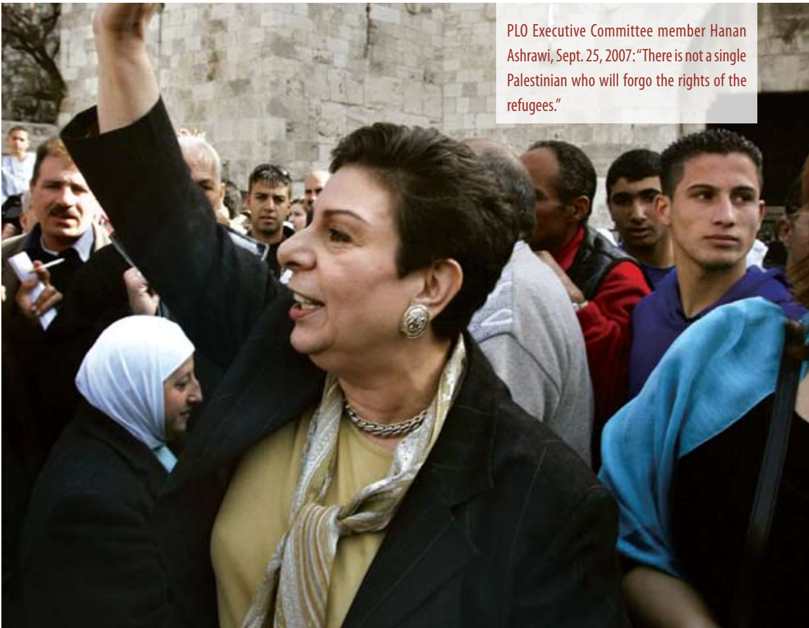
PLO Executive Committee member Hanan Ashrawi, Sept. 25, 2007: "There is not a single Palestinian who will forgo the rights of the refugees."

2007, Ashrawi – currently the head of the nonprofit Miftah organization for promoting democracy and human rights in the Palestinian Authority, a member of the PLO Executive Committee, and a member of the Palestinian Parliament – says: "One must recognize rights according to international law and Resolution 194 of the United Nations. There is not a single Palestinian who will forgo the rights of the refugees. A leader who will tell you he will do this in order to propitiate you will lose credibility among his own people." Referring to a way to solve the refugee problem, Ashrawi said: "The options will be diverse and will provide various solutions, according to law. The most important aspect is the right to choose. They will choose like any human being who wants the best for his children....The moment that you thaw out and recognize the iniquity, they will be free to make decisions. One should try this, but the moment that they can choose – and many choices exist according to law – then we will see what option they will select." 39