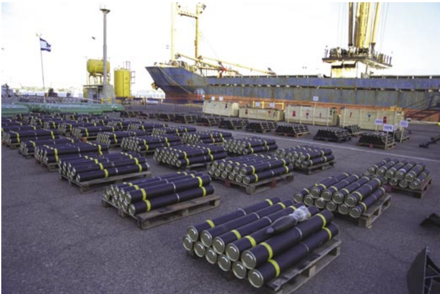
Missiles discovered and captured on the PLO's Karine A ship.