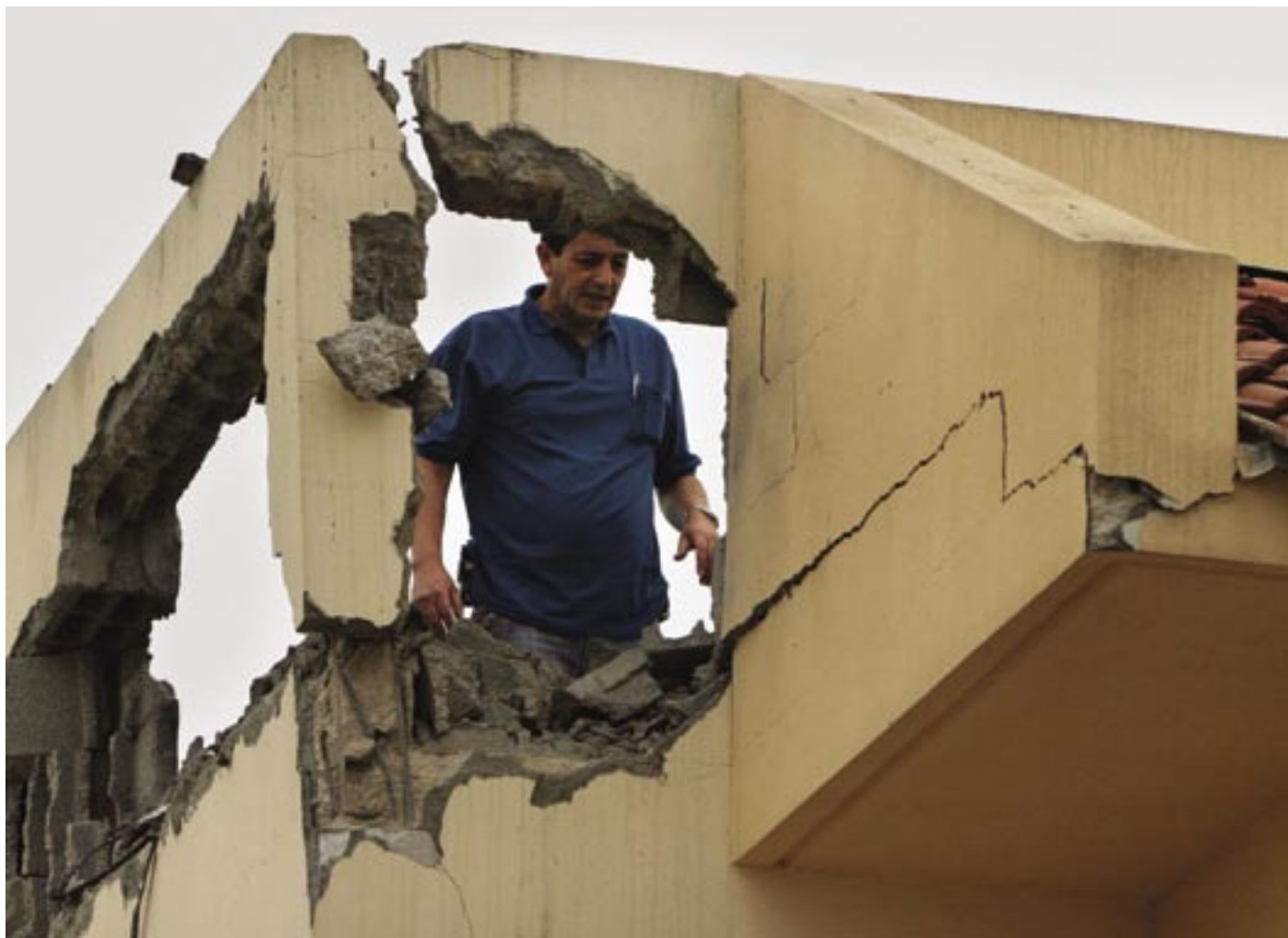
An Israeli man examines the missile damage to his home in the southern Israeli city of Sderot.

Although there appears to be tension between required security standards on the Israeli side and the free movement of Palestinian goods and passengers, certain key elements to any form of passage will satisfy Israel's security requirements and simultaneously ensure the commercial viability of the passage. For example, with regard to the transfer of goods, there could be a separation of cargo by types, a layered inspection strategy, advance information concerning cargo arriving at the crossing points, and the use of different channels or locations for different types of goods. In addition one could require information concerning the identity of the driver, the physical characteristics of both the vehicle and the cargo being transported, details concerning