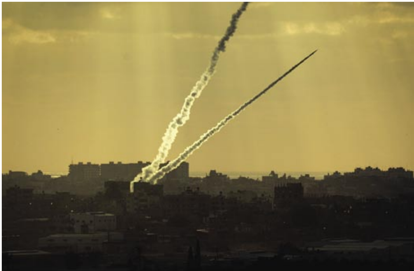
Masked Palestinian terrorists use real rockets and launchers to perform a training exercise for the media in the Gaza Strip.

In considering safe passage in the context of terrorist infiltration into Israel, concerns are raised by the possibility of a terrorist using the safe passage, leaving the established route (a highway, for example), and entering Israel in order to carry out an attack. Few realize