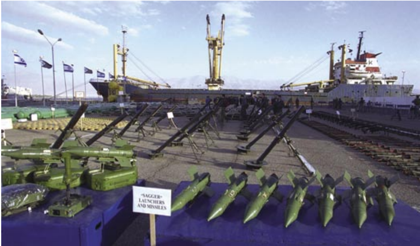
Display of weapons captured and offloaded from the PLO's Karine A ship.