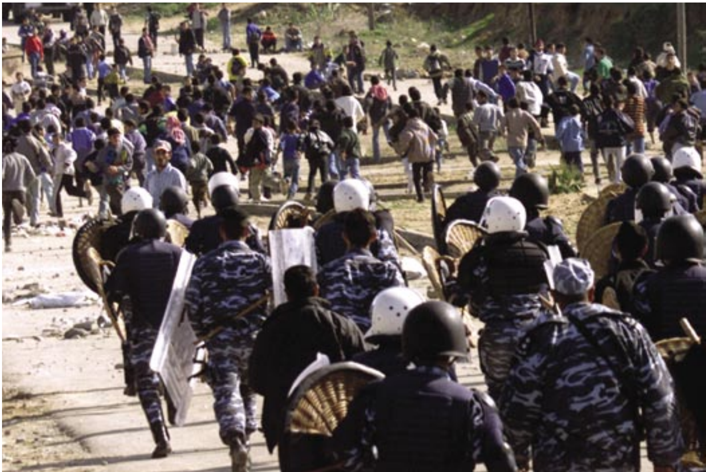
Palestinian police charge Hamas supporters during clashes in Gaza City.

Article XXIX of Oslo II deals with safe passage, and states that “[a]rrangements for safe passage of persons and transportation between the West Bank and the Gaza Strip are set out in Annex I.” Annex I, Article X, provides that there shall be safe passage connecting the West Bank with the Gaza Strip for the movement of persons, vehicles and goods. Israel will ensure such passage during daylight hours. Such passage was to be implemented via four crossing points: the Erez crossing point (for persons and cars), the Karni crossing point (for goods), the Tarkumya crossing point, and an additional crossing point around Mevo Horon. Unlike the Gaza Strip-Jericho agreement, those using the safe passage route were subject to Israeli law only. They were not permitted to interrupt their journeys or depart from the designated routes. In a wider provision than previously agreed to,