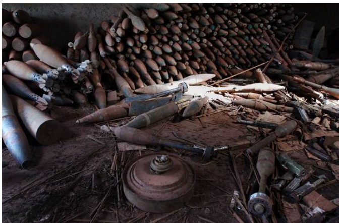
Ammunition stockpile inside

It is obvious that the improvement of SALW storage conditions in the RSS through Safe Storage Improvement Programs (SSIP 6 ) is urgently required. Fortunately, the Services are aware of the lack of safe and secure storage and the risks associated with this. What is extremely valuable is the fact that there seems to be the necessary political will in the Services and Government to improve the situation. There is, therefore, a window of opportunity to proceed with programs for improvement which should not be missed.