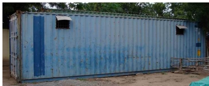
A typical SALW/ ammunition storage container (BICC)

The situation in the counties outside the capital Juba is dire. The Army in particular lacks safe storage structures. High hazard class ammunition is in some cases accessible to the public, unprotected and/or not sufficiently guarded—an extremely dangerous situation.