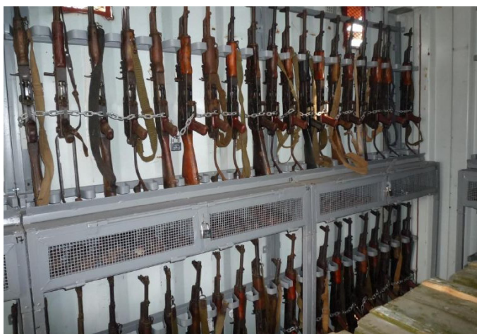
Inside in-use SALW storage container (MAG Burundi)

Based on a needs analysis, the number and type of new facilities as well as refurbishments need to be specified. Basic infrastructure refurbishments do not require a lot of money but some initiative, such as reducing the risk of fire by mowing the lawn and cutting trees, organizing stores, fencing in facilities, access control, building simple racks to organize stores, and by specifying key-lock access procedures. Existing containers can also play a role in the storage concept but would need to be provided with sunroofs and ventilation holes. They can be regrouped on concrete foundations under bigger roof constructions and protected with ramparts if ammunition is stored. New storage containers and facilities should ideally be equipped with individual weapon storage racks (see picture). Creative solutions are required and the use of existing and locally available materials should be prioritized.