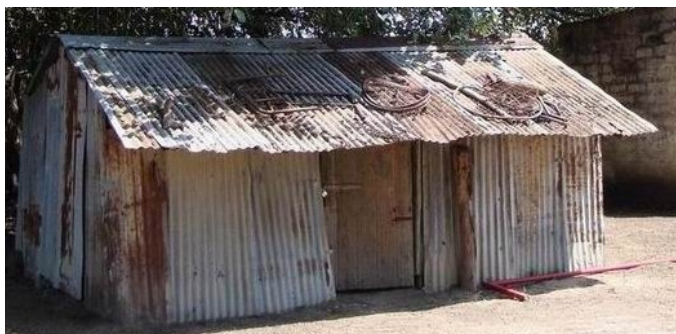
A police SALW/ ammunition store (BICC)

High temperatures in the containers have a negative effect on the life span of ammunition and can make them prone to unintended explosions.