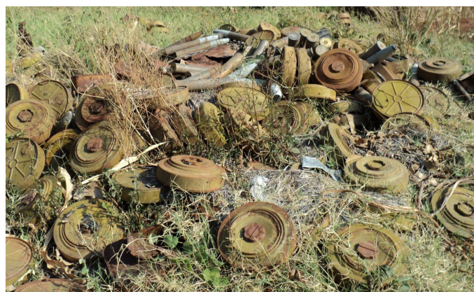
Ammunition stockpile outside

The situation in the counties outside the capital Juba is dire. The Army in particular lacks safe storage structures. High hazard class ammunition is in some cases accessible to the public, unprotected and/or not sufficiently guarded—an extremely dangerous situation.