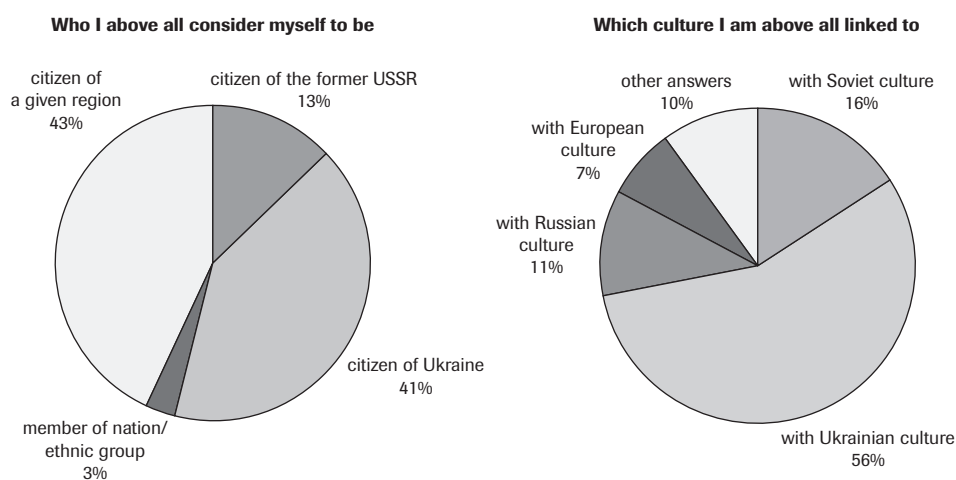
Diagram 2. How Ukrainians identify themselves