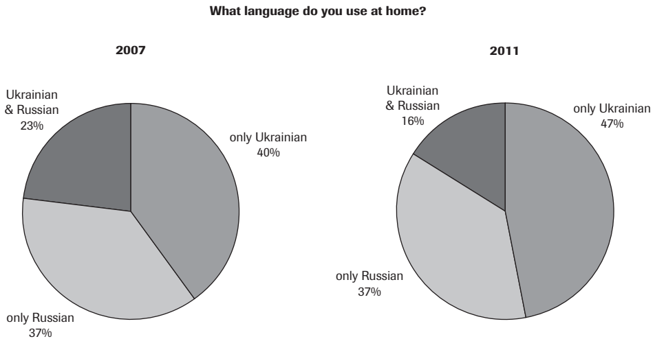
Diagram 3. Everyday language of Ukraine’s citizens