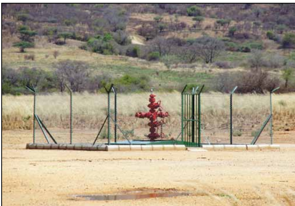
Oil well close to the village and shore of Lake Albert

The CBO representative from Buliisa expressed his disapproval of oil exploration activities taking place in the Murchison Falls National Park. He noted that villagers in Buliisa complain bitterly about the daily traffic of heavy trucks that pass through town. These churn up continuous clouds of dust, and he is concerned that similar traffic in the park is not only upsetting the environment, but also having a negative impact on animal life. In addition to the experience of being shrouded in dust clouds, the CBO representative accused government and Tullow Oil of not being transparent about findings of environmental impact assessment (EIA) studies devoted to the impact oil exploration stands to have on the area. 102 He said that: ‘We are also worried about the possible impact oil spills can have on the lake and the park.’ 103