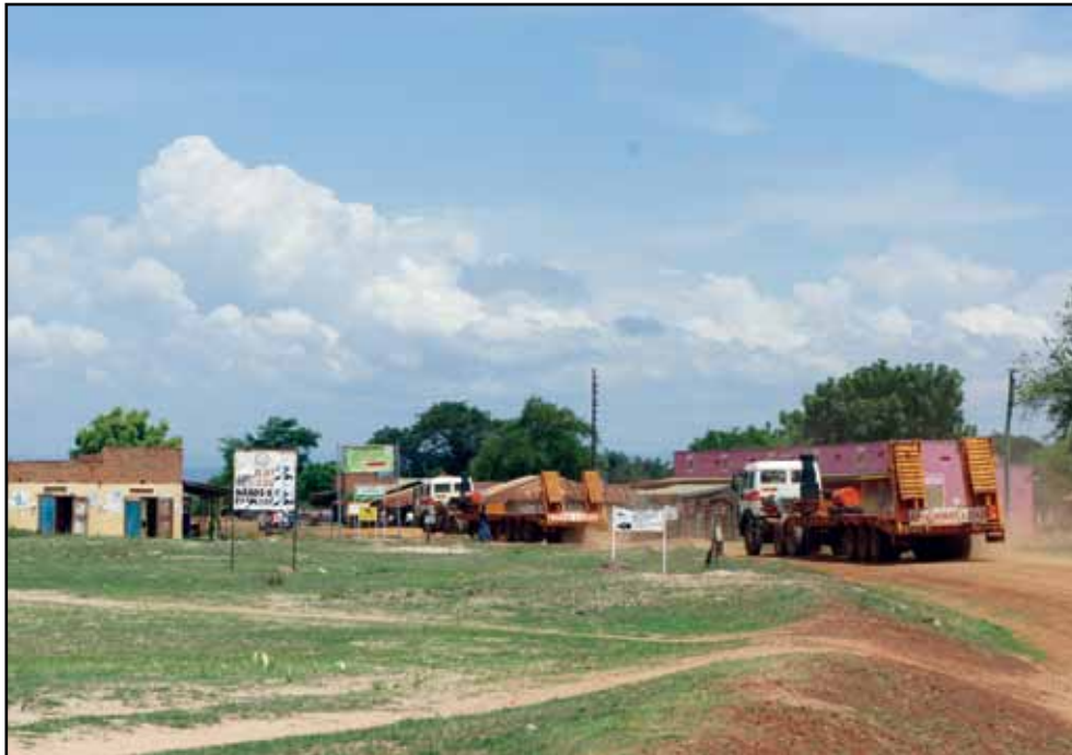
Trucks passing through Buliisa

meetings attended in the course of the fieldwork. Land in the Buliisa area is owned communally, 57 and residents therefore do not have title deeds to prove ownership. As a result, speculators have exploited this situation to access portions of land via local contacts. The community is worried that their traditional lands may be lost owing to their inability to prove ownership. The CBO representative also claimed that powerful individuals with political connections have been manipulating the land tenure situation in Buliisa. In response to this manipulation, President Museveni has imposed a moratorium on the processing of any land titles in the Buliisa area, and has ordered an investigation into shady land transactions that have already been concluded. 58