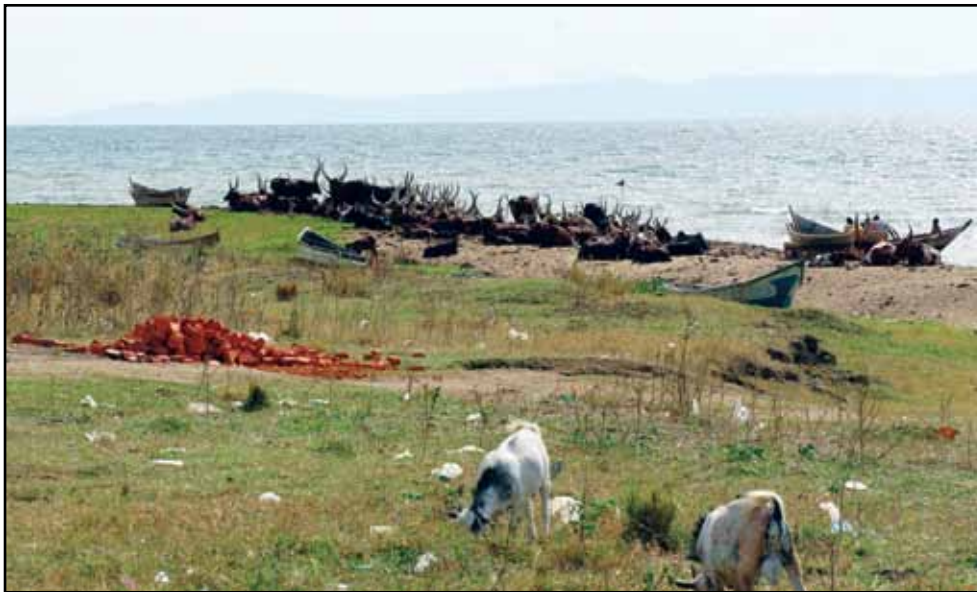
Signs of subsistence economics in the form of cattle, goats and fishing boats on the shore of Lake Albert, Tonya

Ancestral memory of life on the shore of Lake Albert stretches back for generations. This became clear during an interview with a LOCI representative. She described in some detail how ‘... my parents, grandparents, and too many generations to remember, all lived in this village.’ 92 She illustrated that although life on the lake may be tough, these are ancestral lands and the oil exploration activities have upset traditional economic practice. She said that the generations that precede her and her children ‘... all lived off the lake.’ 93 The lake is therefore much more than a static body of water for the people in Kaiso-Tonya. It is an integral part of ancestral memory while also providing the economic basis for survival. To make matters worse, she indicated that since the seismic studies were conducted in the vicinity of their village, fishermen have complained about dwindling catches. These complaints were echoed by several fishermen during the course of the fieldwork, who thought the seismic studies may have interfered with the fish breeding grounds, or the fish were scared off by the explosions and migrated to other parts of the lake. 94 Others, however, did not see a direct link between the seismic studies and dwindling fish stocks.