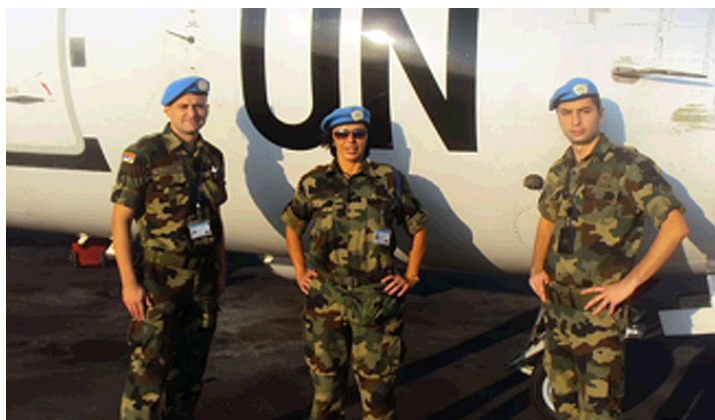
Member of SAF in the peacekeeping mission in DR Congo

Since 1972, the police have been admitting girls to their Police High School (before 2001 girls accounted for 10%), and in 2001, after they finished the relevant course, women received the possibility to be employed as uniformed police officers. Women’s share in police and MoI has since continuously grown and now women’s share in the total number of employees is 21% (Gender and Security Sector Reform, 2010).