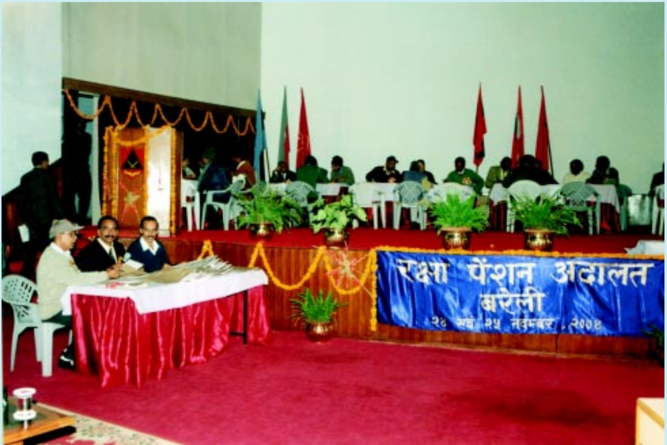
Raksha Pension Adalat