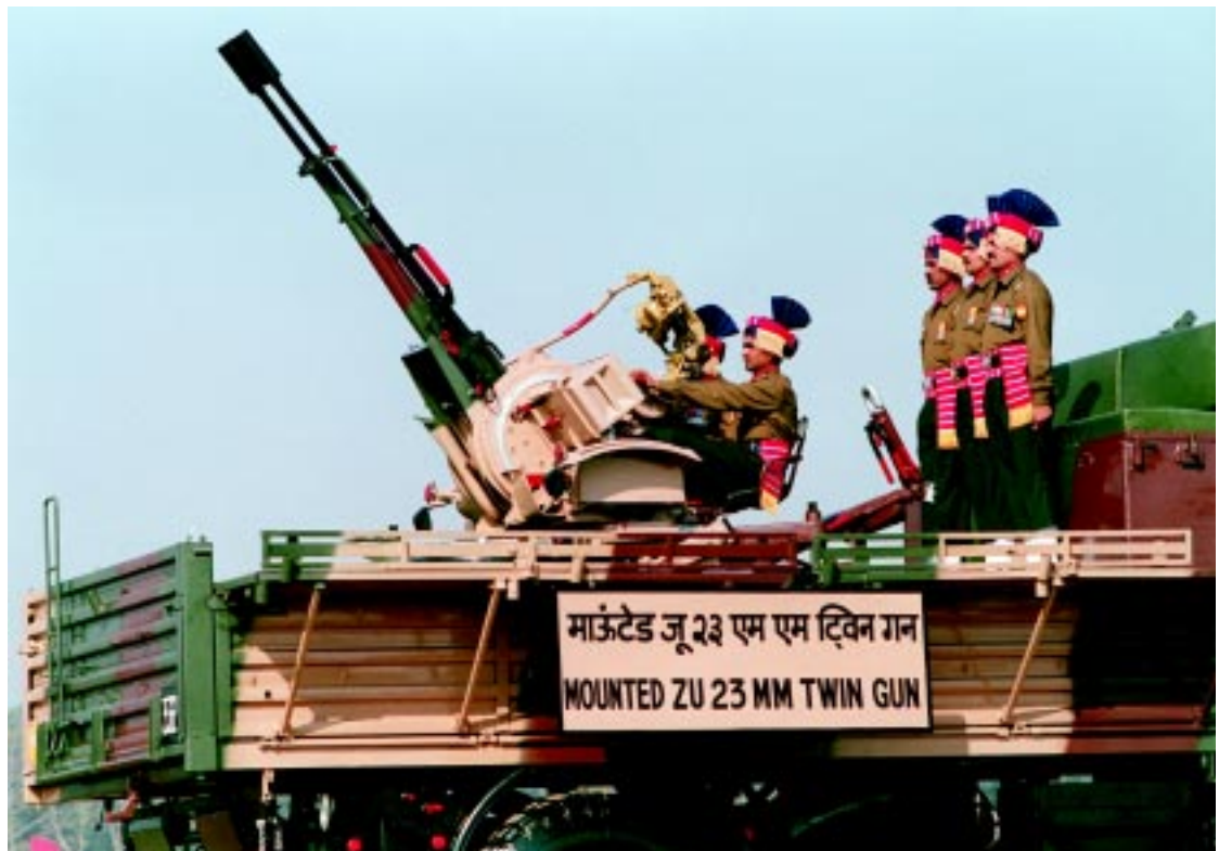
Mounted ZU 23 MM Twin Gun on display

3.2 During the year, continued efforts were made to modernize and upgrade the weapons and weapon systems of the Army, to prepare it to address the requirements of modern day warfare and enhance its combat