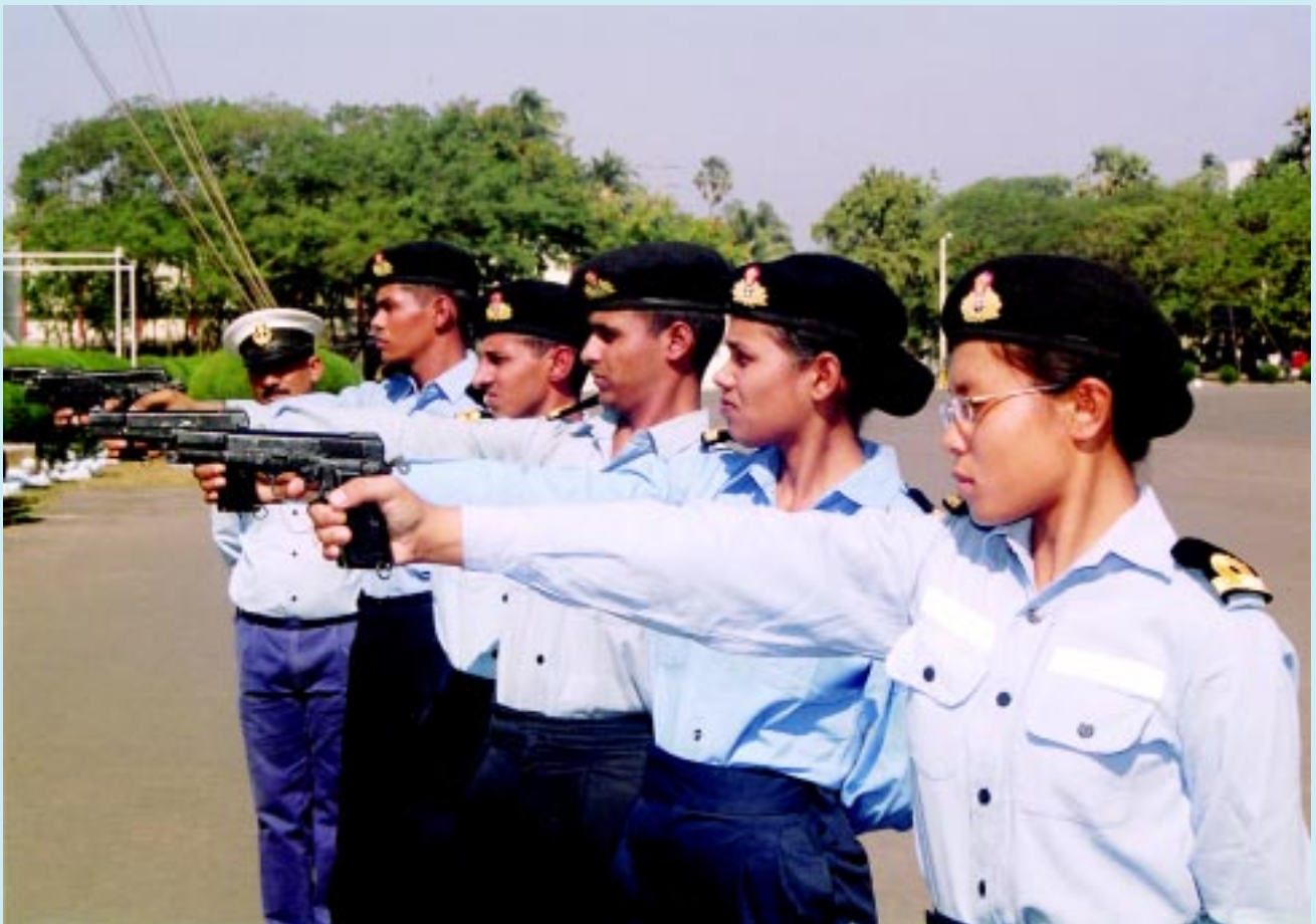
Women Naval Officers alongwith other officers practicing the small Arms Firing