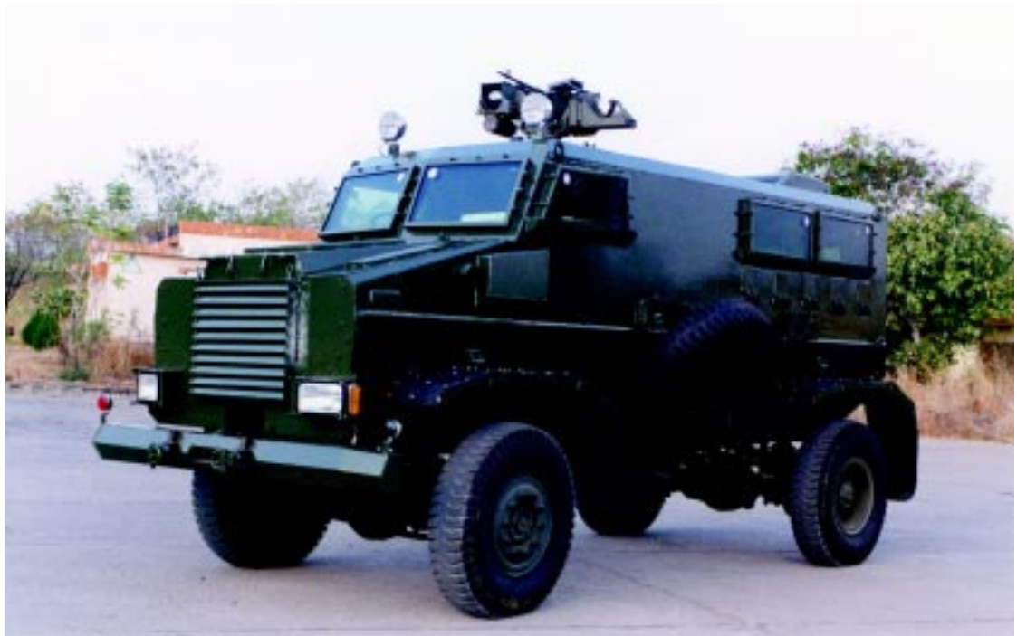
Mine Protected Vehicle with RCWS