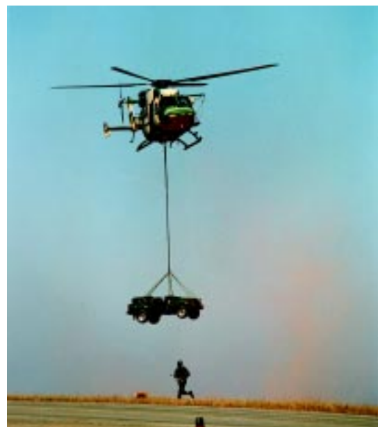
ALH 'Dhruv' helicopter airlifting a Jeep

parade, the three Service Chiefs laid wreaths at Amar Jawan Jyoti at India Gate and Air Force War Memorial at AF Station Palam. The parade was witnessed by the Marshal of the Air Force, COAS, CNS and AOC-in-C, WAC amongst other senior service dignitaries and MN & AAs of foreign missions. During the Investiture ceremony, a total of 46 awardees were invested with the awards which included VM(G), VM, Bar to VSM, VSM and Jeevan Raksha Padak Award. The parade was followed by a fly past and a first time 'Sarang Display' by Advanced Light Helicopters (ALHs), besides an aerobatics show by Surya Kiran Aerobatic Team (SKAT). In the evening on October 8, 2004, the CAS hosted a reception at Air House which was attended by the President, Vice President, Defence Minister, Leader of Opposition, Marshal of the Air Force, other service Chiefs and the distinguished invitees.