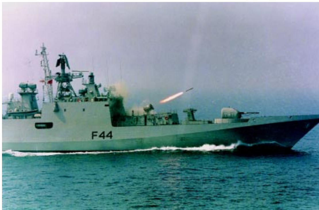
Surface to Air Missile (SAM) being fired from Indian Naval Ship

and Sujata were deployed off Maputo in Mozambique from May 23 to July 13, 2004, for providing coastal security as requested for by the Government of Mozambique, during the World Economic Forum Summit held at Maputo and Afro-Pacific-Caribbean (APC) Heads of State Summit from June 21 to 24, 2004. In addition to this IN ships provided training to over 100 personnel of the Mozambique Navy. Besides, medical officers of IN ships conducted two medical camps and treated more than 450 patients.