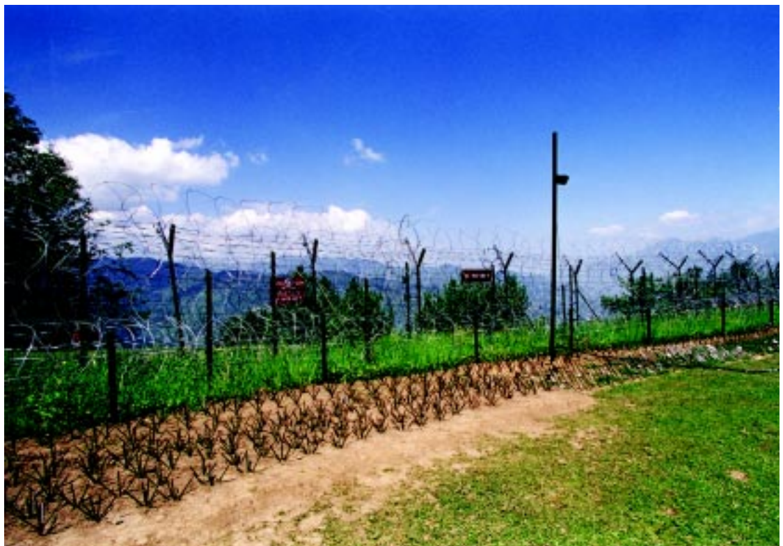
The fencing along the Line of Control helps check infiltration

1.6 India's size, strategic location, trade links and Exclusive Economic Zone (EEZ), and its security environment link India's security directly with its extended neighbourhood, particularly neighbouring countries and the