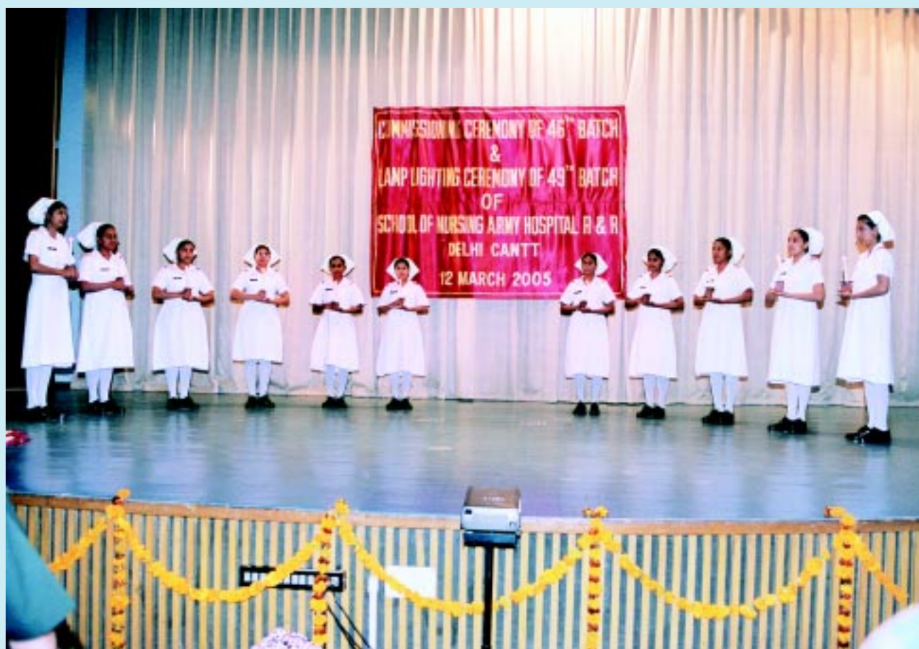
Lamp Lighting Ceremony of School of Nursing Army Hospital, Delhi Cantt.