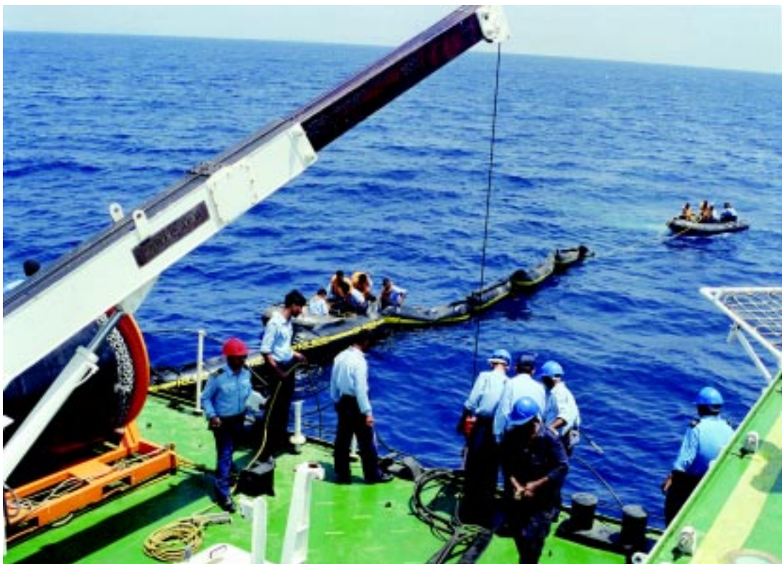
Pollution Response Operations