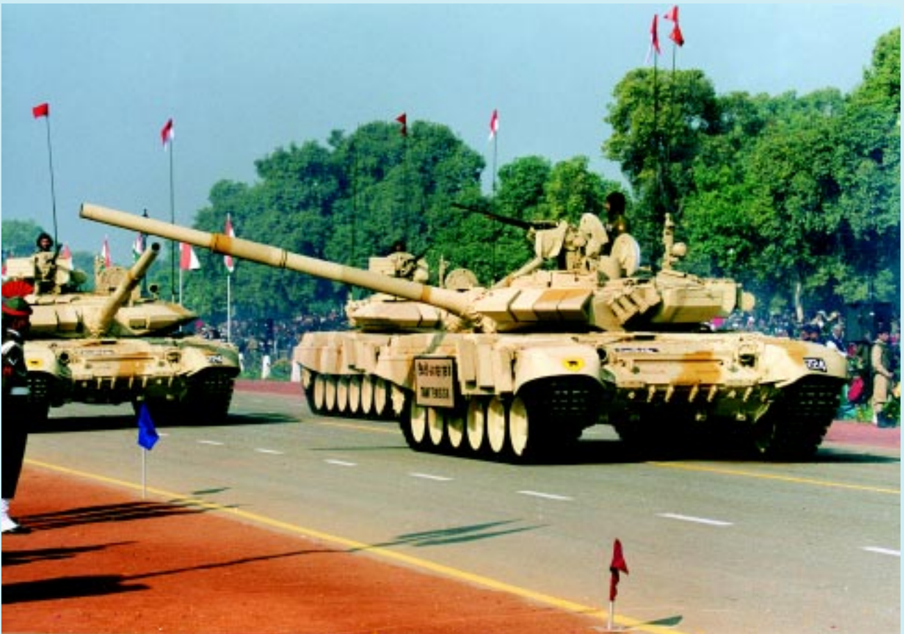
T-90 Tank on Display