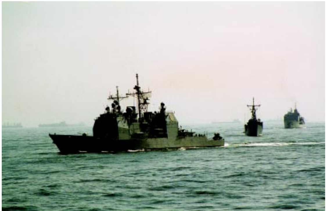
Indo-US Joint Naval Exercise 'Malabar CY 2004'

4.28 Deputation of IN Personnel for Courses Abroad: 23 personnel have been deputed abroad for training courses till end October 2004 including 12 personnel under United