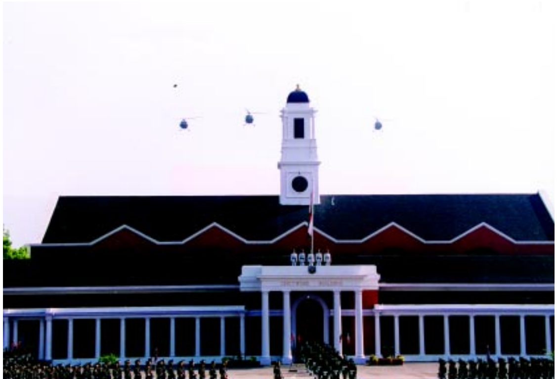
Chetwode Building : IMA

countries like Maldives, Mauritius, Lesotho, Palestine and Bhutan.