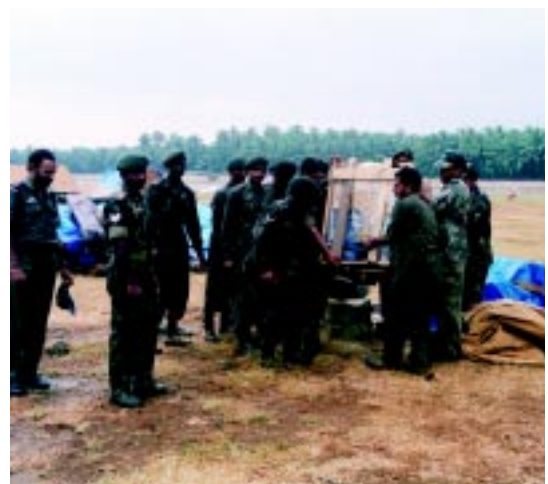
Army in relief operation in the Tsunami affected area

12.3 The Armed Forces have since been committed in one of the largest relief operations. Response to the disaster was launched on a war footing and the tri-service coordination team under HQ IDS was set up immediately on December 26, 2004. The relief not only included assistance within the country, but also to Sri Lanka, Maldives and later to Indonesia. The response was coordinated through the Interim National Command Post (INCP).