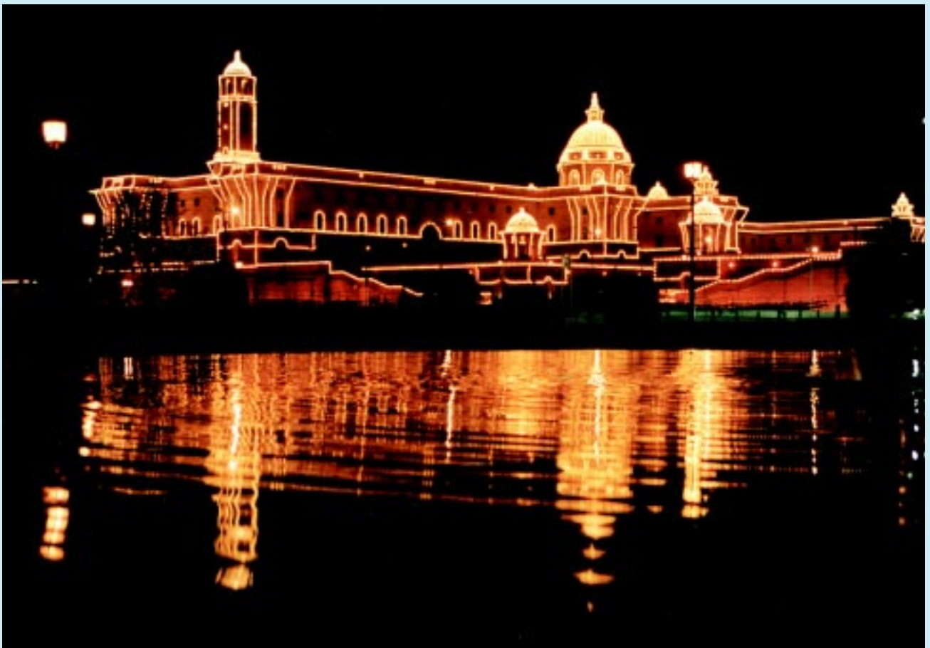
An illuminated view of the South Block which houses the Ministry of Defence