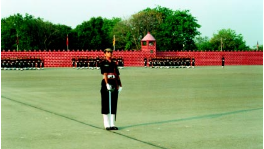
Passing out parade in OTA

portals for entry of women as commissioned officers. Initially 50 lady cadets were commissioned every year, with the entries limited to Army Service Corps, Army Education Corps, Judge Advocate General's Department, Corps of Engineers, Signals and Electrical and Mechanical Engineers. Approximately 100 Lady Officers get commissioned from OTA every year.