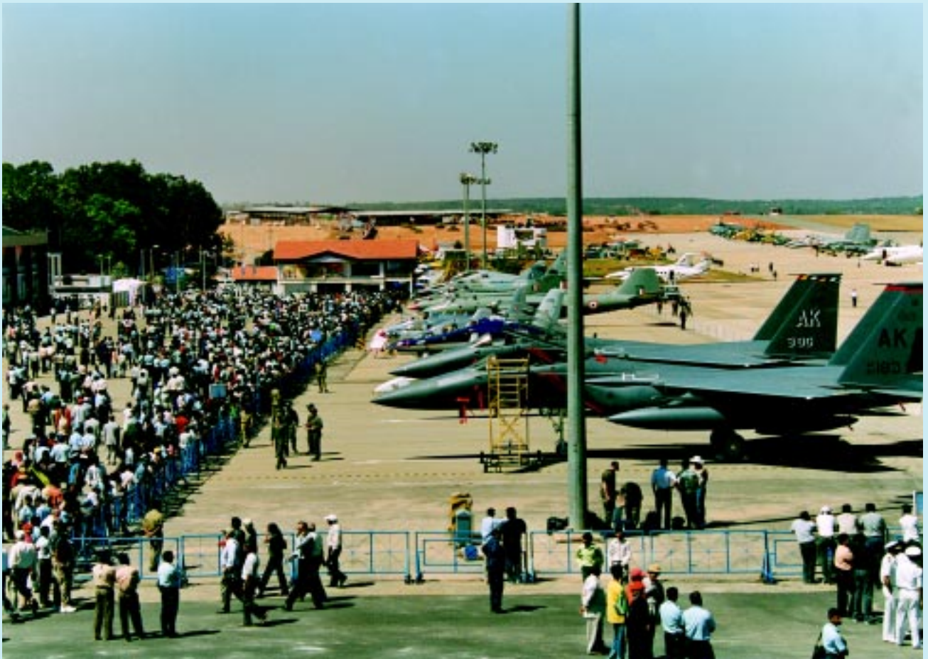
Visitors at the 'Aero India 2005'