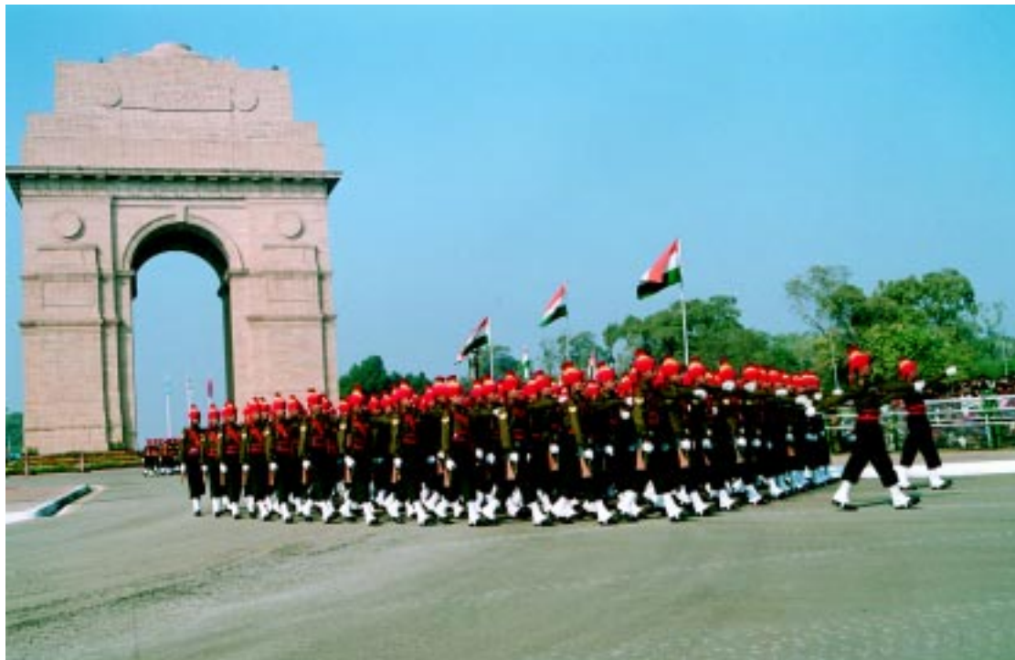
Jawans during Republic Day Parade

furled the National Flag on the ramparts of the Red Fort, to the accompaniment of the National Anthem played by the Services Band. A 21 gun salute was also presented on the occasion followed by the Prime Minister's address to the Nation. The ceremony concluded with the singing of National Anthem by the children and the NCC Cadets from schools of Delhi and release of balloons. After the functions at Red Fort, the President laid wreath at the Amar Jawan Jyoti at India Gate paying homage to the memory of those who sacrificed their lives for the freedom of the nation.