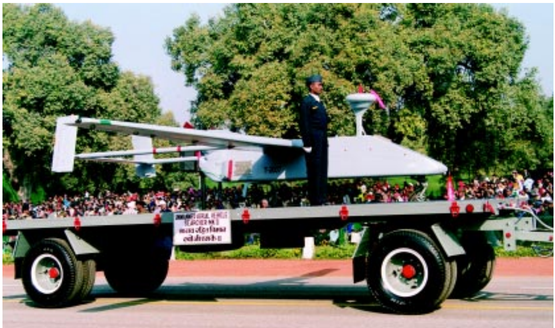
Unmanned Aerial Vehicle Searcher MK-II on Display

In addition to the above, 49 awards of Mention-in-Despatches were also announced on the Republic Day.