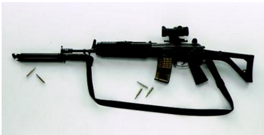
Rifle 5.56 MM INSAS Excalibur

7.10 As a policy, major thrust is being given in Ordnance Factories to achieve optimum capacity utilization not only by securing additional workload from the Defence Forces