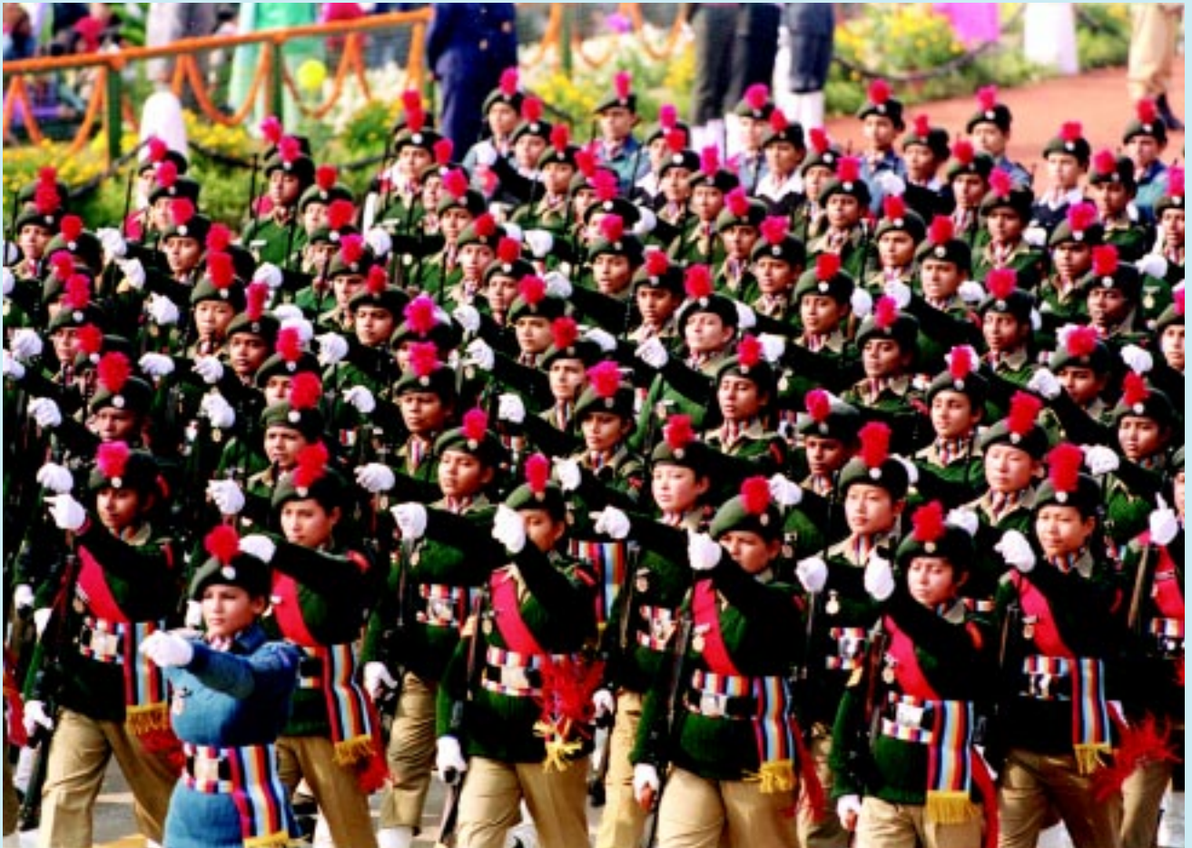
NCC Cadets during Republic Day Parade