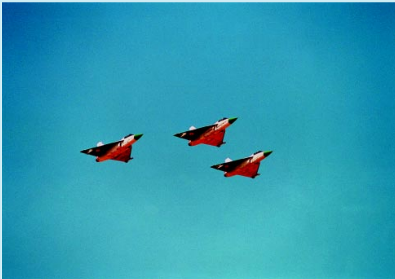
LCA Tejas in flying formation