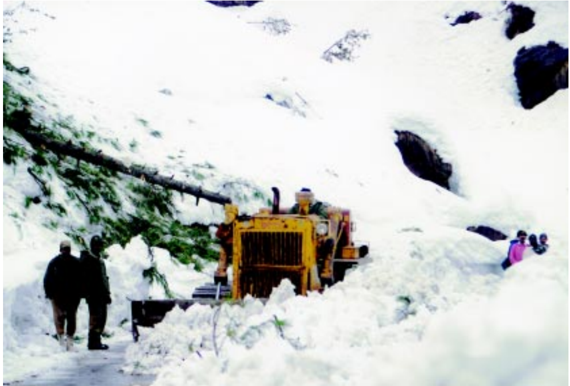
Army bulldozer clearing deadly snow cover on National Highway in Jammu and Kashmir

12.17 Election Duties: IAF was pressed into Lok Sabha and State election duties in the country. A total of 2429 personnel and 3565 tons of load was airlifted to forward areas in North/Eastern sectors and sensitive areas in the country, for carrying out the election duties. The flying effort contributed greatly towards efficient conduct of elections in the year 2004.