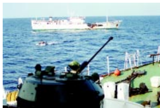
Investigation of suspect Vessel during Search and Rescue Operation

6.8 Distress situations at sea demand rapid response: Coast Guard ships and aircrafts undertook various search and rescue missions and were instrumental in saving 125 lives, 4 ships and 12 boats during the year. The major search and rescue operations are as given below.