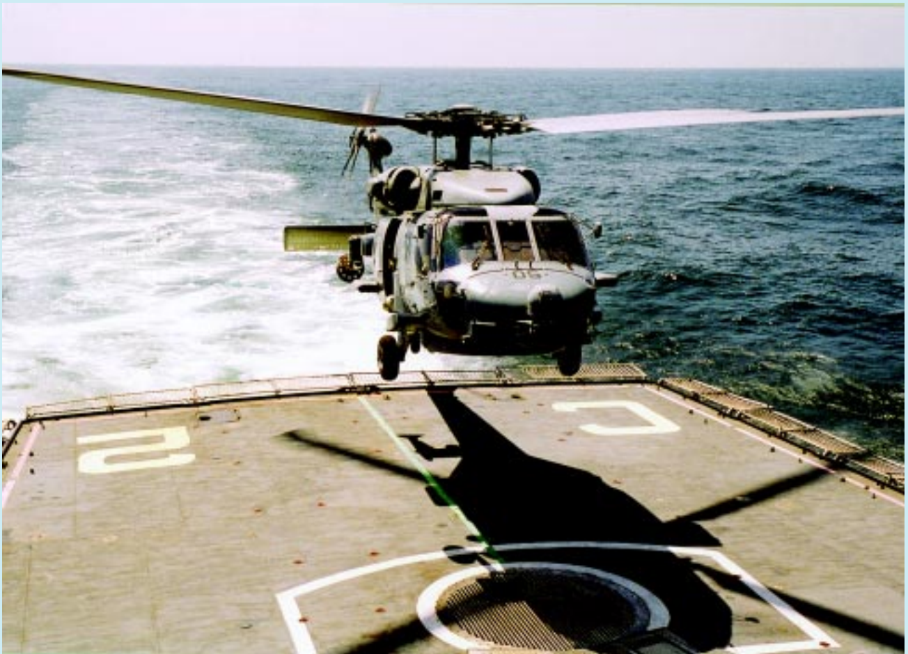
A US Naval Helicopter landing on INS Mysore during Indo-US Joint Naval Exercise