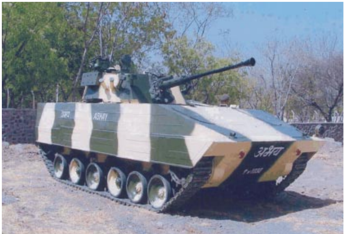
Futuristic Infantry Combat Vehicle 'ABHAY' (Armoured Prototype)

8.35 First pilot vehicle of armoured amphibious engineer recce vehicle on BMP-II, has been cleared by the Army. Three vehicles are expected to be ready for handing over to Army by mid 2005, out of the ordered 16 Recce vehicles. Order for six vehicles of armoured amphibious dozer (AAD) on BMP-II has been placed by Army. Vehicles will be offered to Army for clearance by the middle of 2005.