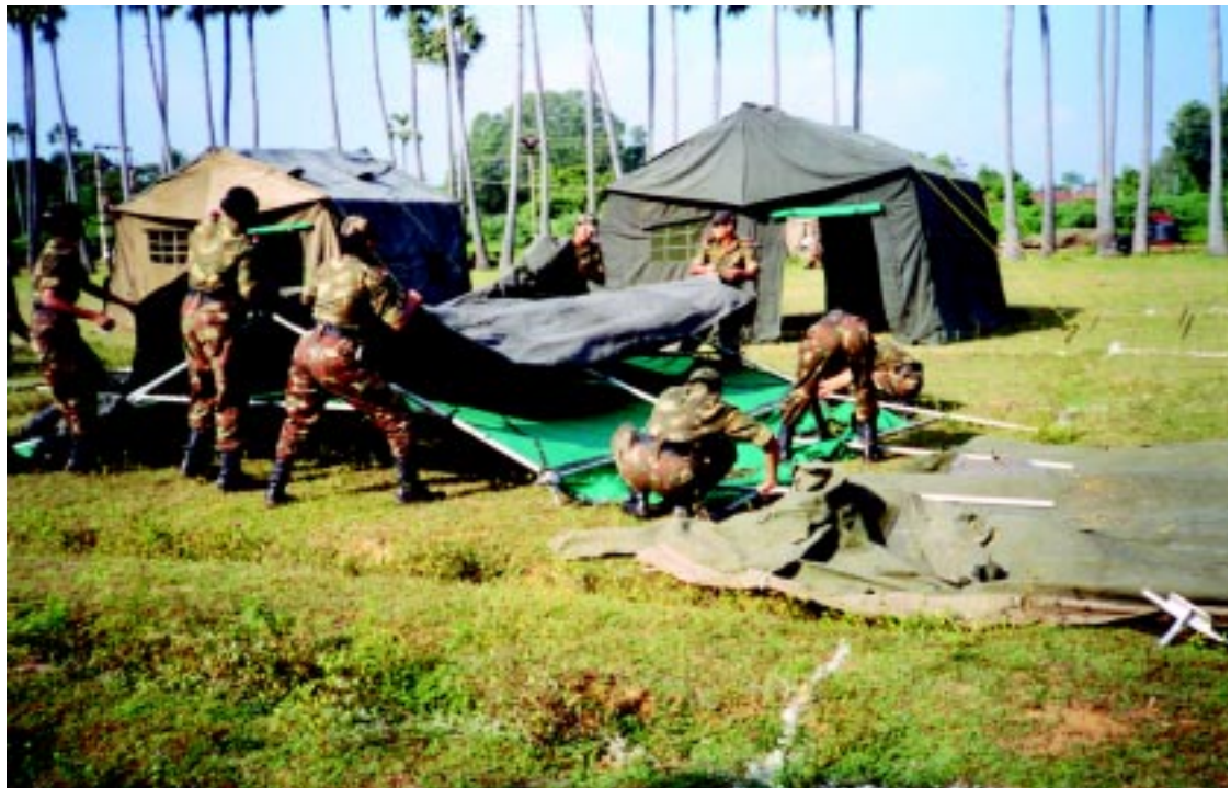
Girl Cadets during Tent Pitching Competition

17.3 Indian Army: Women candidates can be inducted in the Indian Army against certain identified vacancies in various Arms/Services through the Women Special Entry Scheme (Officers). Women are offered Short Service Commission for a period of 10 years, extendable