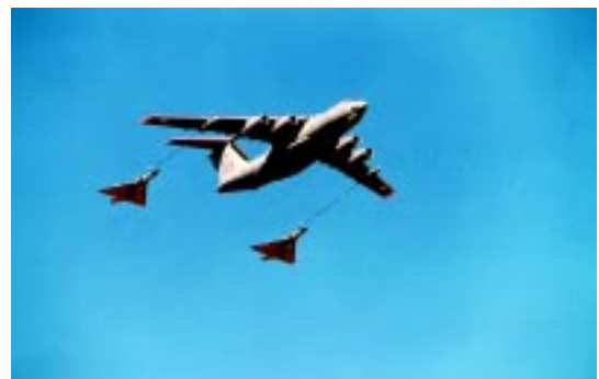
An IL-78 Aircraft refuelling Mirage 2000 Fighter Aircraft

5.19 The proposal of IAF for manpower requirement and restructuring is under consideration of the Government.