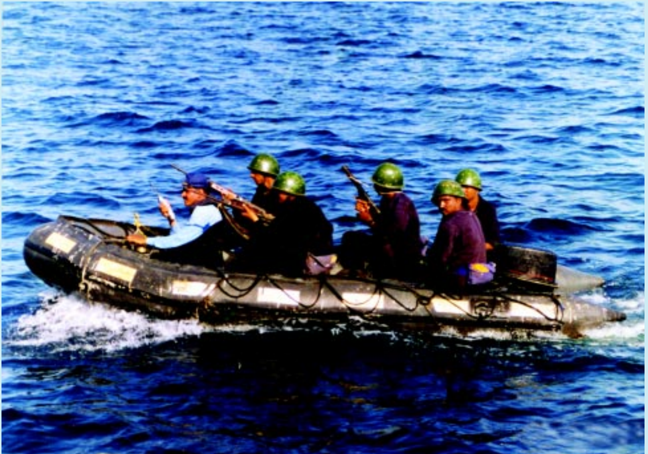
Coast Guard : Lean, Visible and Efficient Force