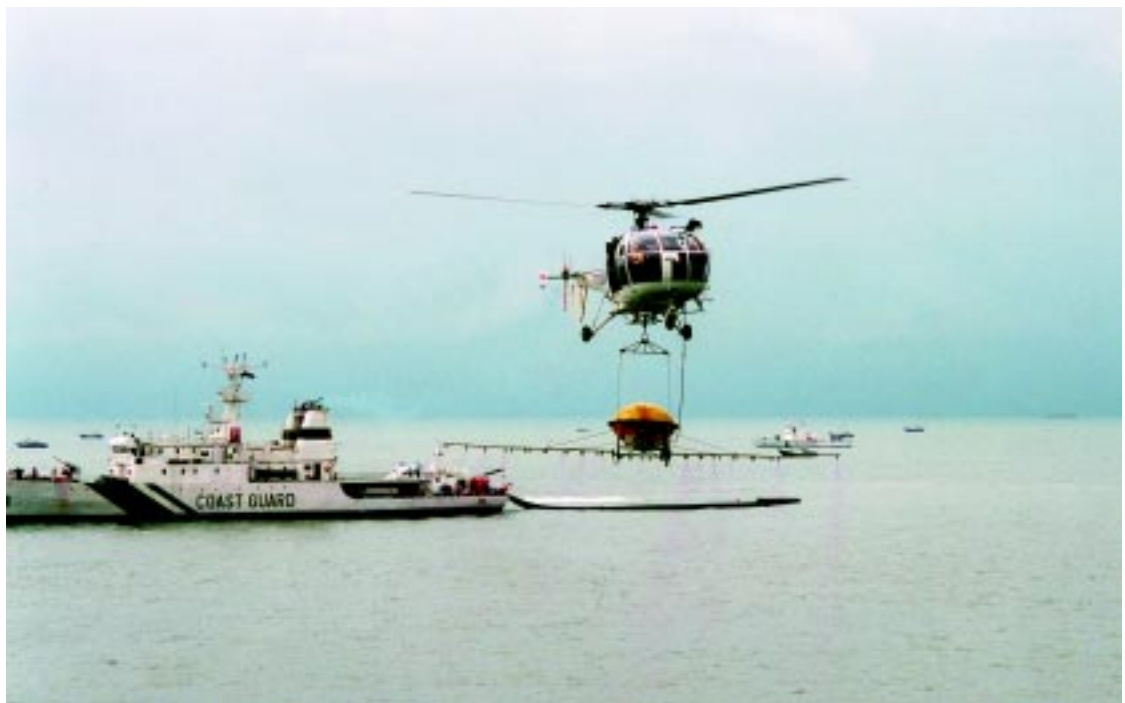
A Coast Guard helicopter demonstrating the Oil Pollution Control Unit

6.2 The Command and Control of the Coast Guard is exercised by the Director General, from the Coast Guard Headquarters at New Delhi. The entire coastline of India and the maritime zones are divided into three Regions with Regional Headquarters situated at Mumbai, Chennai and Port Blair. The Regions are further divided into Coast Guard Districts, each representing a