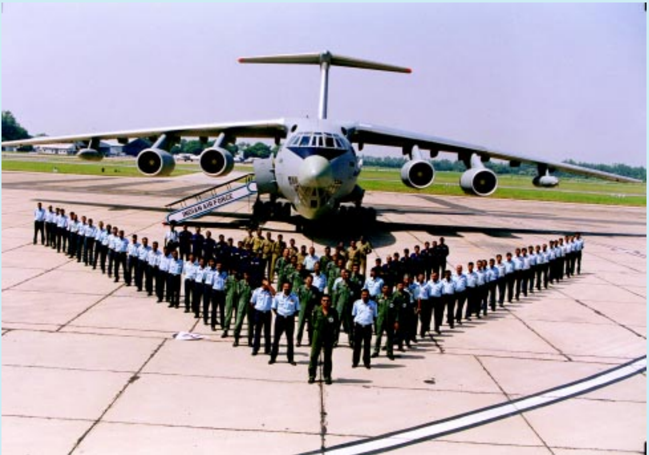
Airmen with their Aircraft