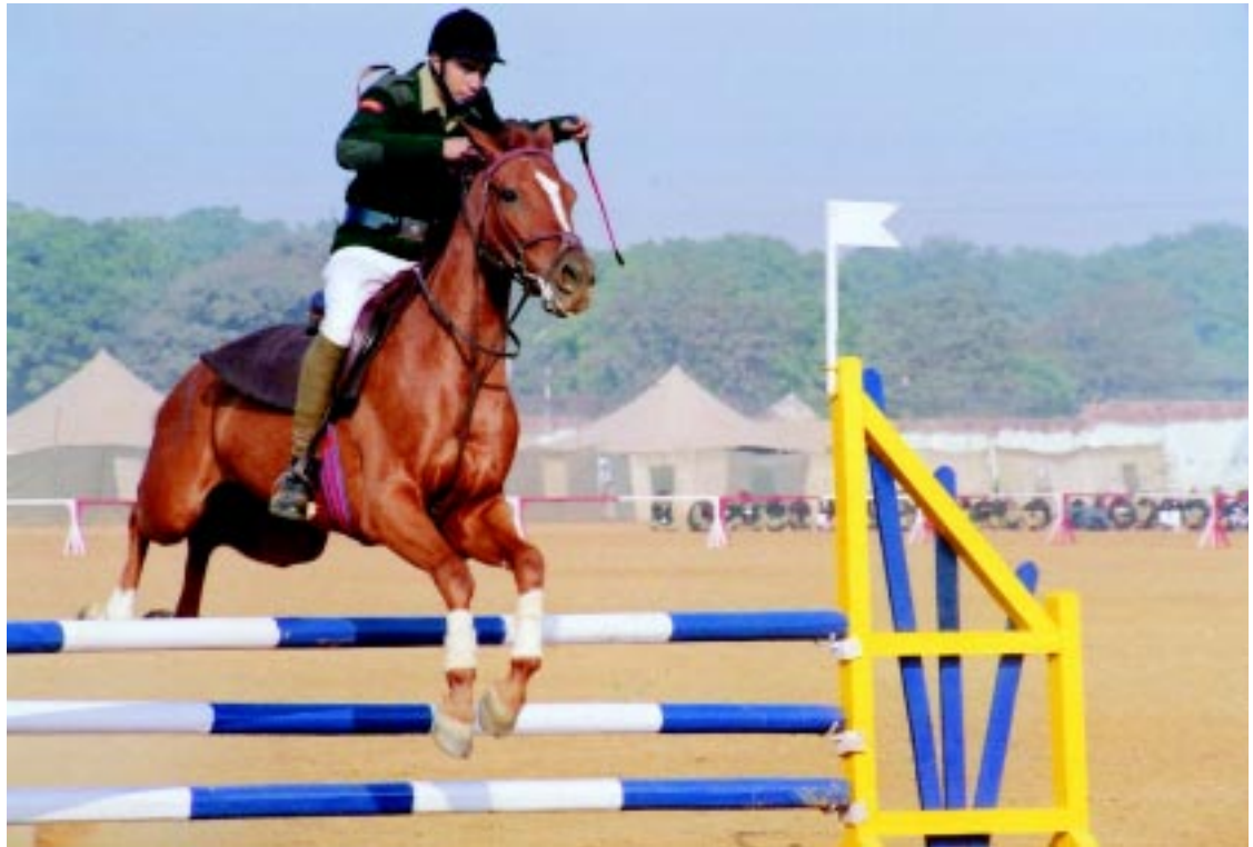
Horse Show by NCC Cadet

Directorates viz., Kerala and Lakhshadweep Directorate and Madhya Pradesh and Chhattisgarh Directorate organised rock climbing camps for Senior/Junior Division boys and Senior/Junior Wing girls.