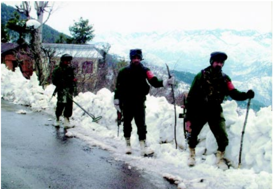
Army Patrol Team Searching IED in snow covered area in J & K

people manifold. There appears a genuine yearning for normalcy, peace and rejection of violence amongst the people with successful J&K Elections in 2004. The 'healing touch' policy of the State Government has also been well received by the civil population. A record number of yatris (3.82 lakhs) visited the Holy Cave of Amarnath this year. Tourist influx to the Valley is also expected to reach an all time high during this season. As part of the ongoing peace process and Confidence Building Measures (CBMs), a reduction in troops deployed in J&K has been effected. This decision is likely to give an impetus to the peace process and further improve the prevailing environment.