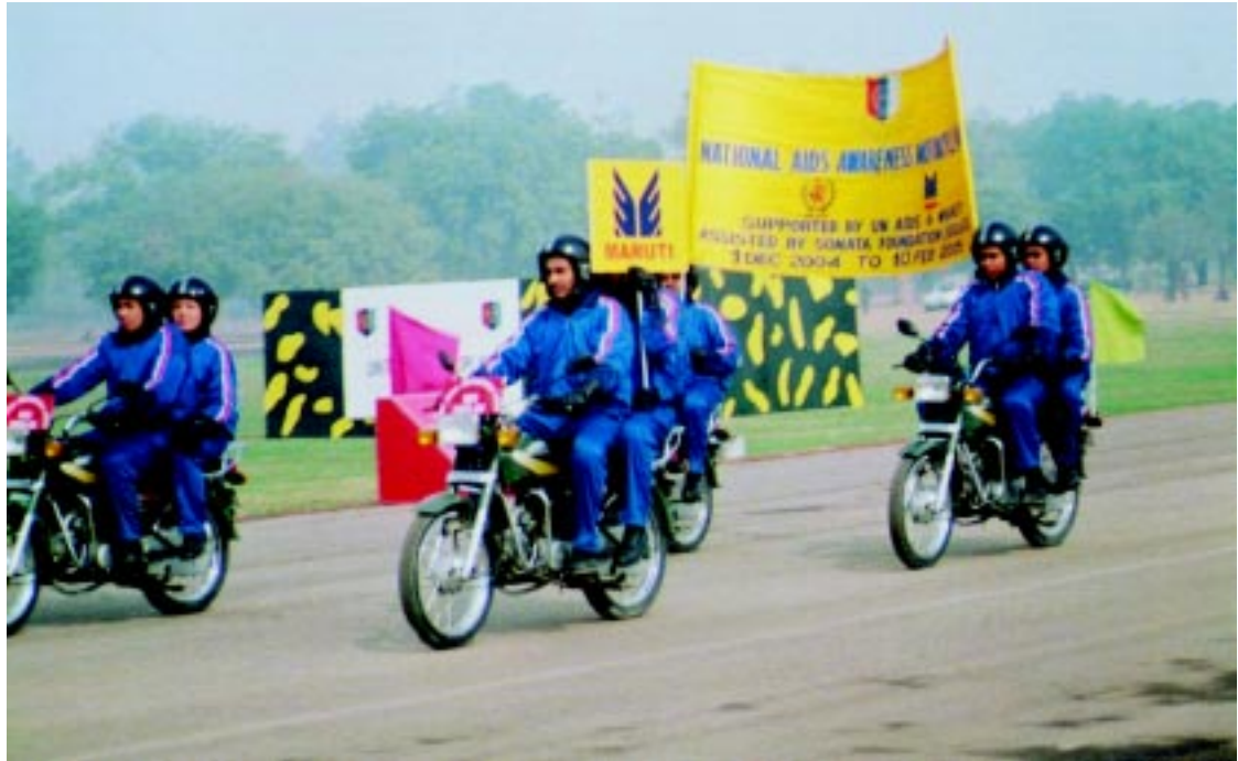
Aids Awareness Rally by NCC cadets