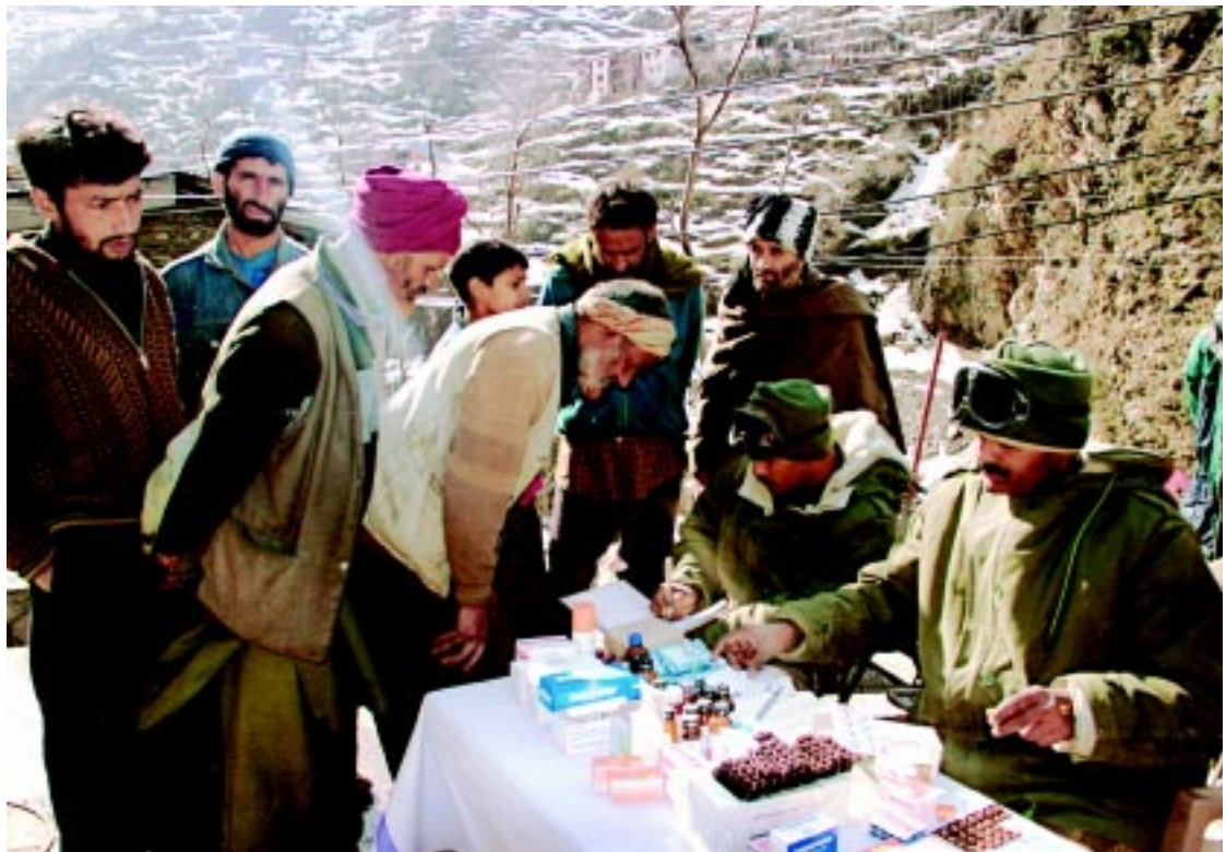
Medical assistance to stranded civilians by Army in snow covered areas