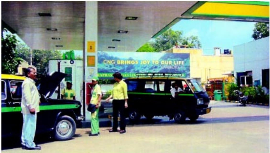
CNG Station being managed by Ex-Servicemen

11.18 Coal Transportation Scheme: DGR sponsors Ex-Servicemen Coal Transport Companies for the execution of loading and transportation of coal in various coal subsidiaries of Coal India Limited (CIL). Unemployed retired officers and JCOs registered with DGR, are