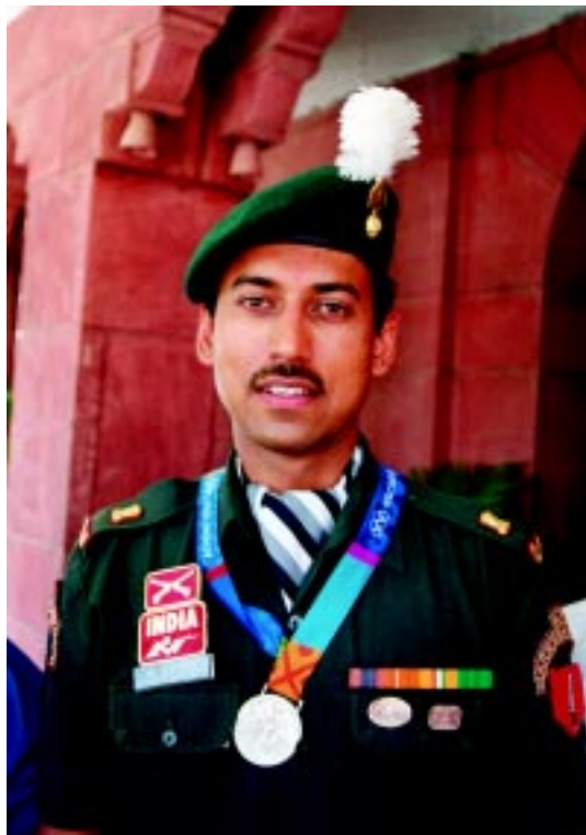
Major Rajyavardhan Singh Rathore

9.45 Olympic Games 2004: Olympic Games 2004 were held at Athens, Greece from August 13 to 29, 2004. Five Services' sportsmen and two officials were deputed as part of the Indian contingent. Major Rajyavardhan Singh Rathore won a silver medal in shooting double trap competition.