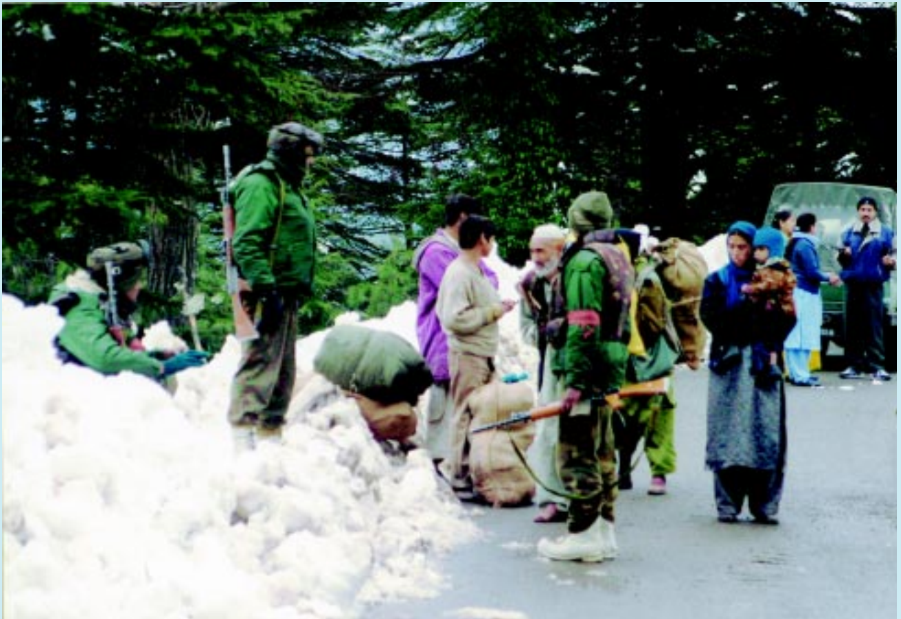
Army shows its humane face by providing help to the needy