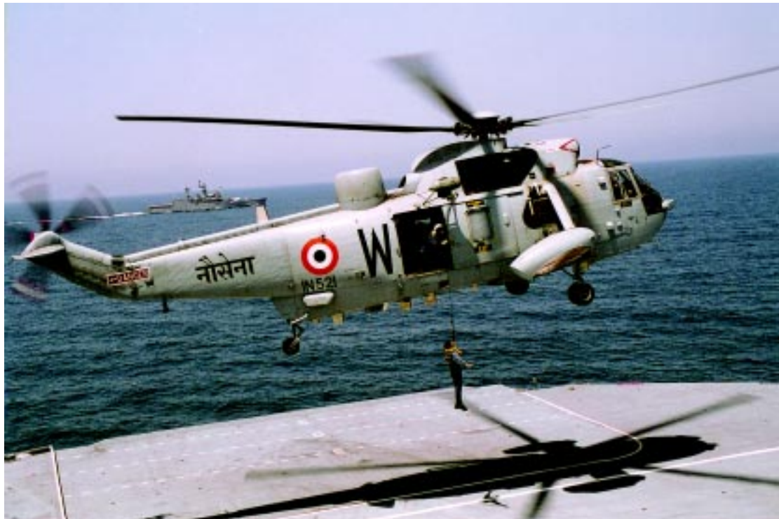
Marine Commando slithering down from a Sea-King Helicopter onboard INS Viraat

expansion of their influence, remain causes of serious concern for India.