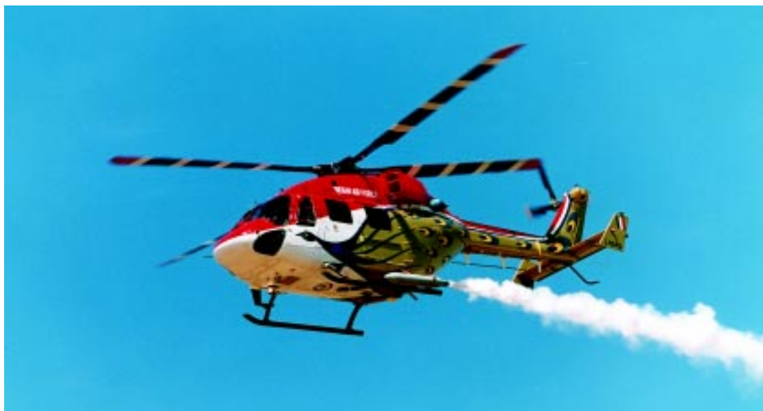
Advanced Light Helicopter (ALH) of Sarang Team in flight

5.3 In addition to peacetime training for traditional wartime roles, the IAF has provided significant aid to civil authorities during the flood relief operations in Assam, Arunachal Pradesh and Bihar during the year. The IAF was also the first to react after the Tsunami struck in December 2004. Over and above the extensive relief operations in Andaman & Nicobar Islands, aid was also extended to Sri Lanka and Maldives. The Siachen Glacier lifeline continues to be maintained by the Indian Air Force, alongwith the additional areas along the Line of Control (LoC), fully supporting the operations/exercises of the Indian Army in the world's highest battlefield.