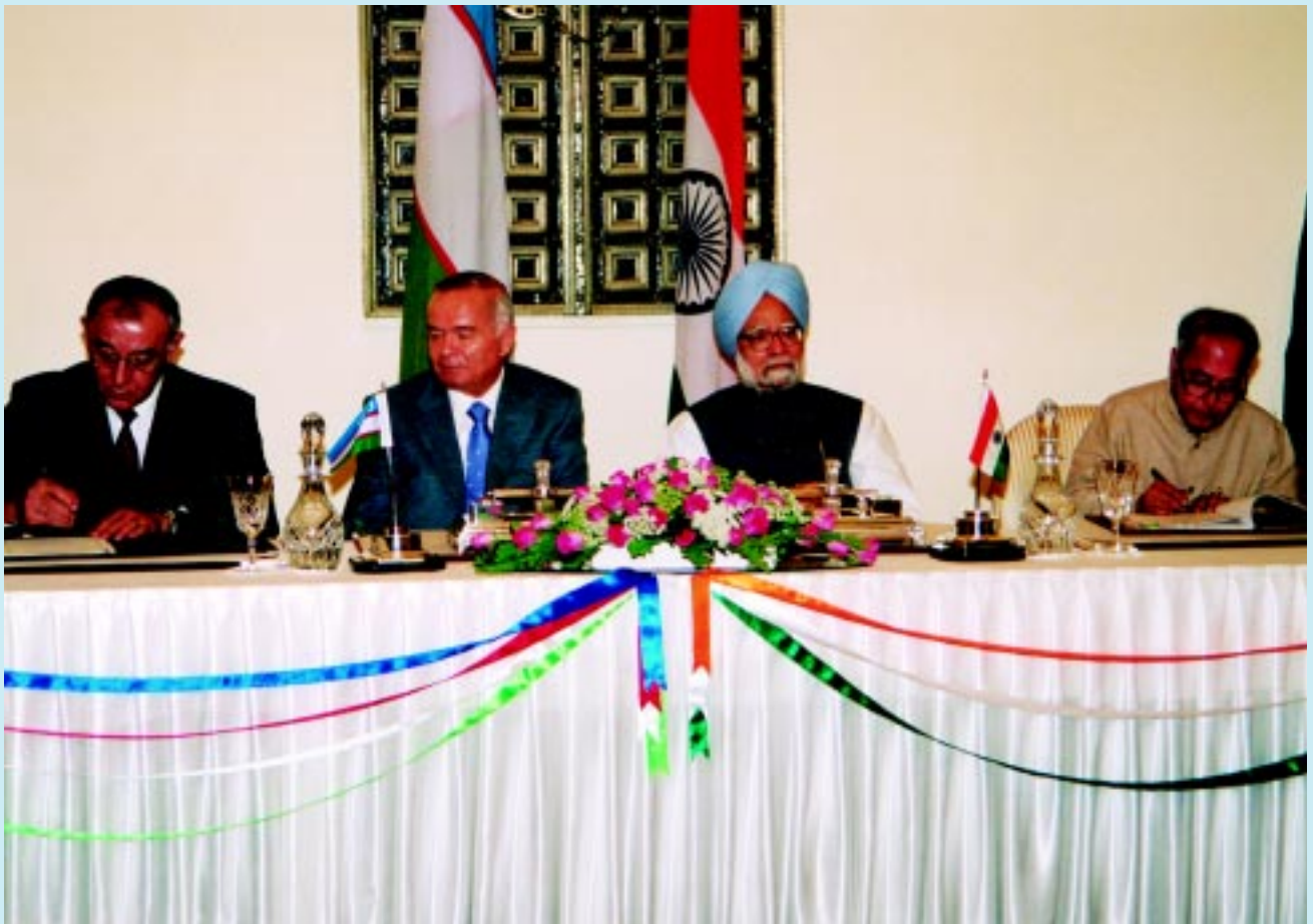
Prime Minister and Raksha Mantri with Uzbek President and Defence Minister signing an MoU on Defence Co-operation