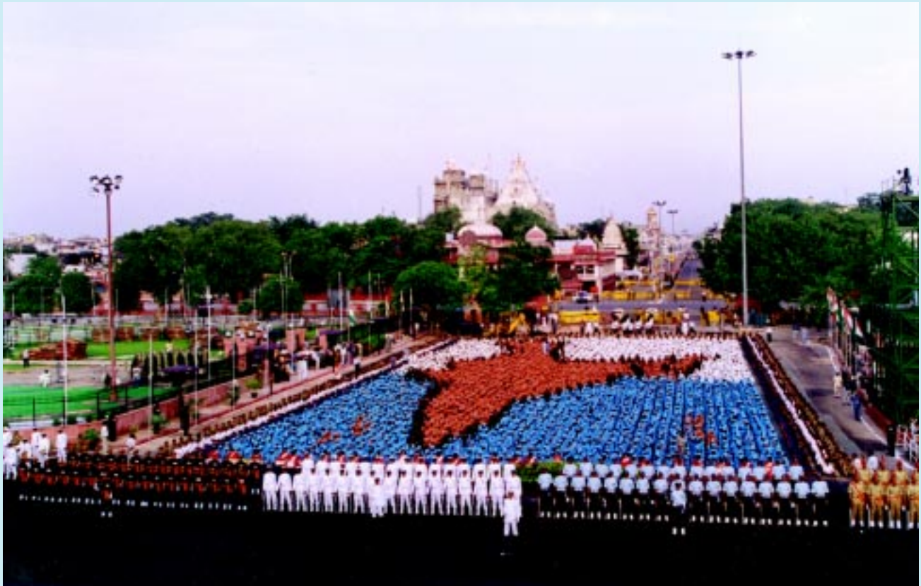
Independence Day Celebrations