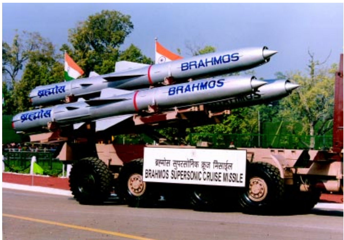
Brahmos Supersonic Cruise Missile on display

1.24 India's response to these multiple threats and challenges has always been restrained, measured and moderate, consistent with its peaceful outlook and reputation as a peace-loving country. Diplomacy remains India's chosen means of dealing with these challenges, but effective diplomacy has to be backed by credible military power. India's strategic and security interests require a mix of land-based, maritime and air capabilities, and a minimum credible deterrent to thwart the threat