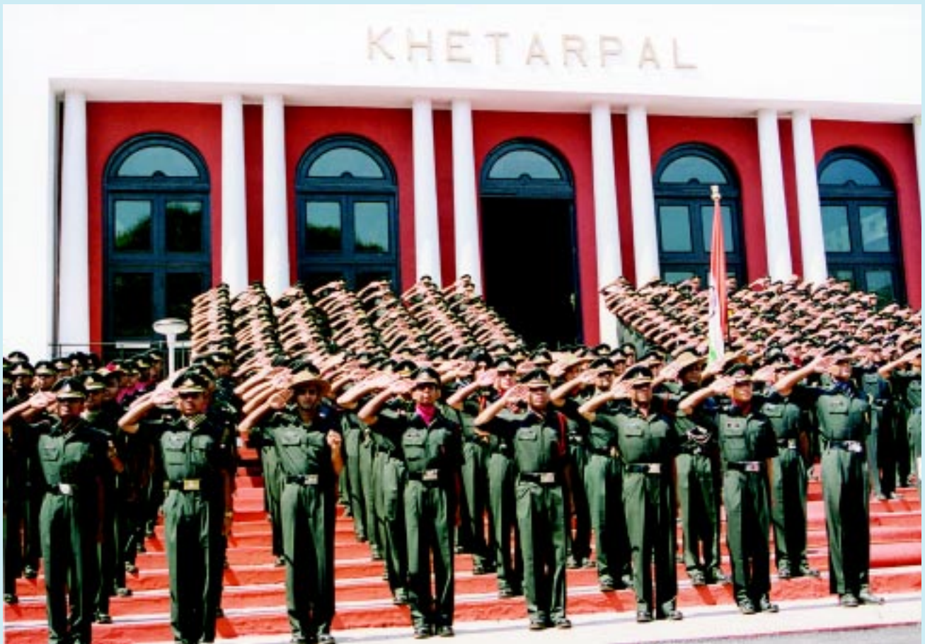
Commissioning Ceremony at IMA