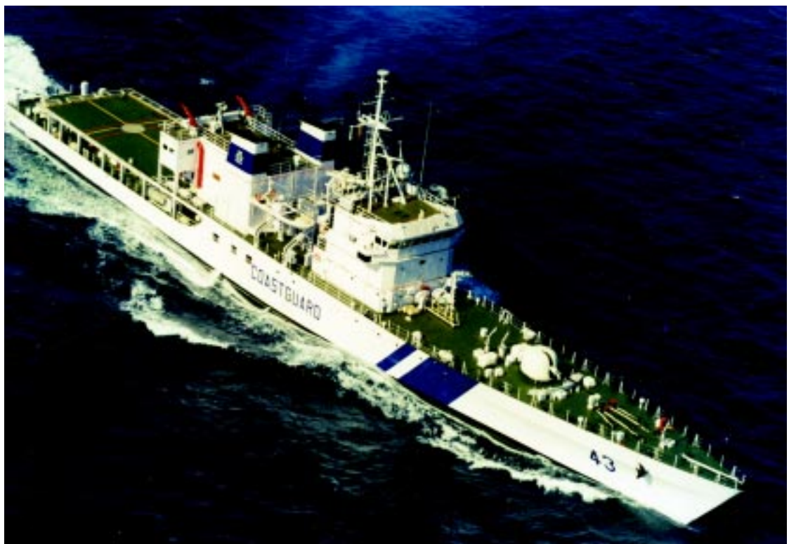
Off-shore Patrol Vessel manufactured by GRSE