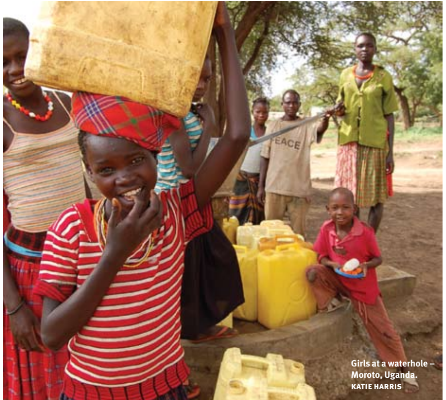
Girls at a waterhole – Moroto, Uganda. KATIE HARRIS

Ultimately, fully integrating conflict sensitivity into all development programming will help create a virtuous circle, with development being less seriously undermined by violent conflict while at the same time having the most positive impact on the causes of violence.