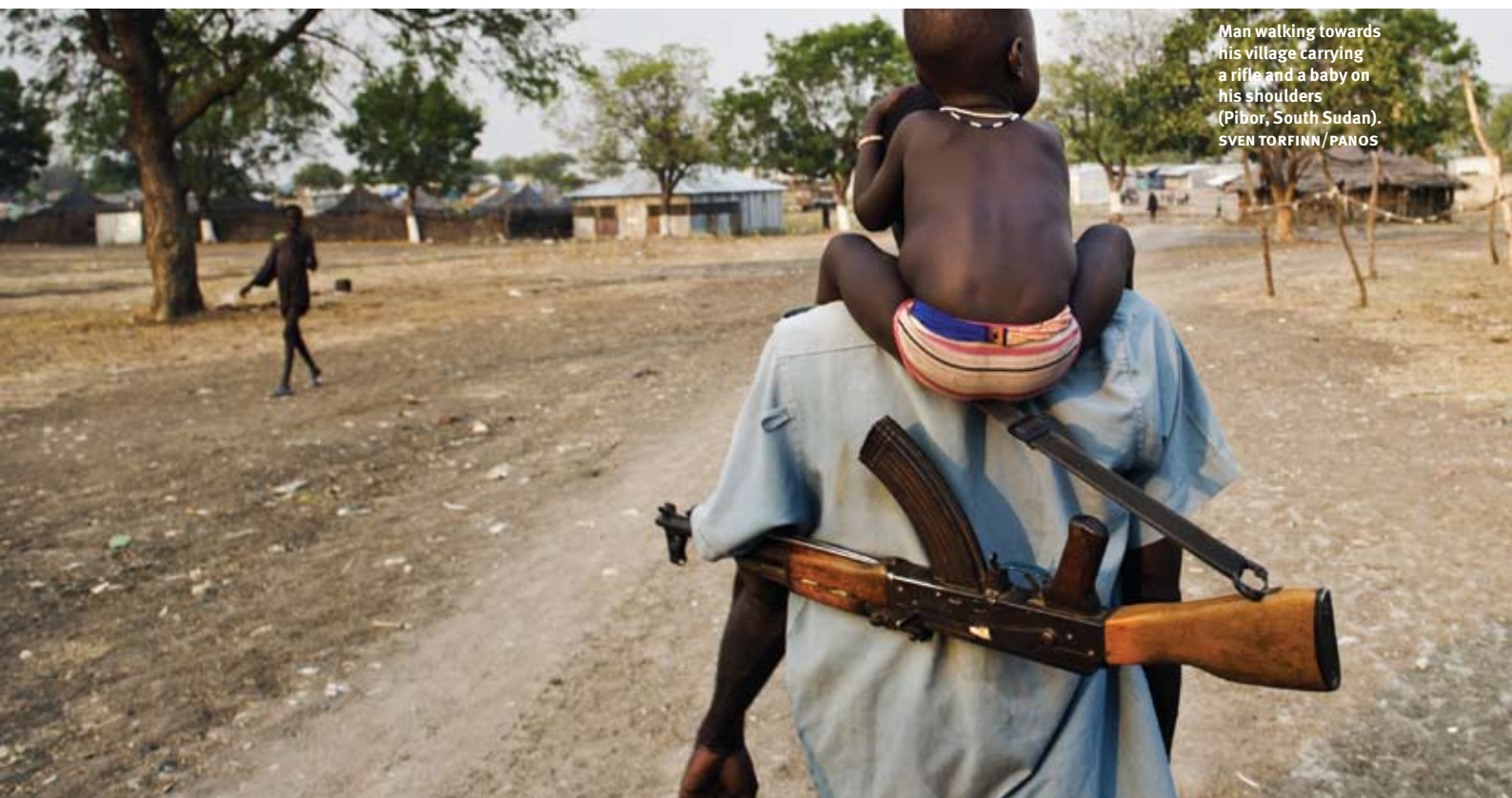
Man walking towards his village carrying a rifle and a baby on his shoulders (Pibor, South Sudan).