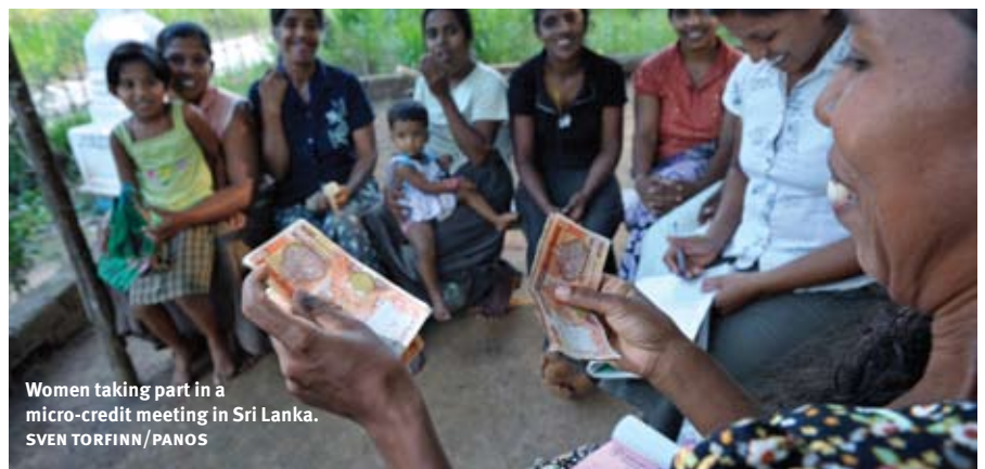
Women taking part in a micro-credit meeting in Sri Lanka.

Council Conclusions on Security and Development, 2007