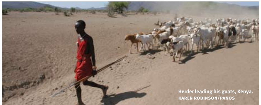
Herder leading his goats, Kenya.

Undertaking a ‘conflict analysis’ is key to developing a conflict-sensitive approach (see section: What is a conflict analysis? ).