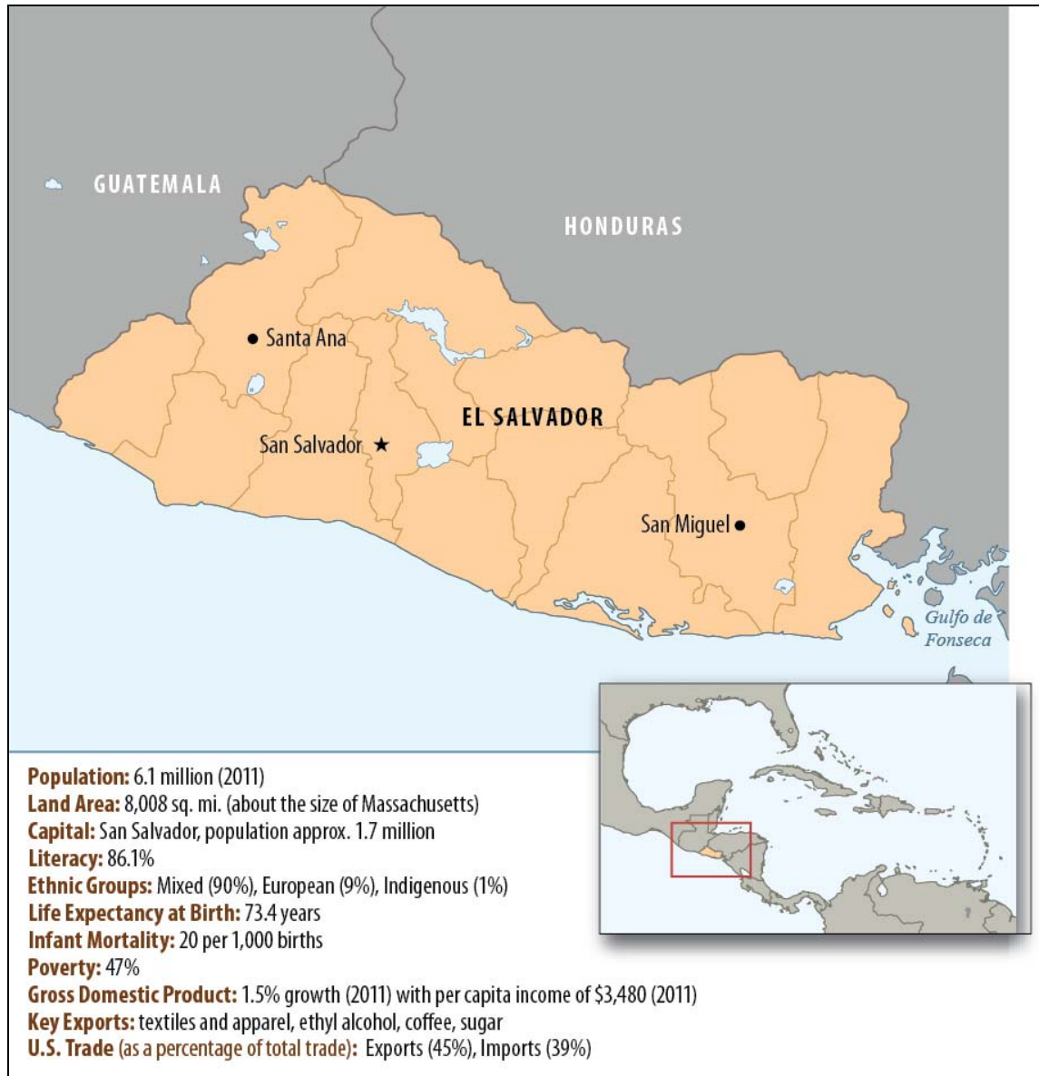
Figure I. Map and Data on El Salvador