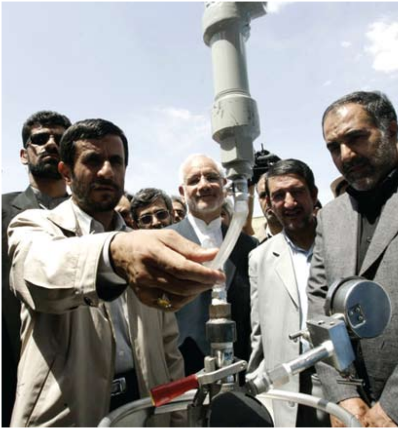
Iranian President Mahmoud Ahmadinejad (left), inaugurates a heavy-water nuclear facility in the central Iranian town of Arak, Aug. 26, 2006. The heavy-water production plant went into operation despite UN demands that Iran roll back its nuclear program.

stated explicitly in October 2006 that the European “dialogue” with Iran had to continue even if their nuclear talks failed. 7