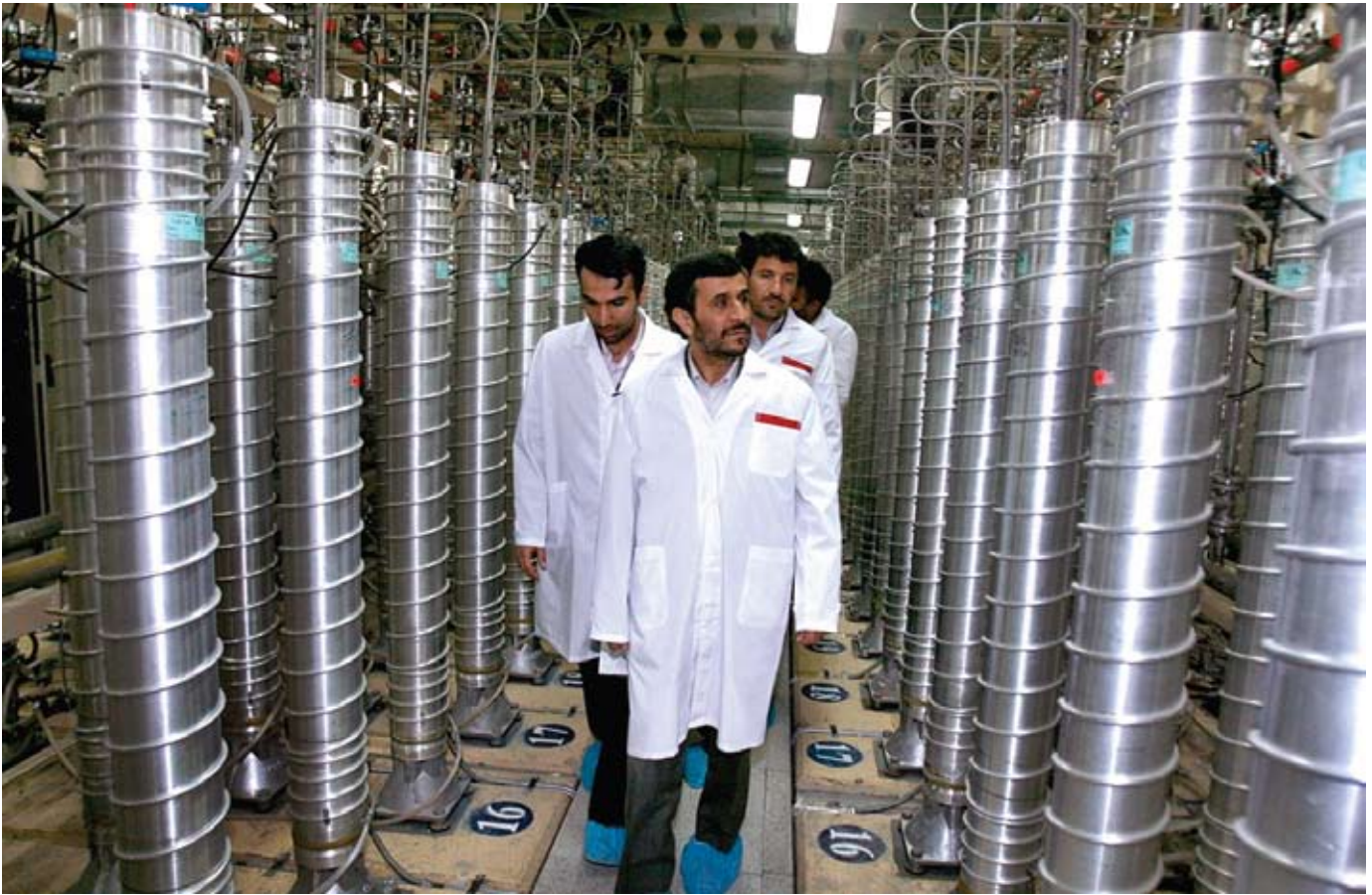
Iranian President Mahmoud Ahmadinejad visits the Natanz Uranium Enrichment Facility on April 8, 2008. Ahmadinejad announced major progress in Iran's push for nuclear power, saying that his nation was installing thousands of new uranium-enriching centrifuges and testing a much faster version of the device.

we know that Iran was attempting to procure fast high voltage switches suitable for a nuclear weapons system. The ministry of defense was also supervising the mining of uranium in southeast Iran's Kuchin mine.