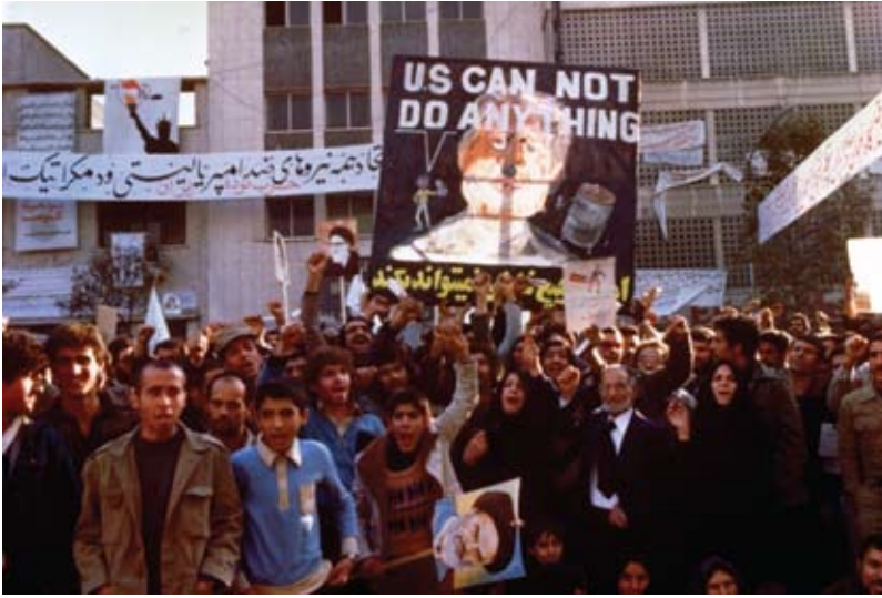
Militant Iranians chanting outside the U.S. Embassy in Teheran, November 8, 1979, a few days after their takeover of the American compound. A poster caricaturing President Jimmy Carter is in the background.