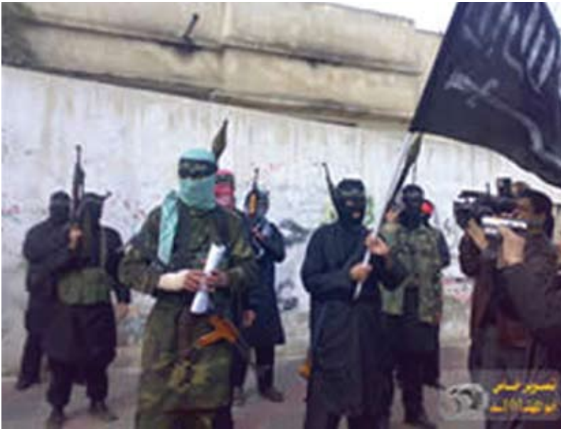
A group called "Jaysh al-Ummah" - Army of the Nation, Jerusalem - is yet another global jihad offshoot in the Gaza Strip. Since the Hamas takeover of the Gaza Strip, there has been an increase in the propaganda and terrorist activities carried out by radical Islamic groups associated with al-Qaeda and the global jihad. In this picture: some of the group's masked, armed, and uniformed operatives at a press conference in Khan Yunis.

has thus become a flourishing refuge for Islamist terror organizations who view Western Christianity as the primary enemy of Islam in the twenty-first century and the struggle against Israel as part of the larger battle for establishing an Islamic caliphate that will pursue the decisive battle against Christianity. Under the protection of the Hamas government, various terror organizations enjoy a free hand to pursue terror attacks against Israel and launch missiles at Israeli communities. The Hamas government has reiterated that the armed struggle against Israel is legitimate and that no measures will therefore be taken against those who participate in that fight. 18