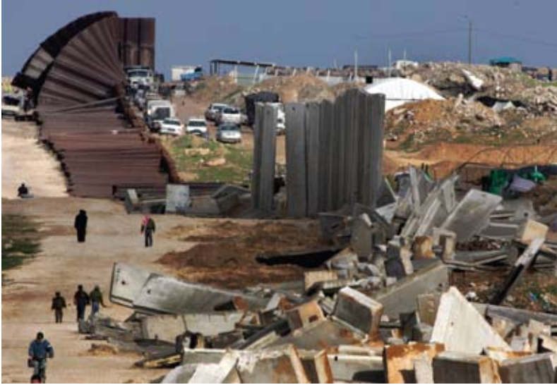
Palestinians pass by the destroyed part of the Egyptian-Gaza border in Rafah, southern Gaza Strip, Jan. 31, 2008. Hundreds of thousands poured across the breached border.