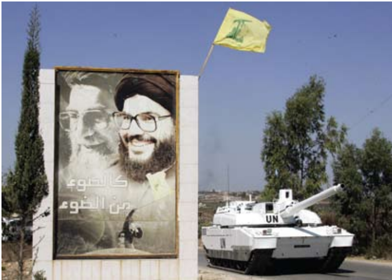
A French UN peacekeeper's Leclerc tank passes a billboard showing Iran's Supreme Leader Ayatollah Ali Khamenei (left), and Hizbullah leader Sheikh Hassan Nasrallah (right), on the road in the village of Borj Qalaway, Lebanon, Sept. 19, 2006.

to power in 2005 – into a broader and more ambitious Iranian campaign that seeks to achieve regional supremacy. The tightened Iran-Syria-Hizbullah-Hamas axis serves the goal of Iranian power projection across the Middle East, from the Gulf States to Iraq, through Syria into Lebanon, and southward to Gaza. Israel now faces Iranian-backed military groups on two borders; meanwhile, Iran's deep involvement in the insurgency in Iraq, and its penetration of the Iraqi government, reflects Teheran's desire to bloody America and make its presence in the region as costly as possible, as a step toward destroying the prevailing international order that America enforces.