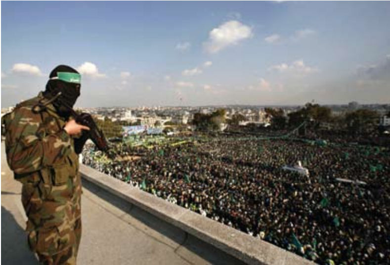
Hamas militant stand guards as thousands of supporters gather as Palestinian Prime Minister Ismail Haniyeh, not seen, delivers a speech during a rally in Gaza City, Dec. 15, 2006.