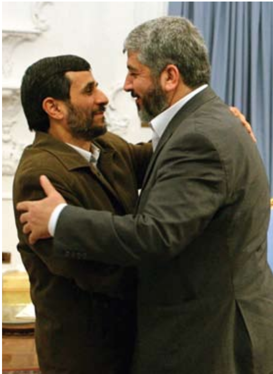
Iranian President Mahmoud Ahmadinejad (left) welcomes leader of the militant Palestinian group Hamas Khaled Mashaal in Teheran, March 6, 2007.

Force, the goal of which, he said, was the replication of a Hizbullah proxy force in Iraq that would act according to the interests and instructions of Teheran. 96 An April 8, 2008, Washington Post editorial noted, “The proxy war in Iraq is just one front in a much larger Iranian offensive,” 97 while Crocker had accused Iran of “meddling” in Afghanistan, Lebanon, and Gaza, in addition to Iraq. 98