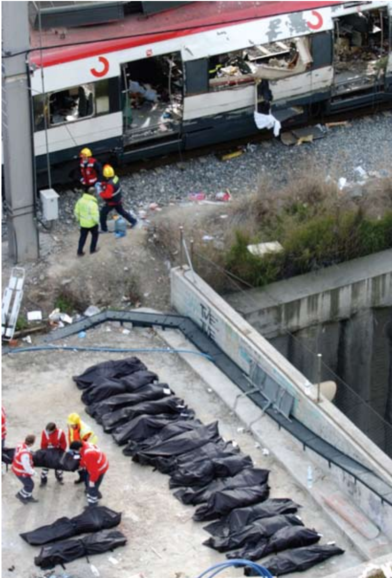
Rescue workers line up bodies beside a bomb-damaged passenger train at Atocha station following a number of explosions on trains in Madrid on March 11, 2004. The 10 blasts on the Madrid commuter rail network killed 191 people and wounded more than 1,500. Spain's worst terrorist attack was claimed by Muslim militants who said they had acted on behalf of al-Qaeda to avenge the presence of Spanish troops in Iraq.

to disarm Hizbullah. Instead of holding Seniora accountable for allowing the Iranian proxy group to operate from within sovereign Lebanon, the international community actively engaged Lebanon and Hizbullah in frantic UN-sponsored diplomacy to broker a cease-fire and deploy 15,000 UN forces to Southern Lebanon. This was a strategic error by the West. The international community should have established collective "red lines" and demonstrated unified political determination with respect to Hizbullah.