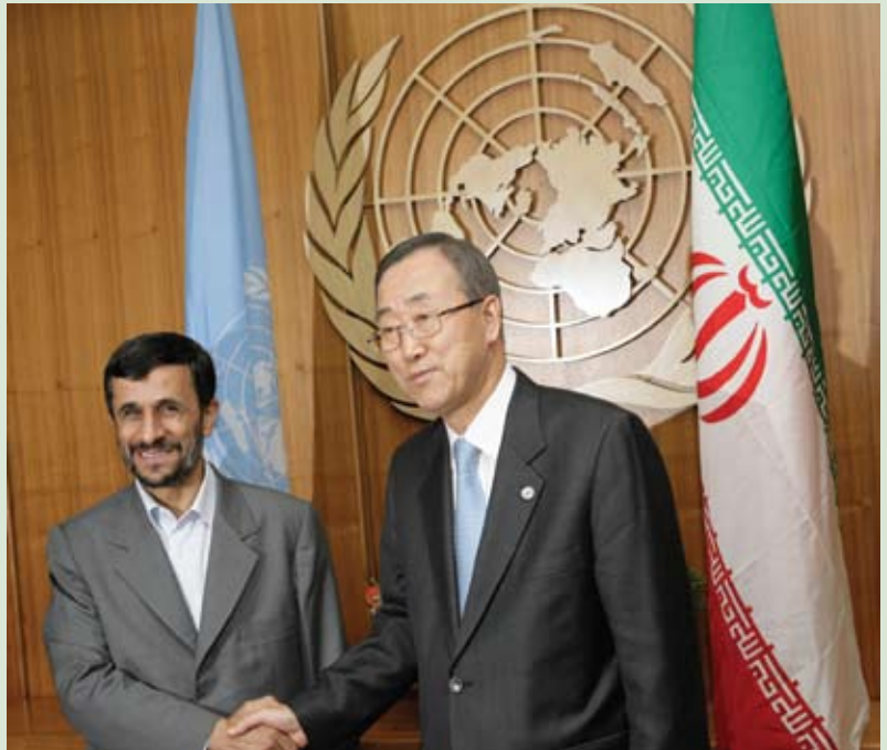
Iranian President Mahmoud Ahmadinejad (left), shakes hands with United Nations Secretary-General Ban Ki-moon at UN headquarters on Sept. 24, 2007.

Generally, a new Middle East security process could also bring about an improvement in relations among the Sunni Arab regimes, including new patterns of cooperation in Jordanian-Palestinian