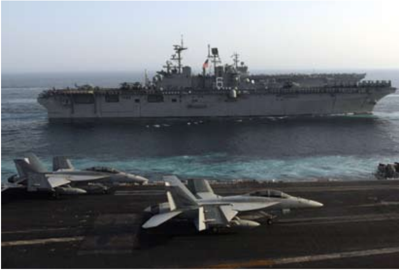
This image provided by the US Navy shows the nuclear-powered aircraft carrier USS Nimitz (background), and amphibious assault ship USS Bonhomme Richard (LHD 6) (center), transit alongside Nimitz-class aircraft carrier USS John C. Stennis (foreground), in the Gulf of Oman, May 22, 2007.

build up overtime a combined Iranian-Iraqi coalition against other Middle Eastern states and project its power against Israel from the east, using Hezbollah-like units. Iran can be expected to reinforce Hamas in Syria for operations against Jordan, as well. How these developments will actually unfold will depend on whether the Western disengagement from Iraq is precipitous or occurs only after the country is mostly stabilized.