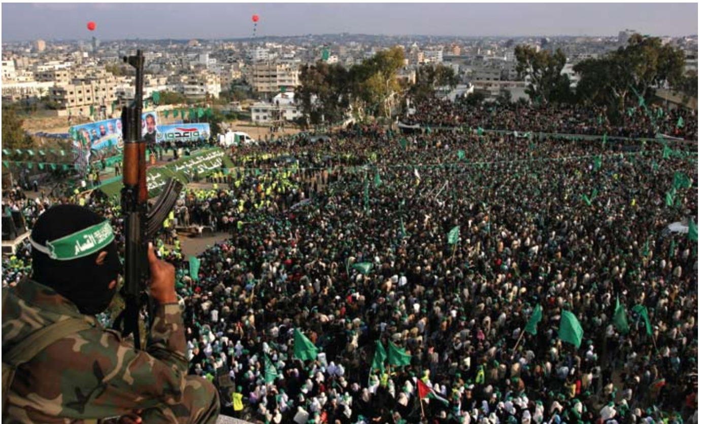
A masked Hamas militant stand guards as thousands of supporters gather as Palestinian Prime Minister Ismail Haniyeh, not seen, delivers a speech during a rally in Gaza City, Dec. 15, 2006.

peoples,” and demands of other Arab and Islamic countries that they “facilitate the passage of the jihad fighters into them and out of them – that is the very least [they can do].” At the time the covenant was compiled, Hamas apparently believed that there would be a need to import foreign mujahidin , as in Afghanistan, Bosnia, Chechnya, and now Iraq. In practice, Hamas recruited locally, and the tight control of Israel’s borders did not allow the import of foreign fighters.