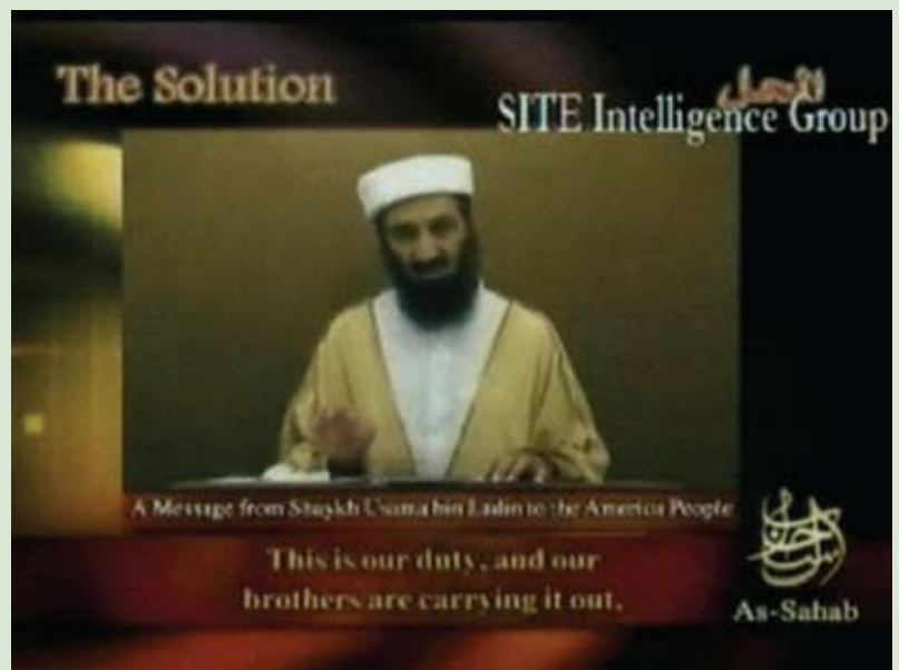
This image taken from an undated video produced by al-Qaeda’s media arm, Al-Sahab, and made available on Sept. 7, 2007 by the SITE Institute, a Washington-based group that monitors terror messages, shows Osama bin Laden speaking in the first new video of the al-Qaeda leader in three years.

Article Twenty-Eight of the covenant urges the countries surrounding Israel to “open their borders to jihad fighters from among the Arab and Islamic