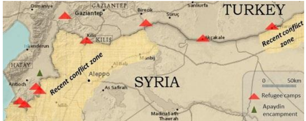
Map of Borderlands Syria–Turkey

Rebel groups' immersion in refugee populations represents a legal, humanitarian and logistical quagmire for the Office of the United Nations High Commissioner for Refugees (UNHCR), the UN agency whose primary purpose is the safeguarding of refugees and their rights in accordance with international law and humanitarian principles. The challenge is a familiar one: throughout the 1990s, rebels from Rwanda, Cambodia, East Timor, Kosovo, Sierra Leone, Afghanistan and Sudan entered refugee camps