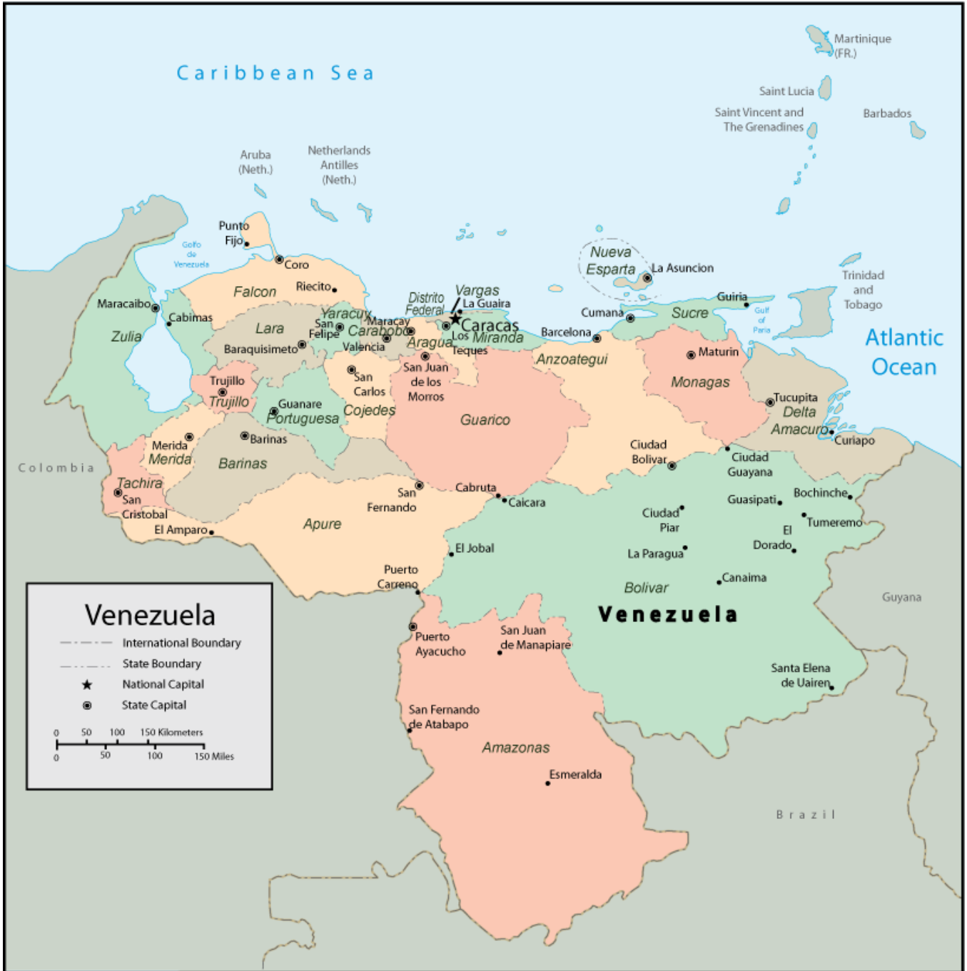
Figure I. Map of Venezuela