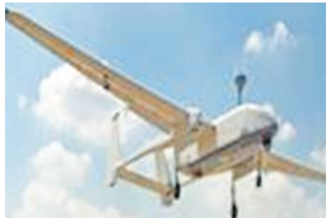
A UAV in flight