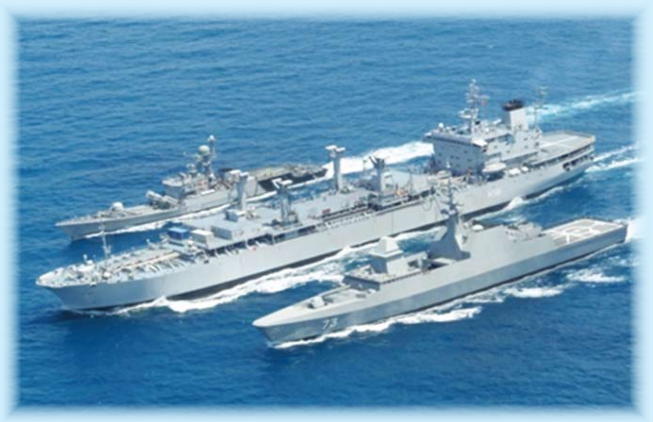
INS Jyoti , RSS Supreme and INS Kirch