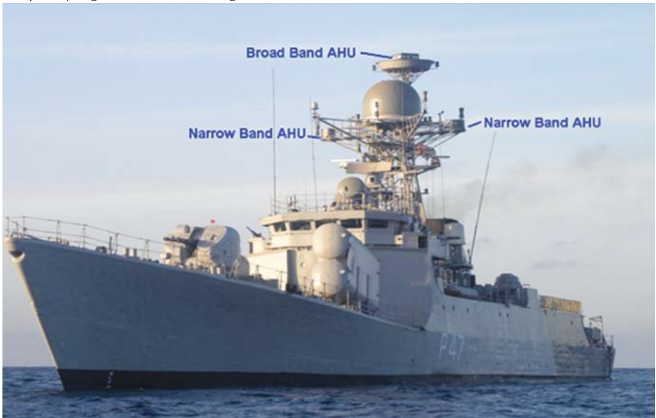
Varuna Engineering Model Onboard INS Khanjar

Convoy Protection Jammer System 'Stride': Vehicle Mounted Muting System designed to prevent detonation of Radio Controlled Improvised Explosive Devices (RCIEDs) employed by Anti National Elements. These Systems are intended for the protection of Security Convoys of VVIPS from RCIED