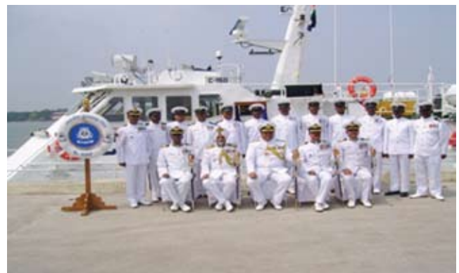
Commissioning of C-150 by DGICG on March 28, 2011

6.8 Commissioning of Interceptor Boats (IBs): Four Interceptor Boats, namely ICGS C-150, C-151, C-152 and C-153 have been commissioned into the service in the last one year. ICGS C-150 and C-151 were commissioned on March 28, 2011 and the other two IBs on June 18 and October 22, 2011 respectively.