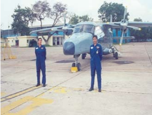
IAF Women Pilots always ready to face the Challenges of Flying

17.12 Technical Branches: Women are employed in all facets of technical competencies in the IAF that include aircraft systems, ground weapons and other aerial and ground based systems. Placement profiles are similar to their male.