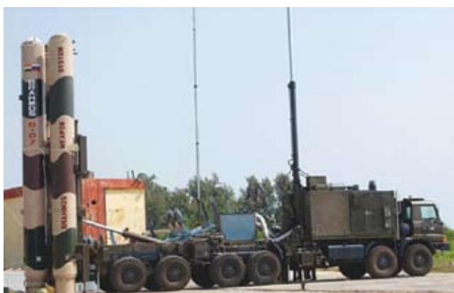
BEML TATRA BAHMOS 12 X 12

Industries located at Tarikere, Karnataka, which produces steel castings. The Company has a nation-wide net work of sales & service offices and spare parts depots within close proximity of major customers.