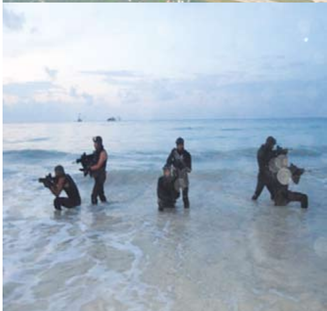
Tri-Services Joint Special Forces Training Camp