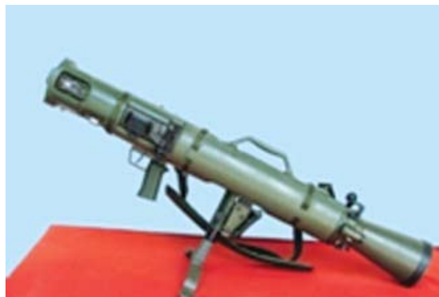
84 mm Rocket Launcher

A contract for procurement of Qty 66,000 rounds of 84 mm Rocket Launcher ammunition with M/s FFV SAAB, Sweden was signed in March 2011. Qty 20,000 rounds are likely to