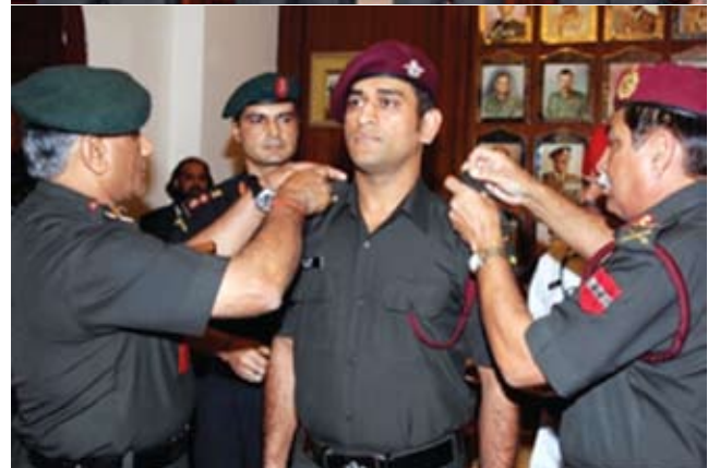
New Entrants to the Armed Forces family