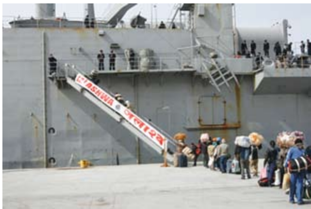
Evacuees boarding INS Jalashwa

4.7 Operation BLOSSOM: IN ships Mysore, Jalashwa and Aditya sailed for Non Combatant Evacuation Operations (NEO) of Indian nationals from Libya on February 26, 2011. The ships were thereafter deployed off Tripoli in March, 2011 and evacuated 150 Indian nationals to Malta.