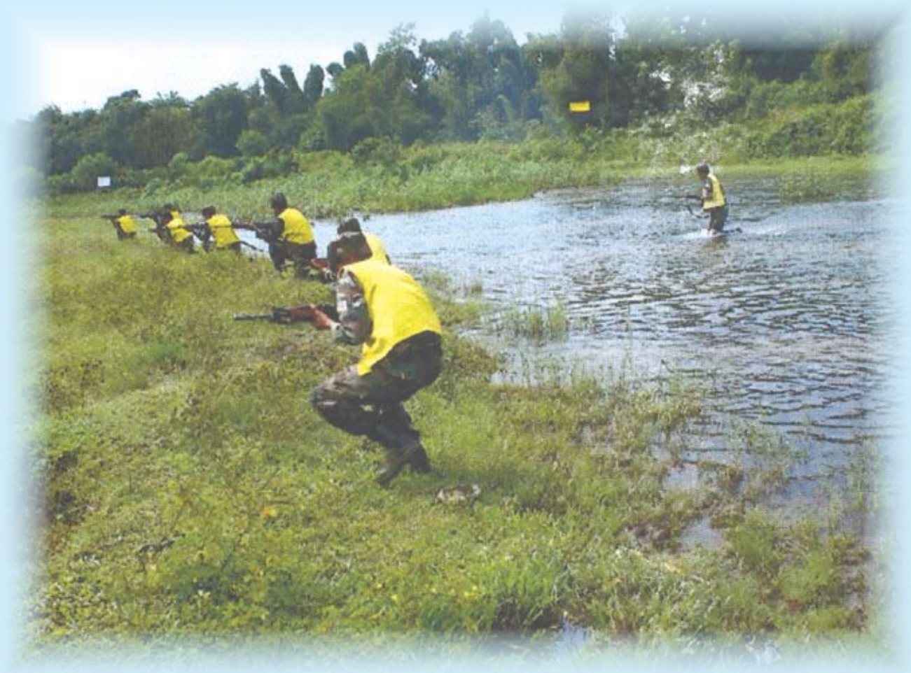
Counter Insurgency Training in progress