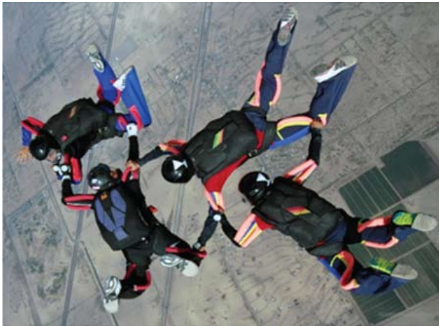
All Women IAF Skydiving Team in Action

skydivers. They have since performed at various ceremonial occasions including the 79th Air Force Day Parade at Hindon on October 8, 2011.