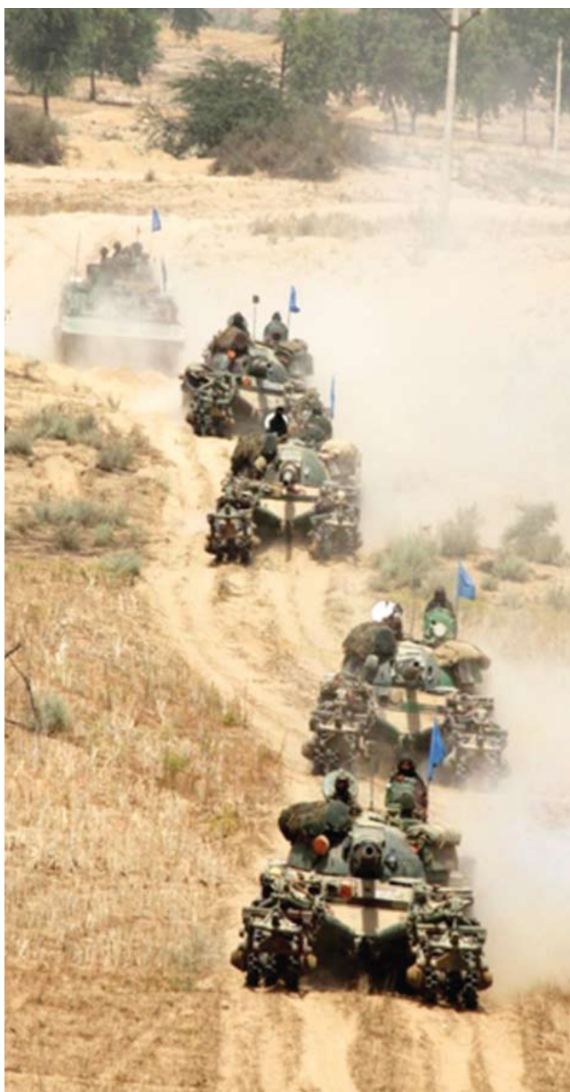
Rulers of the Desert: An armoured column advancing during the Exercise "Vijayee Bhava"

and engagement with Pakistan. However, the existence of terrorist camps across the India-Pak border and continued infiltrations across the LoC continue to pose a threat.