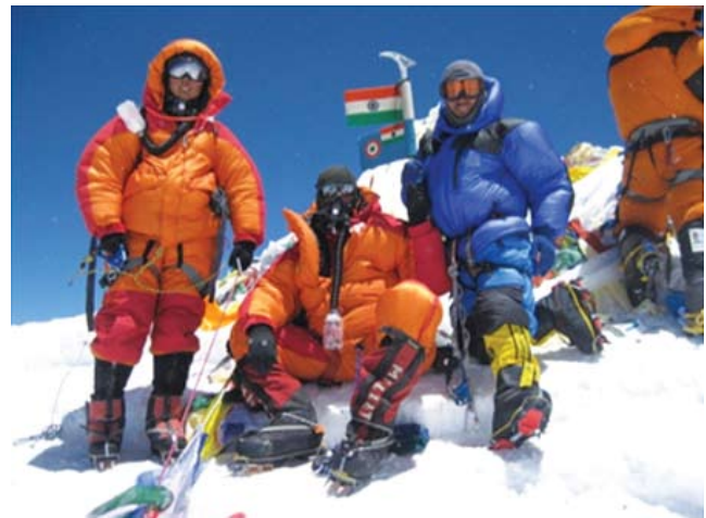
IAF Women Mountaineering Team

17.14 Everest Conquest by Women Officers: Under the aegis of the IAF Adventure Cell, an IAF Mountaineering team including six women set off to conquer the highest peak in the world, Mt Everest (8848M). Three women IAF officers summited the peak on May 25, 2011, bringing laurels to the IAF.