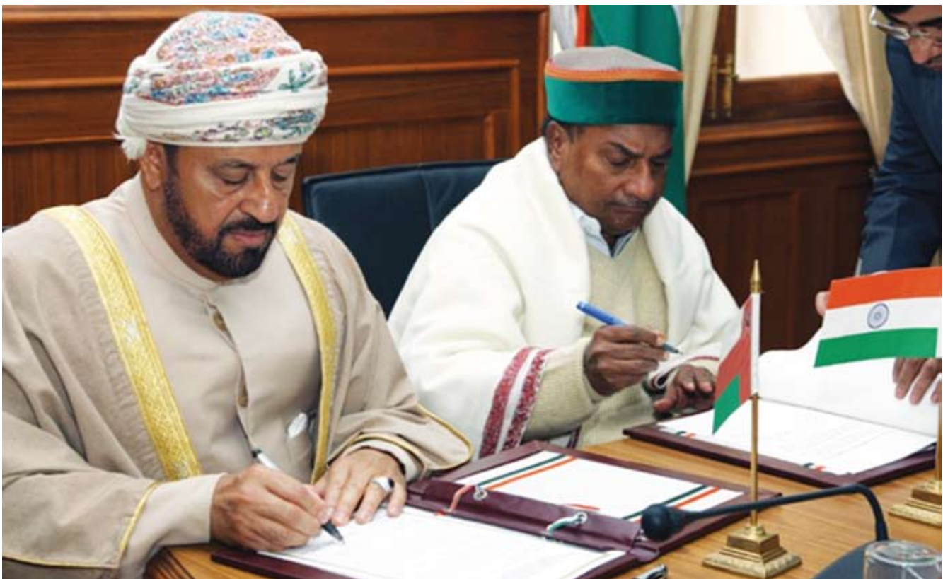
Raksha Mantri and the Minister of Defence Affairs, Sultanate of Oman Mr. Badar bin Saud bin Harib al Busaidi, signing the documents for extending the Memorandum of Understanding on Military Cooperation

14.21 India maintains substantive defence relations with Oman . The 5th Air Force Staff