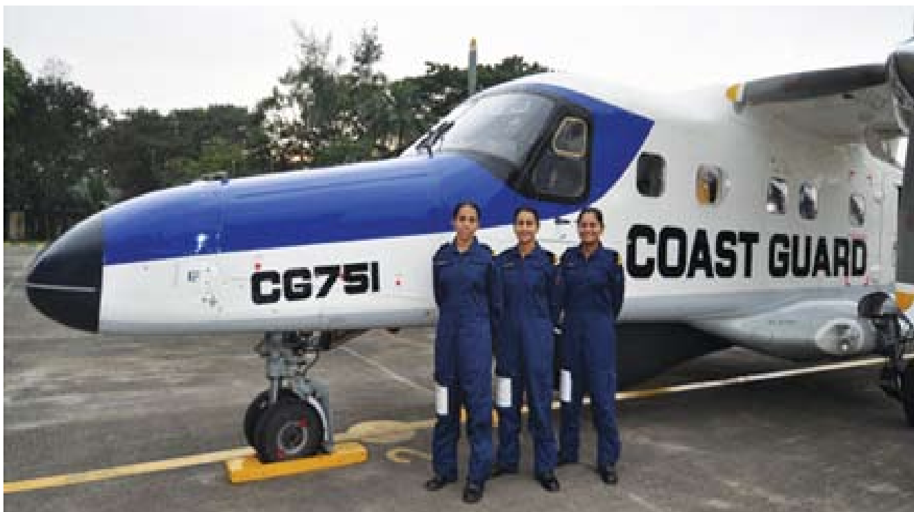
Women Coast Guard trainee pilots

17.17 Women Officers in Coast Guard: Women officers are being inducted in the Indian Coast Guard as Assistant Commandant since 1997. Women candidates can join the Indian Coast Guard in the General Duty (Permanent), General Duty (Pilot/ Navigator) and General Duty (Law) branches. Short Service appointment for women officers in General Duty and General Duty (CPL Holders) branches has also been introduced to increase the intake of women officers in the service.