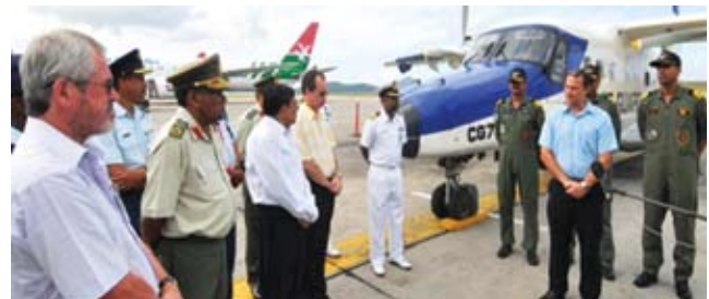
President of Seychelles visiting the Indian Dornier Flight at Seychelles

4.30 Befitting its status as the pre-eminent maritime power in the region, the IN continues to be a stabilising force in the IOR. Over the