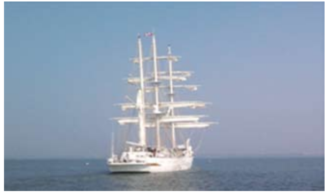
Sail Training Ship

7.60 During the year, 1 Sail Training Ship for Indian Navy and 1 GRP boat for Sardar Sarovar Narmada Nigam Limited have been delivered.