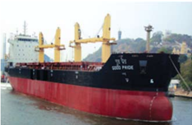
M. V. Good Trade 53,000 DWT bulker