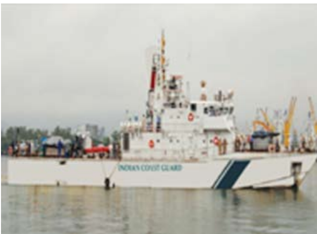
INS Rani Abbakka, Inshore Patrol Vessel

7.73 Information Technology: HSL has successfully implemented the following tasks during the year: