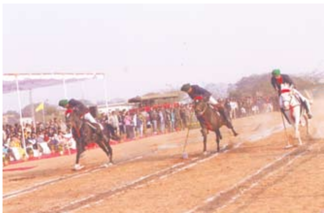
Tent Pegging display by NCC Riders during Horse Show