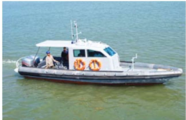
5T GRP boat

7.61 The yard is in the process of implementing a modernisation plan to meet the future challenges in terms of technology and workload. This is being carried out in four phases at an estimated outlay of Rs.800 crore. Commissioning of Phase 1 & 2 comprising of setting up of 6000T shiplift system along with building berths & jetty and laying of foundation for phase 3 & 4 was done by Raksha Mantri on May 21, 2011. Facilities planned under phase 3 & 4 include new hull fabrication and outfitting shops for modular construction and GRP complex for building of MCMVs for Indian Navy.