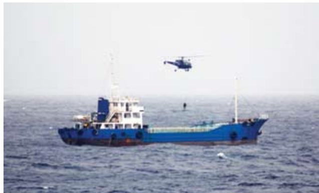
Anti Piracy Operations in the Gulf of Aden

flagged merchant ships transiting through the area. As of date, over 1800 merchant ships of varying nationalities have been escorted safely by the Indian warships. A total of 120 pirates have been apprehended and 73 fishermen and crew rescued in four operations by the IN against pirate mother ships in the East Arabian Sea in 2011.