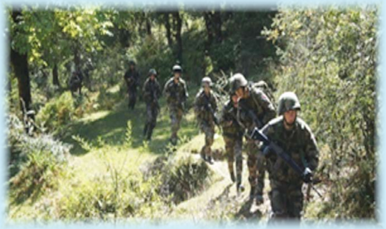
The Foot Soldier Marches on