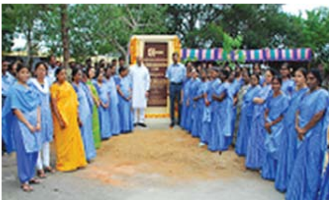
Raksha Rajya Mantri laid foundation stone of a dedicated plant for production of high quality fasteners made of Titanium and Titanium alloys and special Steels at MIDHANI

7.127 Crystallizing the proposal to acquire State-of-Art equipment i.e., 4 Hi wide plate rolling Mill and 20 T Electric Arc Furnace and tying up, financial support to the tune of Rs. 507 crore from M/s Advance Systems Laboratory (DRDO) & Ordnance Factory Board (OFB).