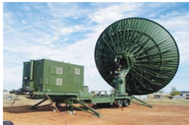
Communicating through skies

3.31 Signals: The Corps of Signals has undertaken a number of major steps in consolidating the various data and communication networks of the Indian Army. Establishment of Defence Communication Network, a prestigious Tri Service project schemes to improve EW capabilities and Mobile Communications for some of the frontline Corps employed in Counter Insurgency Operations are currently underway.