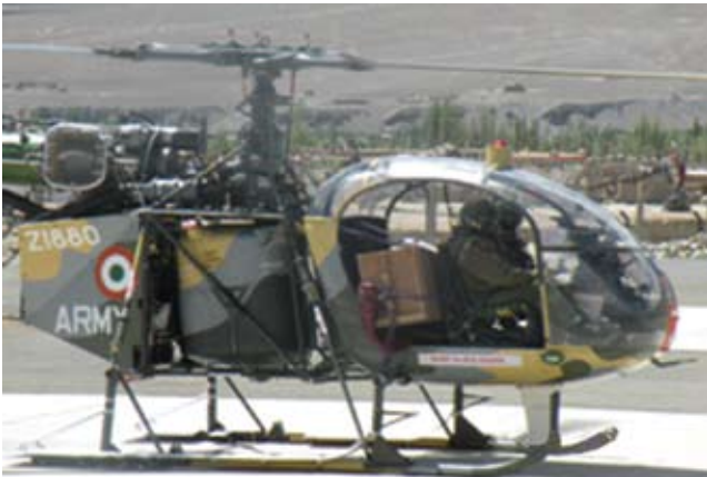
Ready to Fly

Light Helicopter (ALH). In order to enhance its operational efficiency, the Army Aviation is also procuring Cheetal Helicopters.