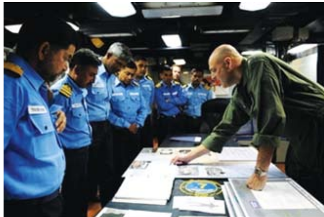
IN officers on board USS Ronald Reagan

4.14 MALABAR-11: The IN-USN bilateral exercise MALABAR-11 was held off Okinawa in April, 2011. The US Navy units USS Sterett, Stethem and Preble, Ronald Reagan, Chancellorsville, Santa Fe, Blue Ridge, Carl Brashear and IN ships Delhi, Ranvir, Ranvijay and Jyoti participated in this exercise.