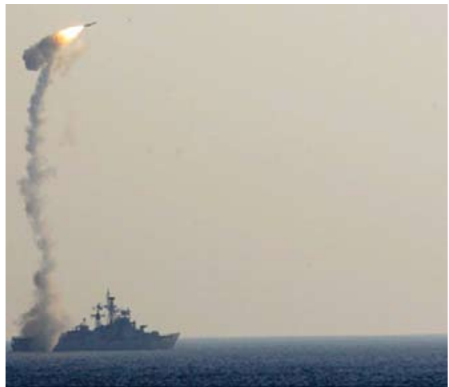
Launch of BrahMos from INS Ranvir during the Exercise TROPEX

1.8 As rising nations and non-State actors become more powerful, emerging risks require greater attention. The security environment has become more complex, with asymmetric threats from terrorism, piracy etc. Technology advances in telecommunications and other areas have provided potent force multipliers to boost the capabilities and impact of terrorist activities. Despite international efforts to deal with terrorism, the threat from terrorism remains potent. There is continuing concern over the