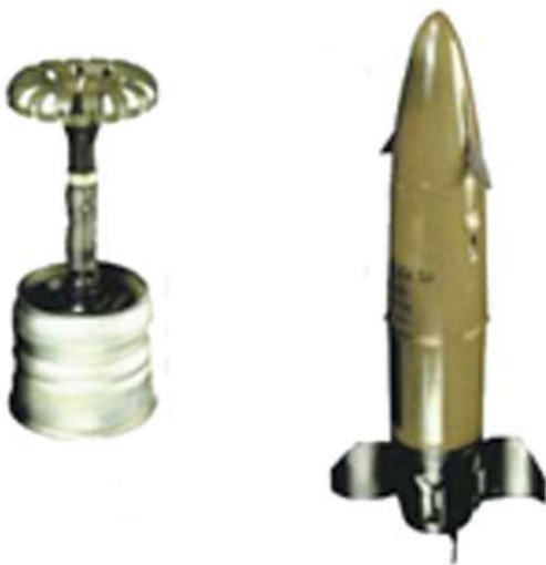
INVAR (3 UBK-20) ATGM