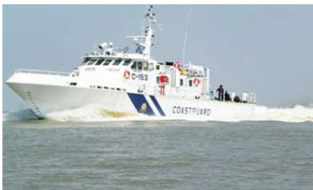
C-153 commissioned on October 22, 2011 proceeding on a mission.