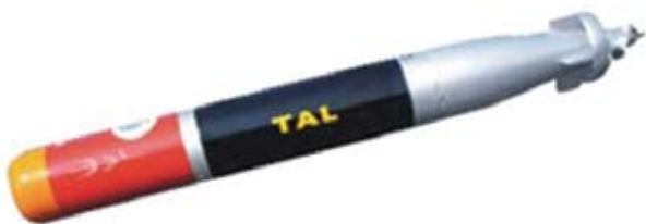
ADVANCED LIGHT WEIGHT TORPEDO (TAL)