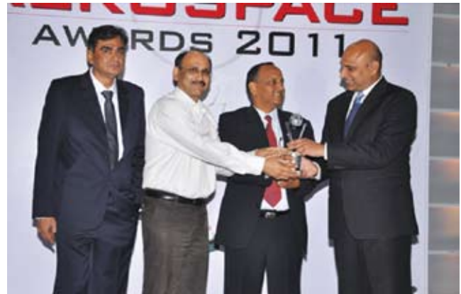
Raksha Rajya Mantri presenting the award to BEML Executives