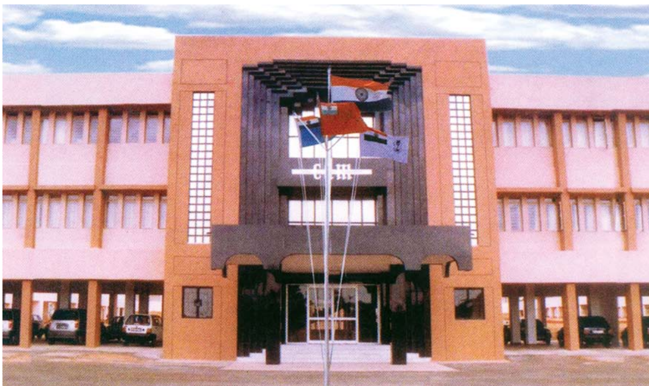
College of Defence Management, Secunderabad

for officers of Neighbouring Countries both conducted for a period of two weeks. In addition, courses for a duration of one week in the areas of Project Management, Organisation Behaviour, Financial Management and Operations Research/ Systems Analysis.