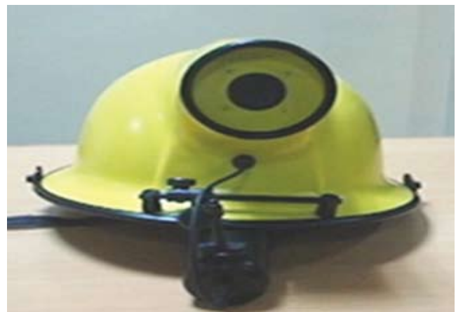
Helmet Mounted Thermal Imaging Camera

Combat Identification of Friend or Foe (CIFF): System has been realised for armored vehicle for ground-to-ground close combat operations. It reduces the fratricides and enhances the target service rate. Three engineered prototypes systems have been realised and field evaluation are going on by strapping on T-72 tanks. It has