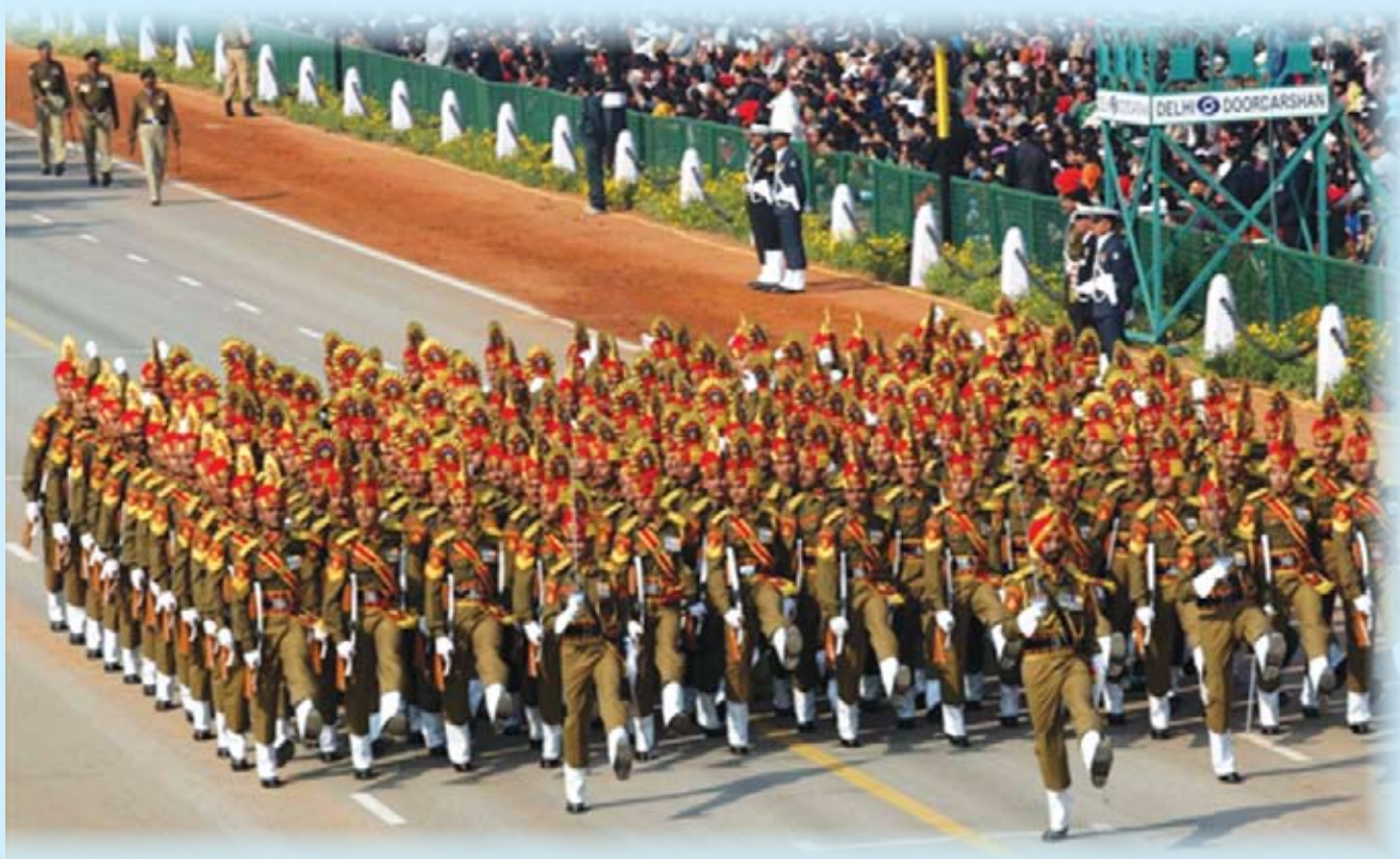
Republic Day Parade-2012