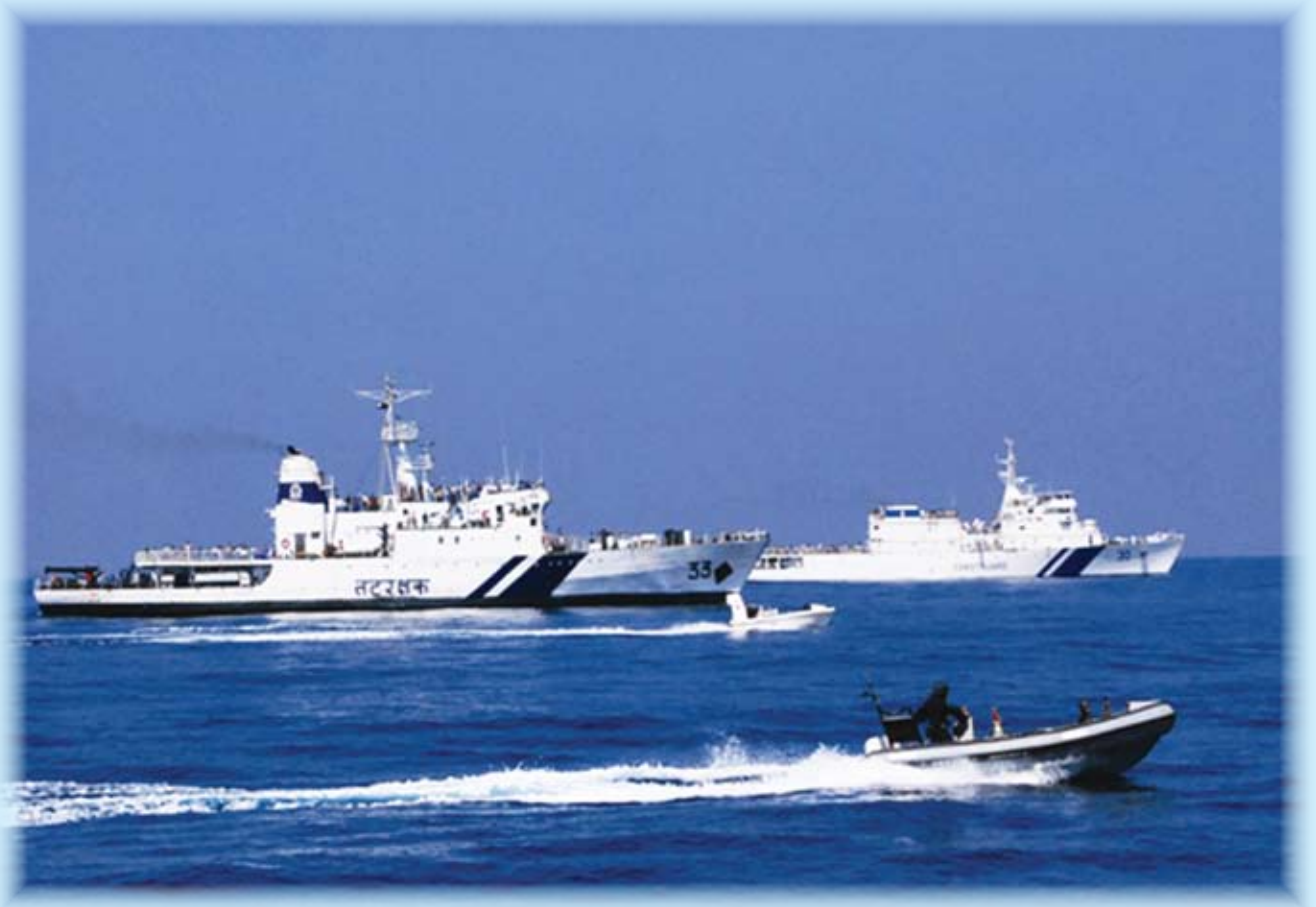
A Coast Guard Exercise in Progress