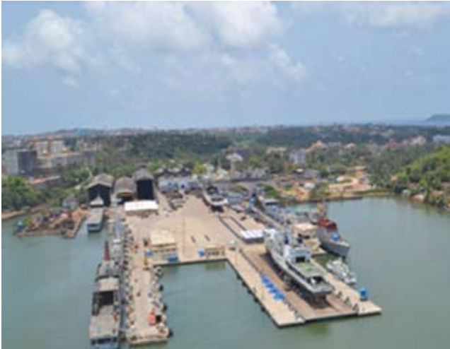
Birds eye view of facilities under Modernisation phase 1 & 2

shipbuilding projects are based on in-house design, an outcome of R&D over 30 years. It is noteworthy that GSL's indigenously developed designs of Patrol Vessels have saved the country considerable amount of foreign exchange by avoiding import of ships/ designs. This has also given an impetus to the country's efforts towards self reliance in ship design.