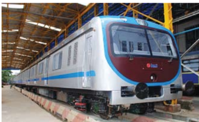
STAINLESS STEEL EMU