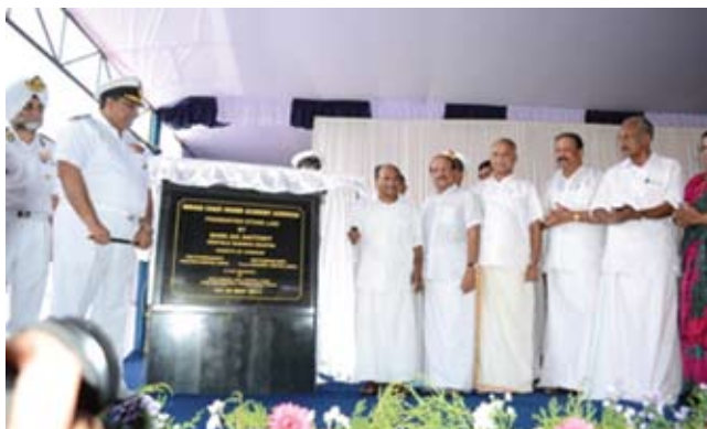
Commissioning of Indian Coast Guard Station Mundra by DGICG on May 19, 2011

Two Indian Coast Guard Stations at Ratnagiri (Maharashtra) and Mundra (Gujarat) were commissioned on March 26 and May 19, 2011 respectively.