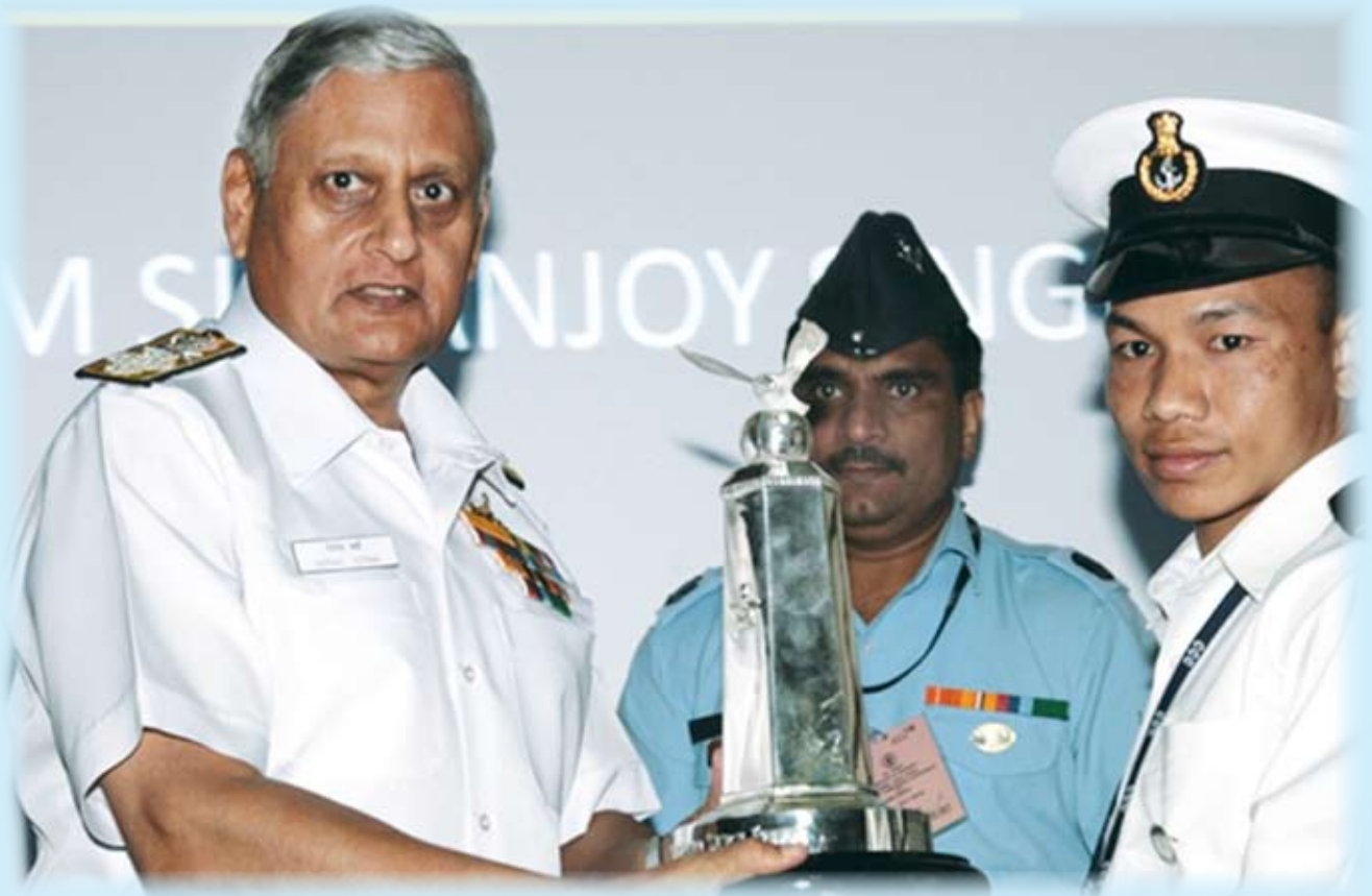
Defence Services Staff College, Wellington