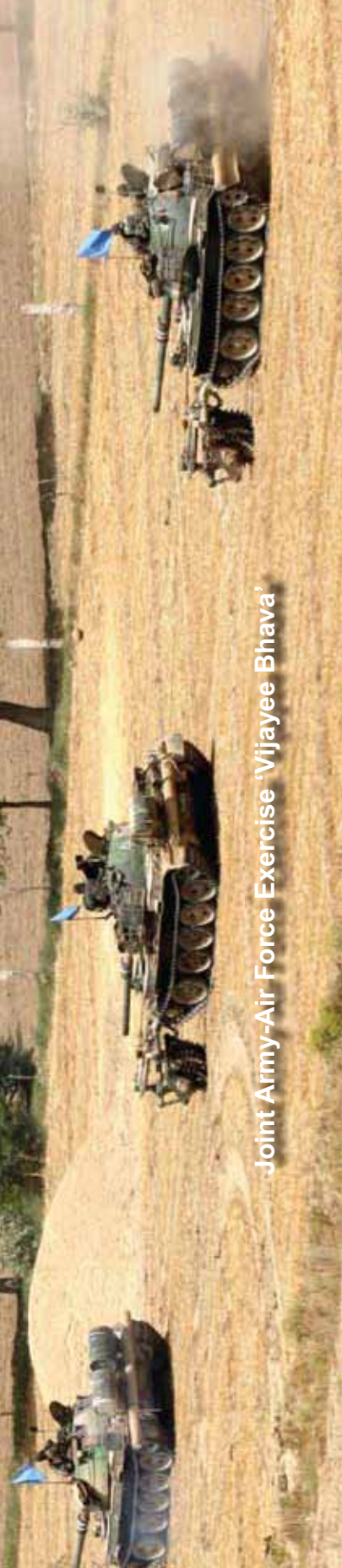
Joint Army-Air Force Exercise 'Vijayee Bhava'