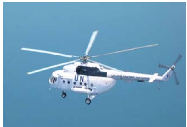
Helicopter deployed for UN peace keeping operations in Democratic Republic of Congo

12.26 UN Mission: The Indian Aviation Contingent deployed at Bukavu (Democratic Republic of Congo) comprising six Mi-17 and four Mi-35 helicopters, along with 303 personnel, were repatriated in two phases that ended in September, 2011. The helicopter fleet of Indian Air Force has flown a total of 235 sorties entailing a flying effort of 280 hrs during the period April to September, 2011 while deployed at these missions.