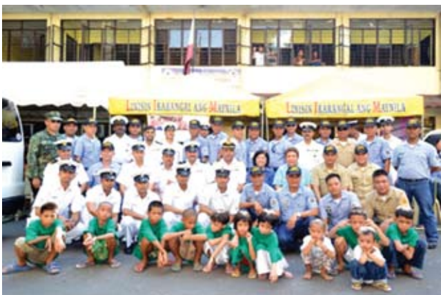
Lending a helping hand to an orphanage at Manila, Phillipines

4.6 Overseas Deployments: Overseas Deployments (OSD) are undertaken by IN ships for flag showing, fostering better relations with friendly countries and enhancing foreign cooperation. Important overseas deployments in 2011 included the following: