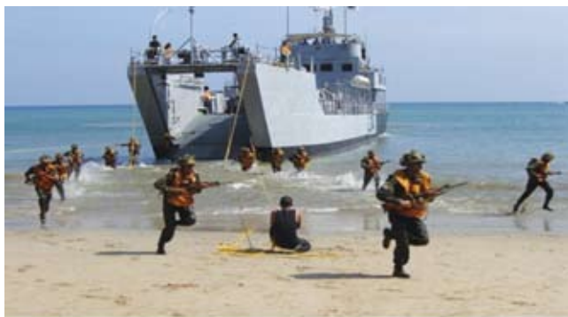
Training for Amphibious Ops

4.12 AMPHEX – 11: INS Jalashwa, along with other amphibious units of IN and Indian Army, participated in AMPHEX-11 in January-February, 2011. The exercise validated various facets of interoperability and concepts in the field of amphibious warfare.