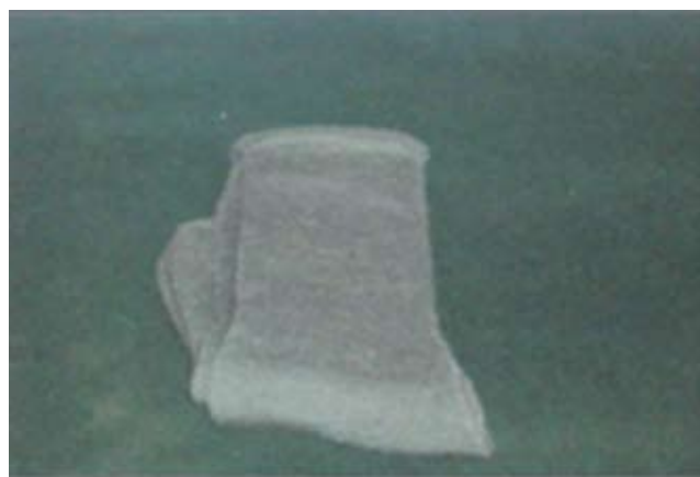
Better socks for glacier

A contract for procurement of Qty 3,82,914 pairs of socks woolen was signed with M/s Franklin, UK in September 2010 and delivery completed in a record time frame of seven months. Another contract for the same quantity has been signed under the option clause in May 2011 and delivery is likely to be completed by December 2011.