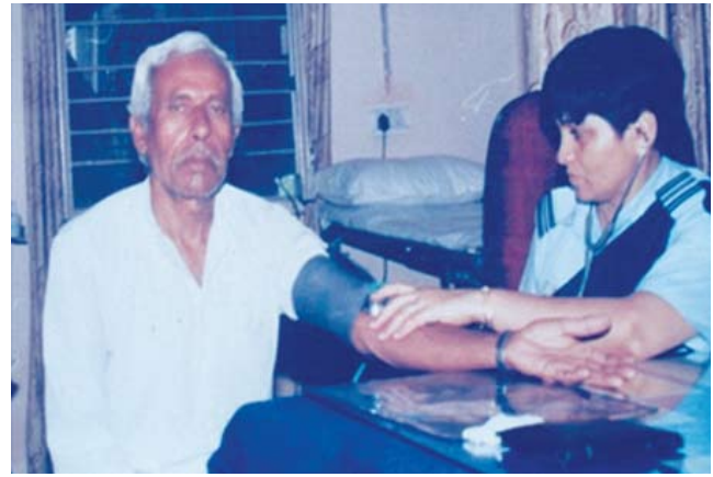
A Doctor on Duty

17.13 Non Technical Branches: Women are employed in all non-technical branches like Administration, Air Traffic Control, Fighter Control, Logistics, Accounts, Education, Meteorology, Medical and Dental.