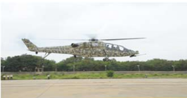
LCH- First Flight of second Technology Demonstrator TD-2

7.29 Light Combat Helicopter (LCH), a dedicated Helicopter, designed and developed by HAL made its Maiden flight in March, 2010. This is the first craft, in the attack helicopter category, to be designed and developed in India indigenously. LCH will be suitable for