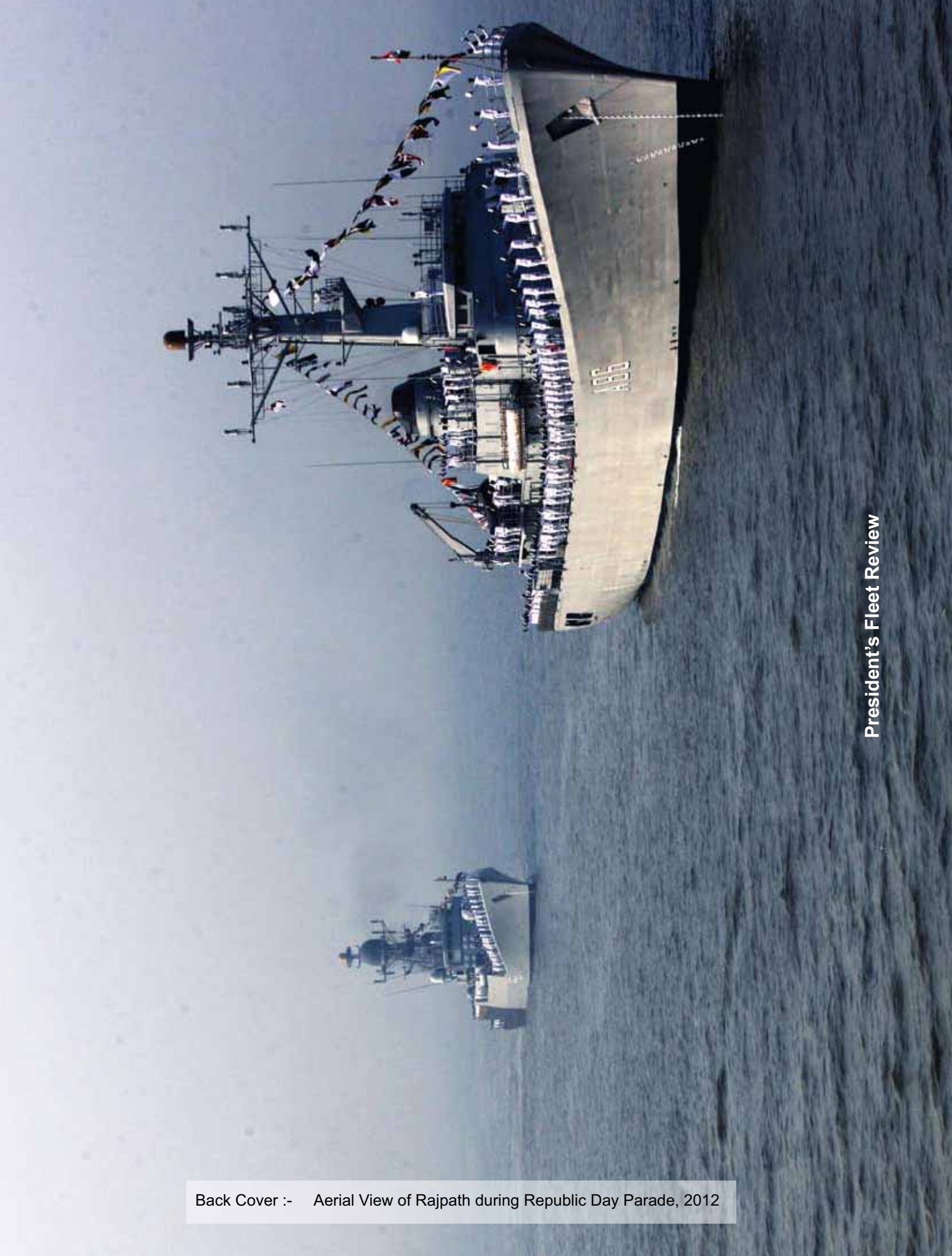
Back Cover :- Aerial View of Rajpath during Republic Day Parade, 2012