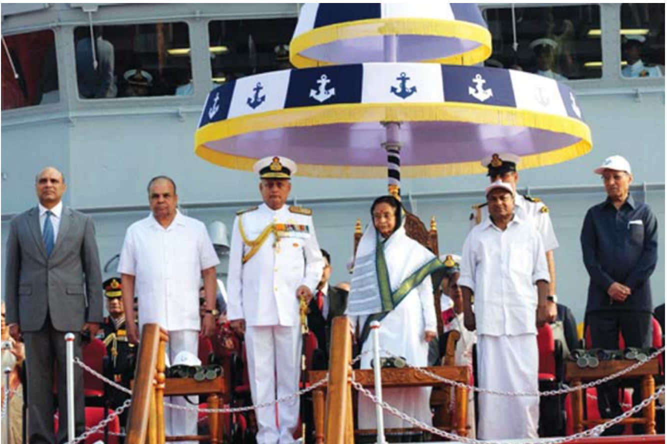
Hon'ble President reviewing the Naval Fleet

4.27 The President's Fleet Review (PFR) is a symbolic display of the nation's maritime might. Participating units, which include warships, submarines, auxiliary vessels, Coast Guard ships and merchantmen, are anchored in formation in precise columns. The President