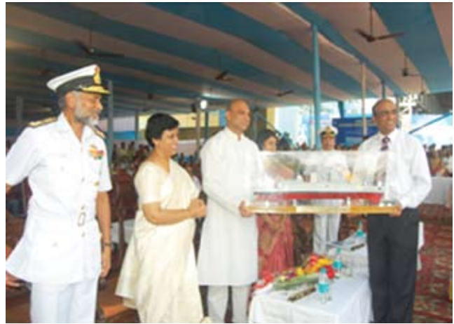
Launching of 2nd ASW Corvette