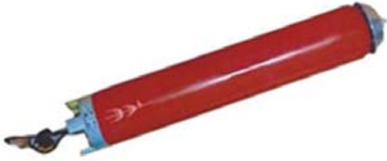
SUBMARINE FIRED DECOY (SFD)