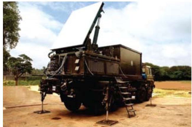
Weapon Locating Radar