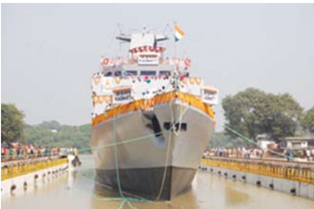
GRSE Yd No. 3018 on October 25, 2011