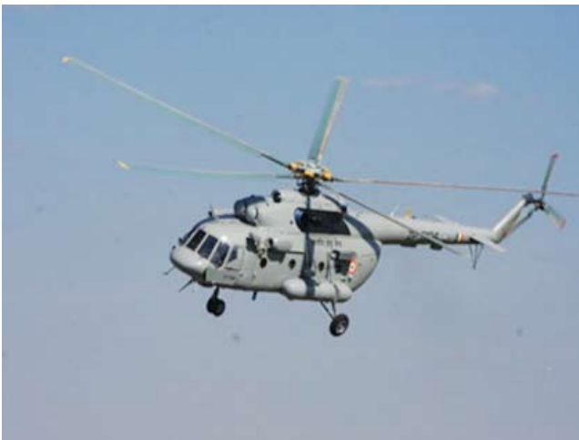
Mi-17 V5 Class, Medium lift Helicopter under Induction by IAF

5.5 Medium Lift Helicopters: New helicopter units are being raised with the induction of Mi-17 V5, medium lift helicopters, equipped with state of art avionics along with glass cockpit instrumentation. The aircraft are Night Vision Goggles (NVG) compatible and appropriately protected to facilitate night operations in a hostile environment. The helicopters have multirole capabilities and can be used for Air maintenance, Army support operations in the Tactical Battle Area (TBA)