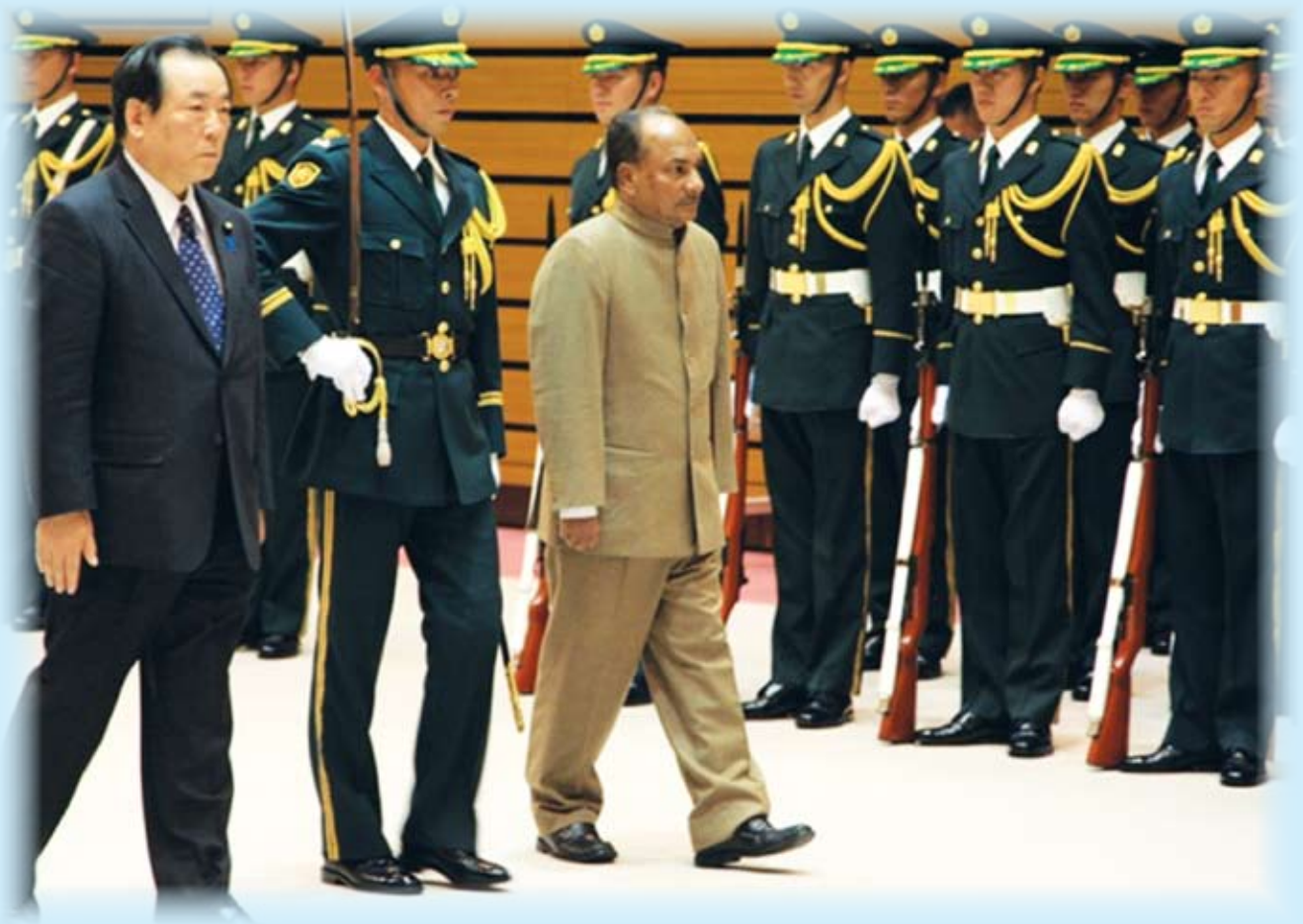
Raksha Mantri inspecting the Guard of Honour, on his arrival at the Japanese Ministry of Defence in Tokyo in November, 2011