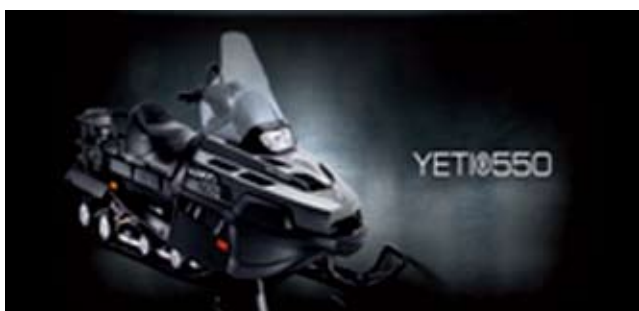
A snow mobile

A contract for procurement of Qty 20 Snow Mobiles was signed with M/s BRP, Finland in December 2010. The complete stores were received, inspected by JRI and deployed in the Glacier by March 2011 in a record time frame of three months.