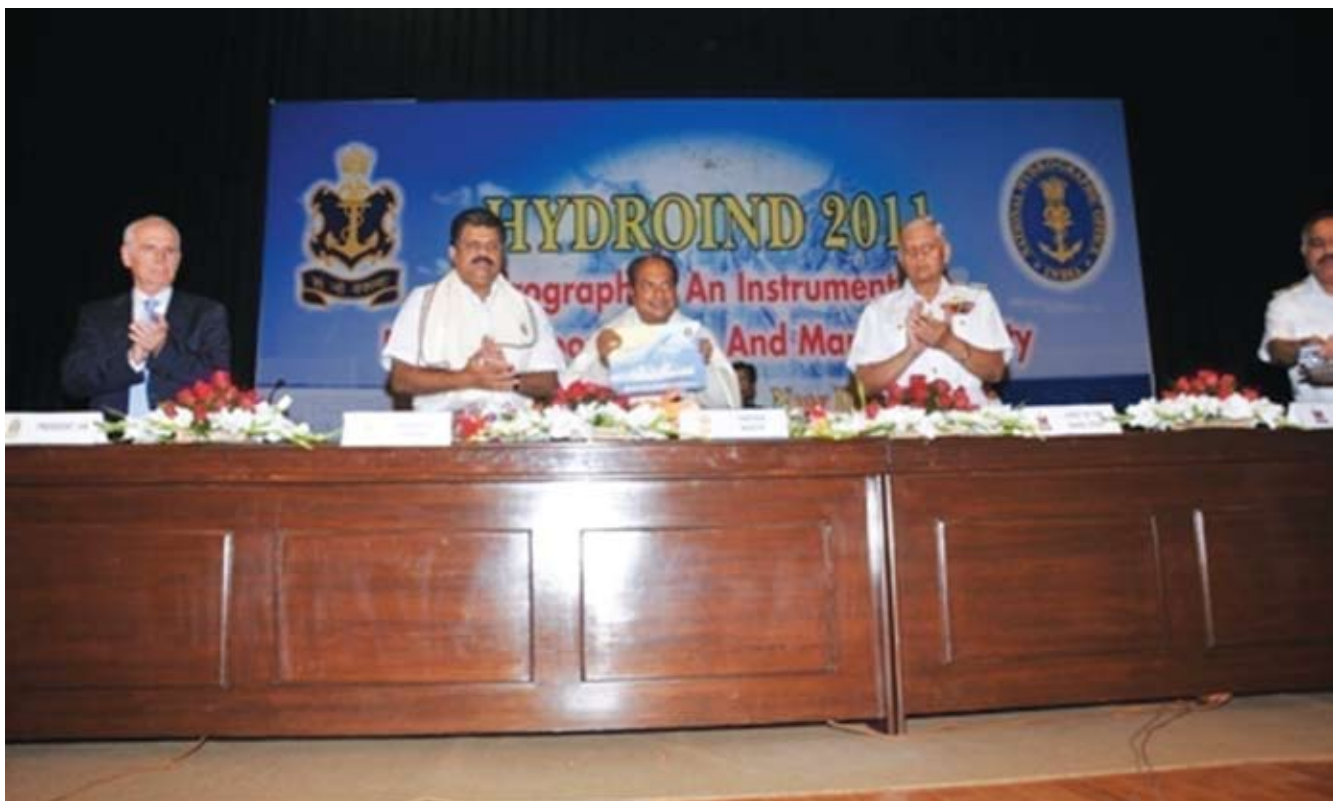
Raksha Mantri, Minister of Shipping and CNS at the Inauguration of Hydroind 2011