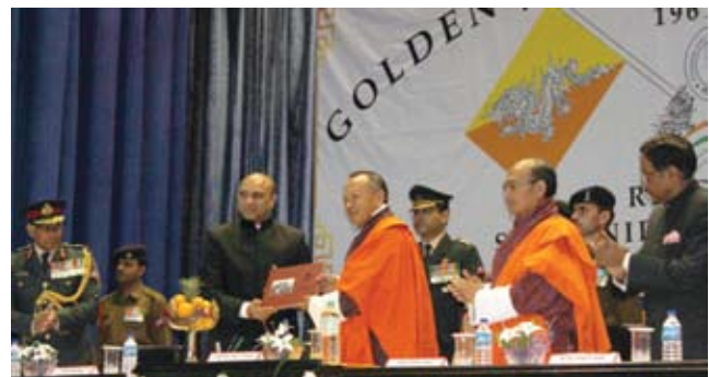
Raksha Rajya Mantri with the Prime Minister of Bhutan, Mr. Lyonchen Jigmi Y. Thinley, during DANTAK's Golden Jubilee Celebrations, in Thimpu