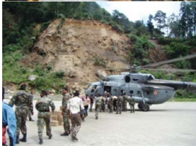
Relief Material being Loaded and delivered at Affected Areas in Sikkim

Delhi with 13 Tonnes of relief material and 220 National Disaster Response Force (NDRF) personnel. A total of 527 sorties comprising 294 hours on a variety of aircrafts and helicopters airlifted 252 tonnes of relief material and transported 1714 people in sustained operations until October 11, 2011. IAF helicopters undertook rescue missions, wherein a total of 525 persons were airlifted from inaccessible areas to safe locales. Numerous sorties were flown towards sustaining Army units at the International Border, which included supply of diesel, fuel and emergency rations.