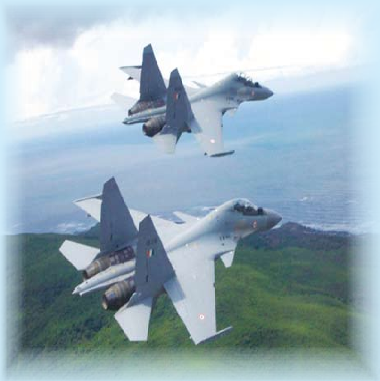
IAF SU-30s dominating the air space