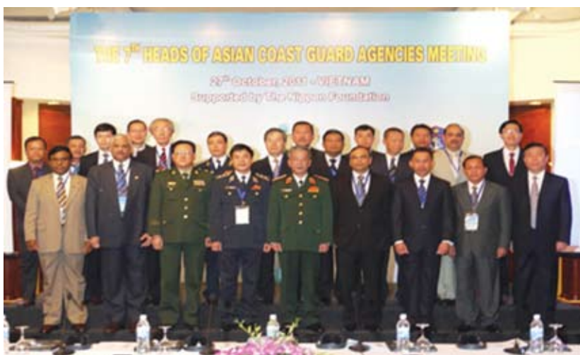
7th Heads of Asian Coast Guard Agencies Meeting (HACGAM)