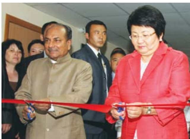
Raksha Mantri and the Kyrgyz President Ms. Roza Otunbaeva inaugurating the Kyrgyz-Indian Mountain Biomedical Research Centre, in Bishkek, Kyrgyzstan

& Development Organization (DRDO) and the National Centre for Cardiology and International Medicine (NCCIM), Bishkek. This was followed by the visit of the Kyrgyz Defence Minister Maj. Gen Abibilla Kudaiberdiev to India from September 7-10, 2011.