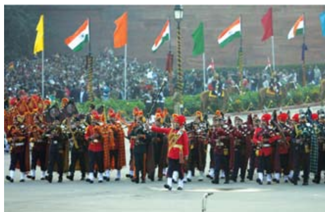
Beating Retreat Ceremony, 2012

15.31 Beating Retreat Ceremony, 2012: Beating Retreat is a centuries old military tradition practised by troops at the time of disengaging from battle at sunset. The Beating