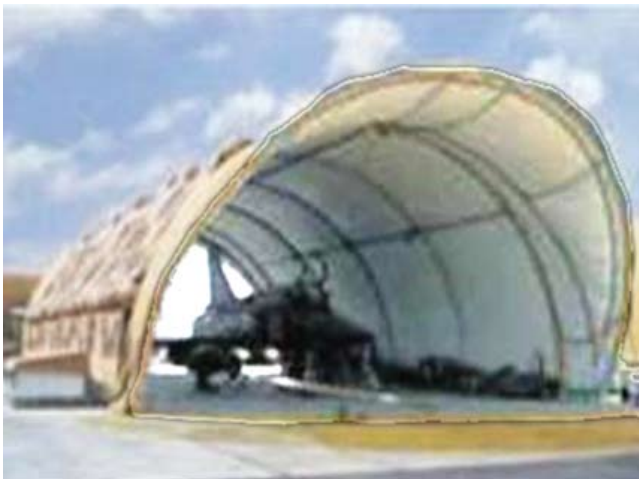
Portable all-Weather Maintenance Shelters for SU 30 MKI

To provide protection from environmental hazards and boost the morale of aircraft maintenance crew working on tarmac, 'portable all-weather maintenance shelters' have been procured for the first time by IAF for SU-30 MKI squadrons. Initially, 27 shelters have been procured for two squadrons and another 50 are in final stage of procurement.