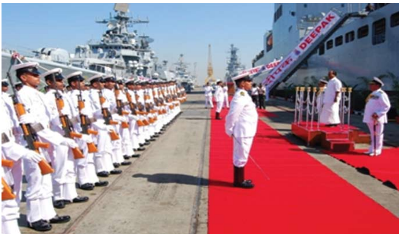
Commissioning of INS Deepak