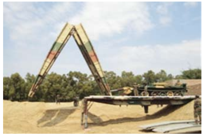
Bridging all gaps

3.30 Engineers: The operational efficiency of the Engineers to operate in an NBC environment is being enhanced with procurement of Automatic Change Detection Agents and Chemical Agent Monitors. The obstacle crossing and bridging capabilities of the Engineers are being enhanced by procurement of bridging systems like the Sarvatra Bridge Systems, 10 m Short Span Bridge and 5 m Short Span Bridge, all of which are in advanced stages.