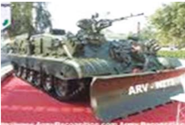
An armoured recovery vehicle