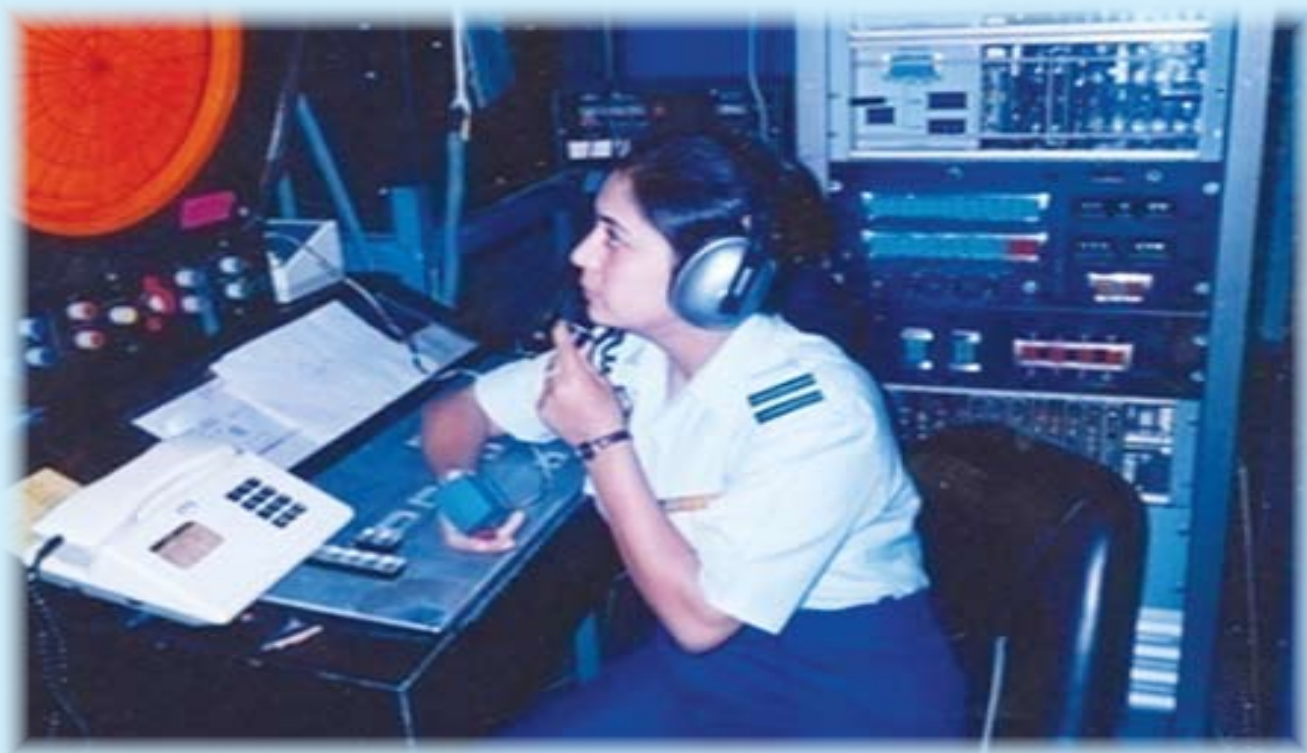
A Technical Officer on Duty in Radar Complex