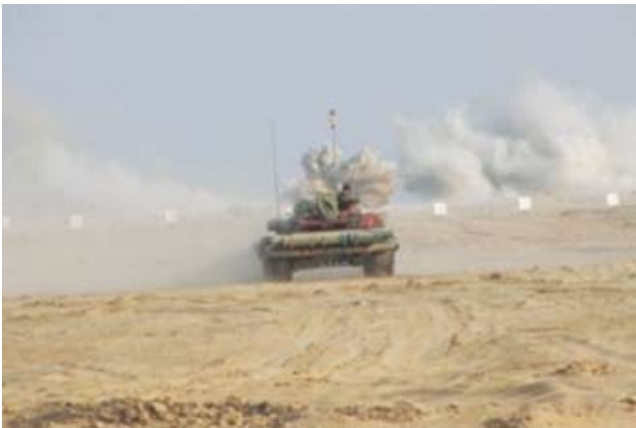
Making foot-prints in desert

3.26 Armoured Corps: The Armoured Corps is undergoing rapid modernization as per the requirements of the modern day battle field. Towards this end, removing night blindness of tanks, equipping them with modern fire control systems and providing them with better power packs is being focused upon. Efforts are also underway to provide an active defence suit to the tanks to enable detection and neutralization of incoming threats. The contract for ARV has been concluded. Schemes for procurement of Digital Control Harness and state of the art fire control systems (TIFCS) are in progress for T-72. Induction of T-90 and Arjun tanks is proceeding as per plans. Other important schemes in advanced stages of procurement are for establishment of Component Level Repair Facilities for T-90 Tanks, procurement of AMK 339 and 3UBK 20 Invar Missiles.