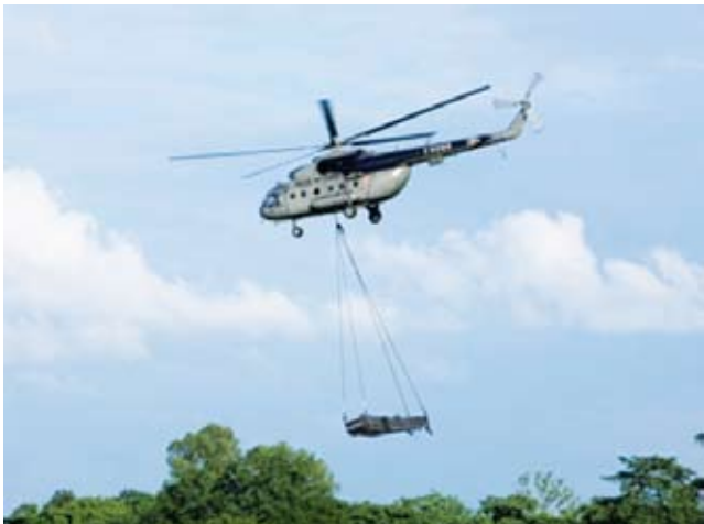
Transportation of Supplies to Troops by Helicopter of IAF

12.17 A total of 15,930 tonnes of logistics support load for the Northern sector and 2995 tonnes for the North Eastern sector have been airlifted since April 11, 2011. Routine flights are operated from Kargil to Jammu & Srinagar during the winter months.