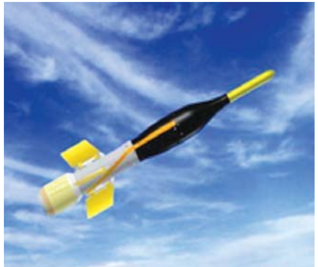
MILAN -2T ATGM