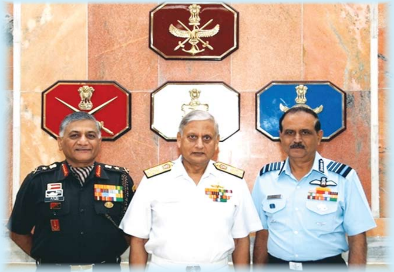
Chiefs of Staff Committee