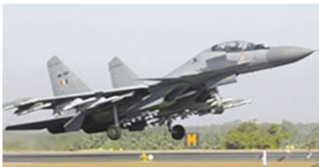
First SU-30 MKI aircraft manufactured from raw material

fuselage. Production of aircraft from raw material stage has commenced from the year 2010-11.