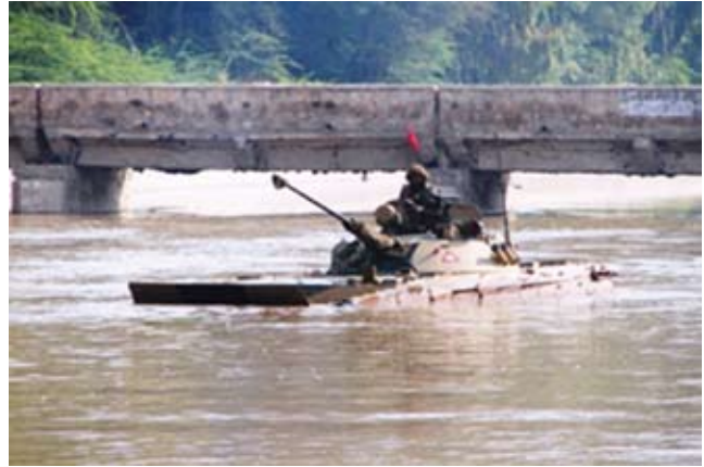
Wading through obstacles

involves equipping the BMPs with twin missile launchers, modern fire control system and other offensive weapon systems. Procurement of a modern, state of the art Anti Tank Guided Missile is also under process. Uprating of BMP-2 Engine and Integrating the TI Sight with the gun are other weapon procurements being pursued.