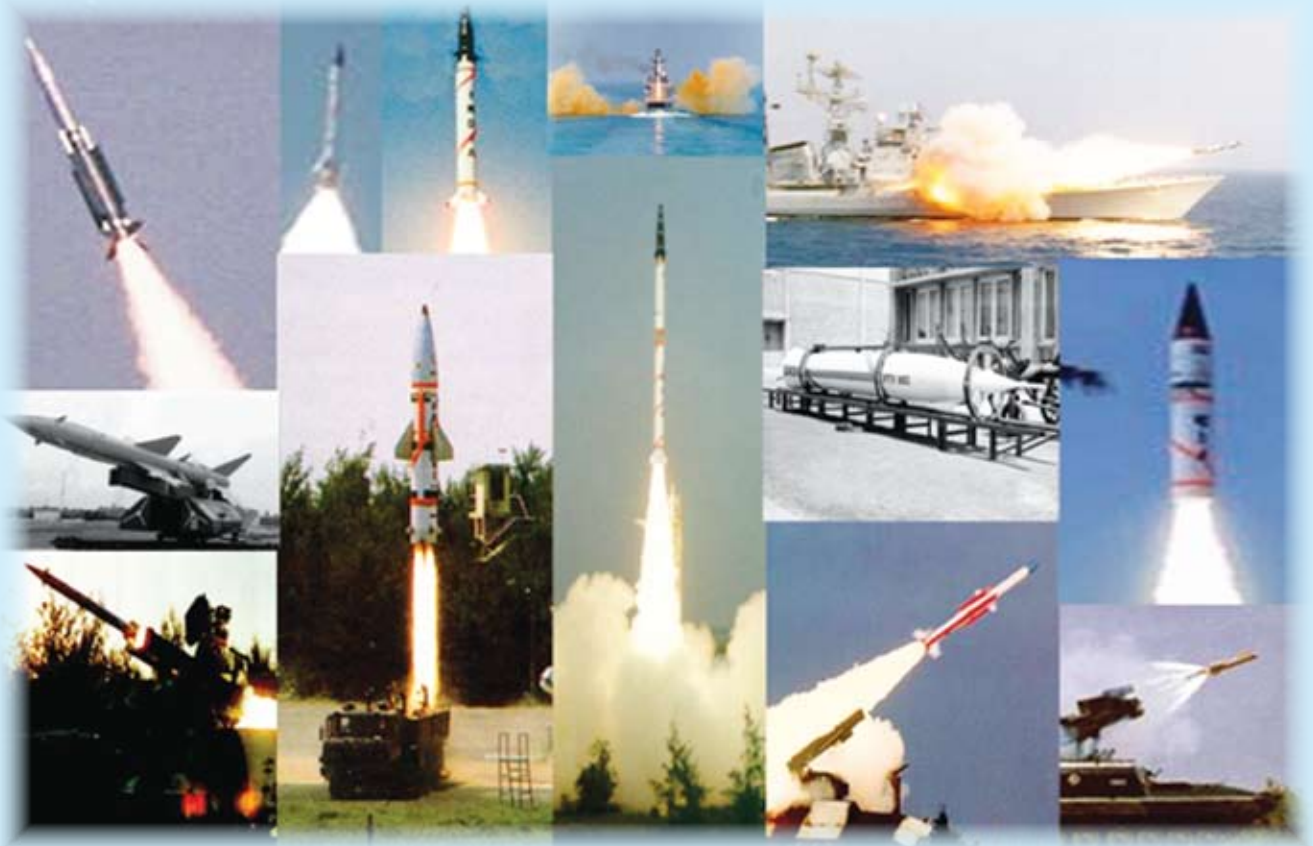
Missiles Developed by DRDO