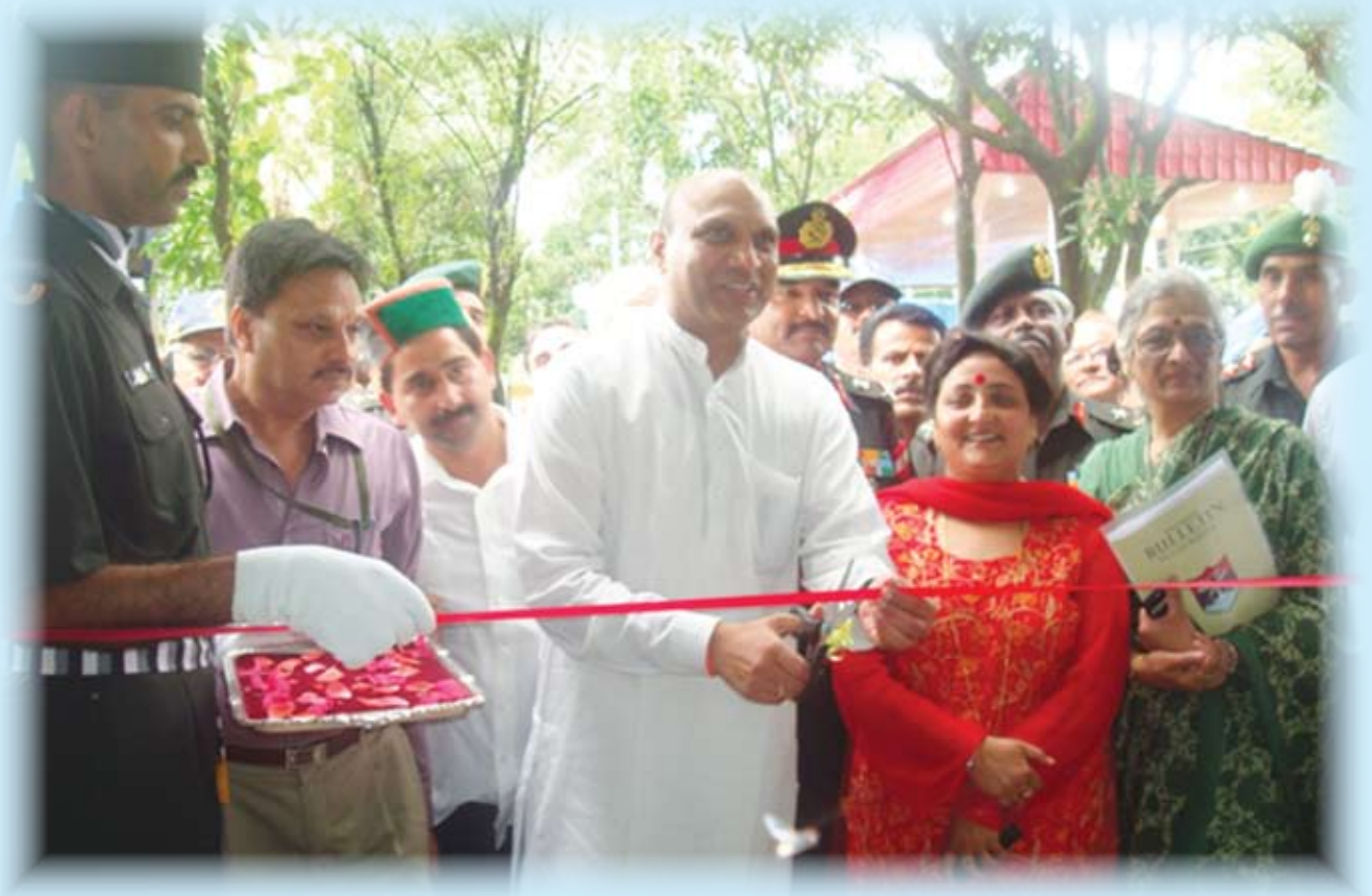
Inauguration of ECHS Polyclinic, Shahpur by Raksha Rajya Mantri