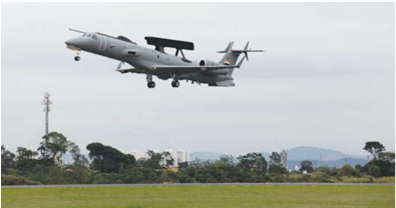
Airborne Early Warning and Control (AEW & C) System

indigenously developed Indian Airborne Early Warning and Control System took to the skies on December 6, 2011, as part of its first flight in Embraer facilities at Sao Jose dos Campos in Brazil with about 1000 Mission System Components provided by DRDO. These include the critical item, Active Electronic Scanning Antenna (AESA) Radar Antenna developed by DRDO and certified from ANAC, International FAR Certification Agency. The flight is a major milestone towards realizing the dream of indigenous AEW&C System, which