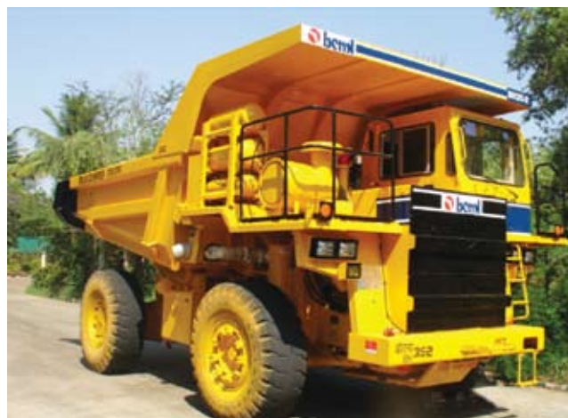
BEML DUMPER – BH 35-2

7.88 BEML, established in 1964, has its Corporate HQ and Central Marketing Division at Bangalore and 4 manufacturing complexes with 9 production units located in Bangalore, Mysore, Kolar Gold Fields and Palakkad. The Company also owns a subsidiary – Vignyan