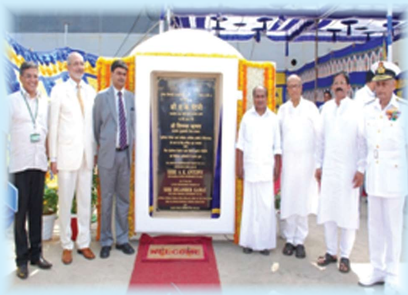
Raksha Mantri laying foundation stone for phases 3 & 4 of Modernisation project of Goa Shipyard Limited