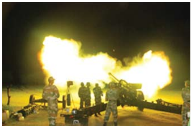
Artillery breathing fire

3.28 Artillery: The focus for procurement of Artillery equipment has primarily been on enhancing surveillance and firepower capabilities. To enhance the surveillance capabilities, in addition to procurement of the Battlefield Surveillance System and Mobile Telescopic Mast for LORROS in the last year, procurement of Heron UAV and WLR for