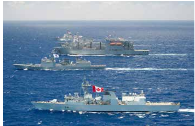
Frigate HMCS Ottawa (FFH 341) at RIMPAC 2012.

advance of China's participation in the 2014 Rim of the Pacific (RIMPAC) Exercise. The ideal geographic focus of this engagement would be the western Pacific Ocean, but a more economical alternative is the Indian Ocean where many of these potential partners are engaged in anti-piracy missions.