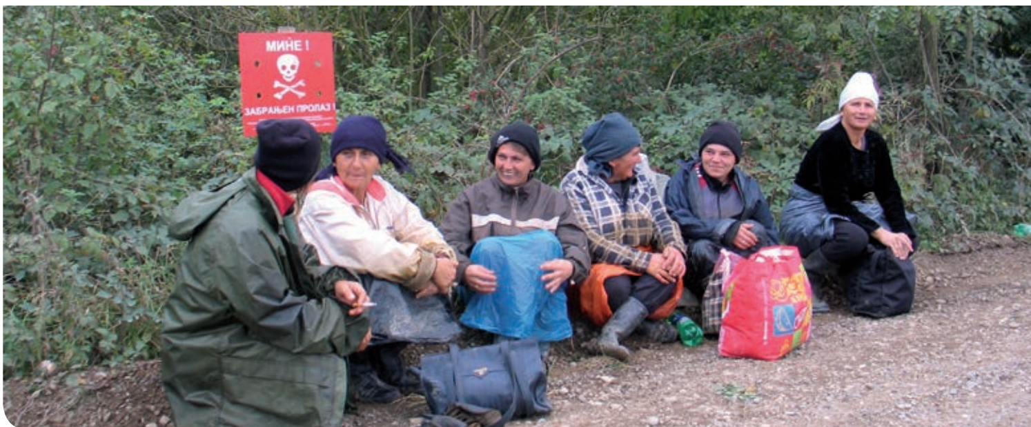
Women taking a break before work in the tobacco field in BiH

Gender is not considered during handover procedures in BiH. There are few opportunities for female representation (as most of the operational staff within BHMAC, mine/ERW operators and municipal mine action coordinators/civil protection officers in BiH are men). No efforts are made to involve female representatives of the affected communities in the handover process, and no specific