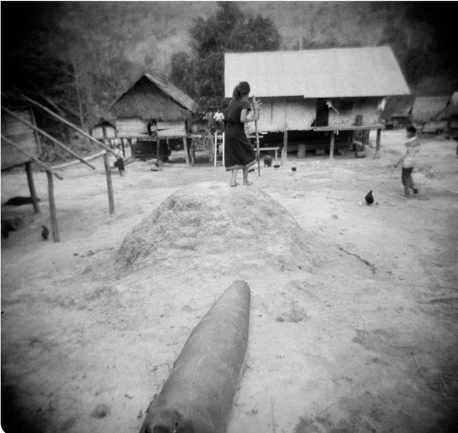
Cluster bomb casing in a village in Sepon region, Laos

When demining is conducted by an international NGO, the NGO may go beyond the national SOP and organise a more formal handover ceremony.