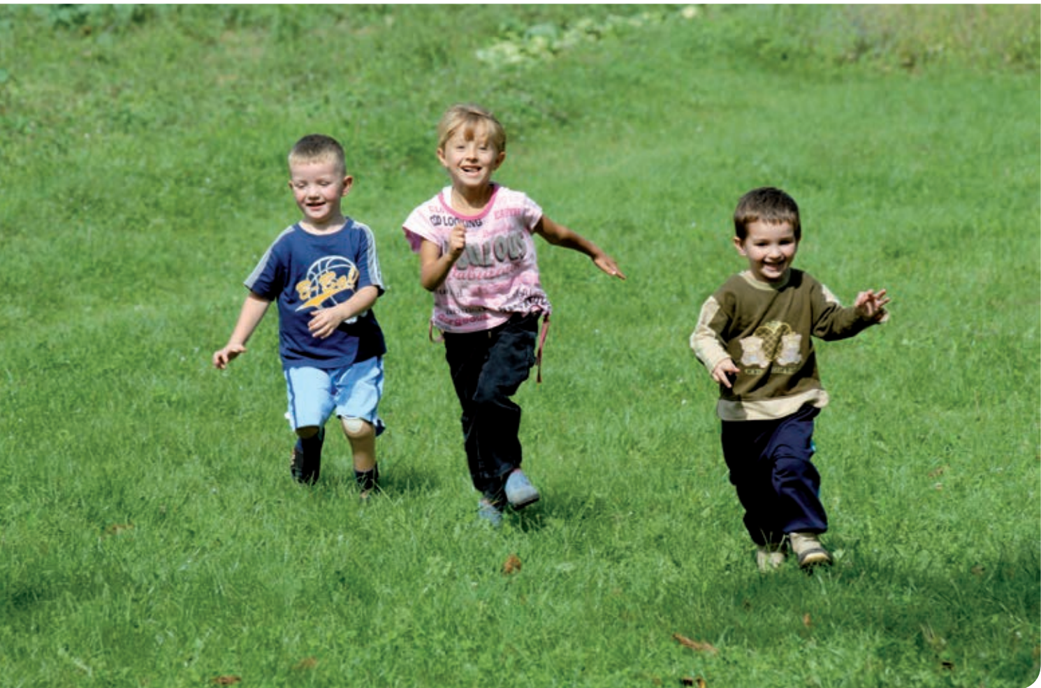
With friends again! - BiH

Handover ceremonies are generally not organised in BiH, based on the assumption that in populated areas, affected communities are well aware of survey/clearance operations and know that when these are completed, the area is safe to use. In the event that ceremonies are organised, they tend to be held in remote areas as a means of informing affected communities that the land is safe to use, or in areas where the land has significant importance for the community. Occasionally handover ceremonies are organised for donors or by companies to raise the profile of completed tasks, and provide the opportunity for interested individuals and organisations to state their appreciation and thanks to the donors.