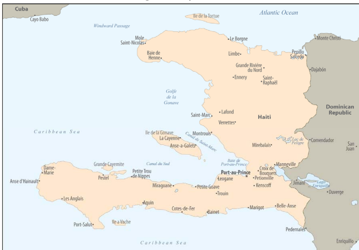
Figure I. Map of Haiti