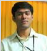
Tilak Jha School of International Studies, JNU

Of all the nations that border China, its comparison with Bhutan would appear to be a paradox. In comprehensive power terms, Bhutan is almost a nonentity to China. Bhutan's biggest disadvantage is its geography that limits its connectivity to India in South and China in north with no access to sea or any other third country without using either Indian or Chinese land or airspace. Nevertheless, in the geopolitical context of today's South Asia, Bhutan's geography has strategic ramifications for both India and China.