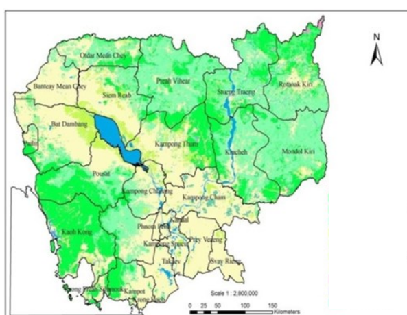
Figure 1: Cambodia forest cover map 2010

wide range of goods and ecosystem services that are especially critical for the rural population. About 85% of the total population live in rural areas (Broadhead and Izquierdo, 2010), and more than 40% of rural households obtain between 20 to 50% of their livelihoods from forest resources (UN-REDD Programme, 2011).