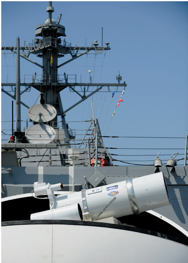
The Laser Weapon System temporarily installed aboard the guided-missile destroyer USS Dewey (DDG 105) in San Diego, is a technology demonstrator built by the Naval Sea Systems Command from commercial fiber solid state lasers, utilizing combination methods developed at the Naval Research Laboratory.