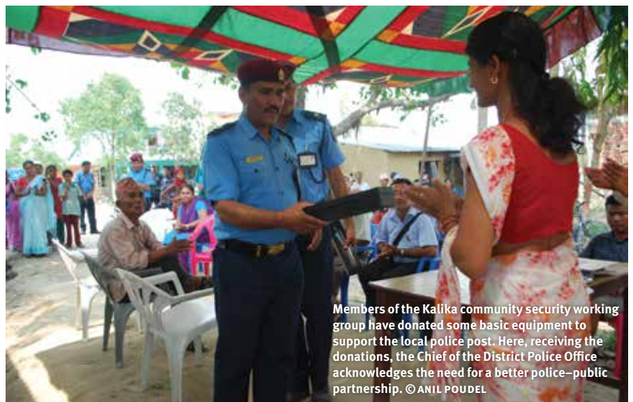
Members of the Kalika community security working group have donated some basic equipment to support the local police post. Here, receiving the donations, the Chief of the District Police Office acknowledges the need for a better police–public partnership.

Community security doesn’t just happen at a local level. It can only be replicated sustainably and at scale if it is part of a broader national level approach to security and justice which recognizes the needs of states and communities and seeks the best possible balance. The overall impact of this approach should be a contribution to capable, accountable, and responsive security and justice institutions, an empowered citizenry, the development of broader state-society relations, and a strengthening of the social contract. There are various ways of ensuring that national and sub-national