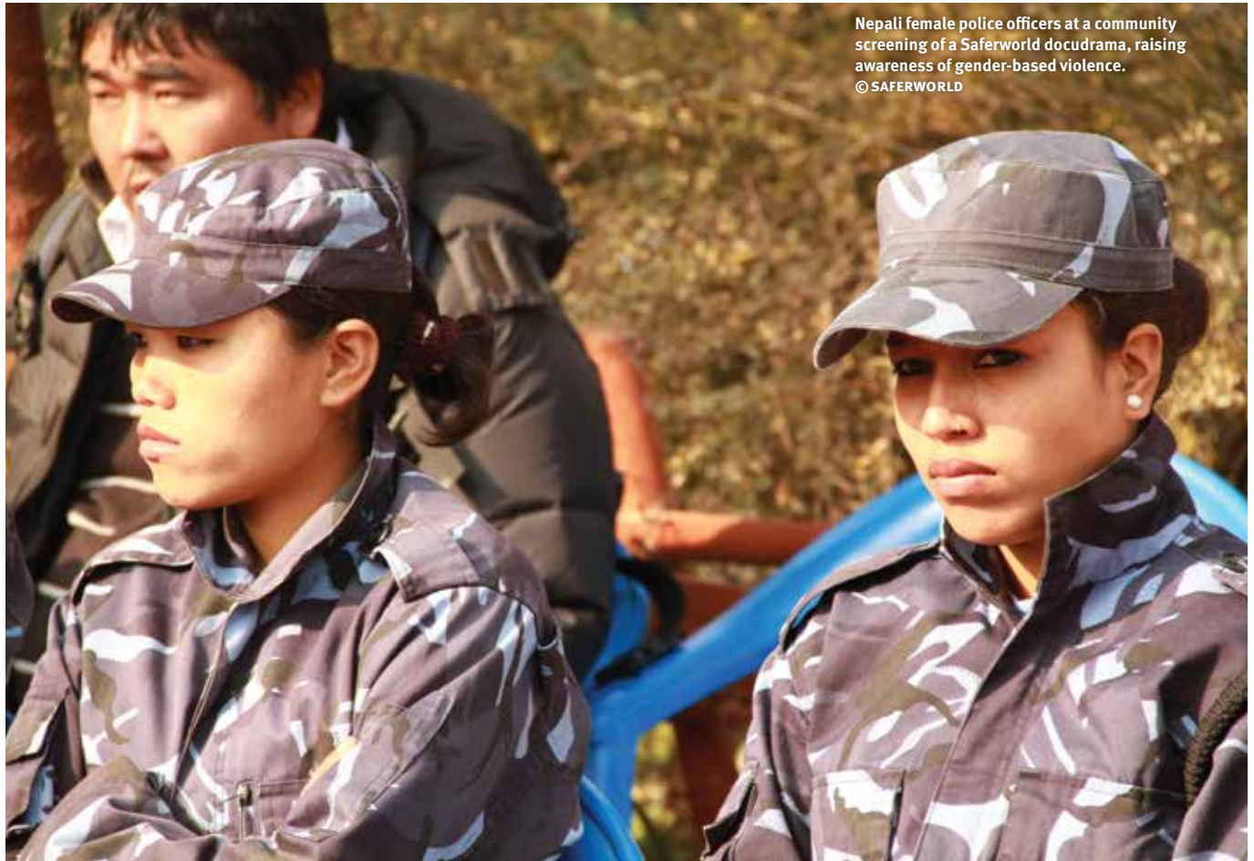
Nepali female police officers at a community screening of a Saferworld docudrama, raising awareness of gender-based violence.