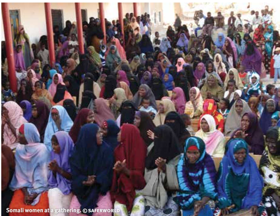
Somali women at a gathering.

of local communities into the center of efforts to enhance security and stability in conflict-affected and fragile states.