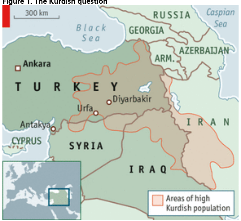
Figure 1. The Kurdish question