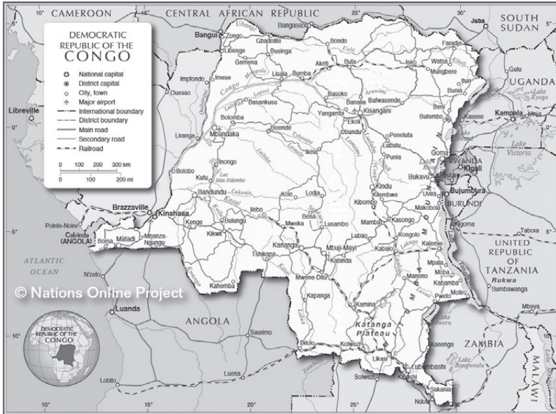
Map 1: Administrative map of the Democratic Republic of Congo showing the two Kivu provinces and neighbouring Uganda, Rwanda and Burundi on the eastern part