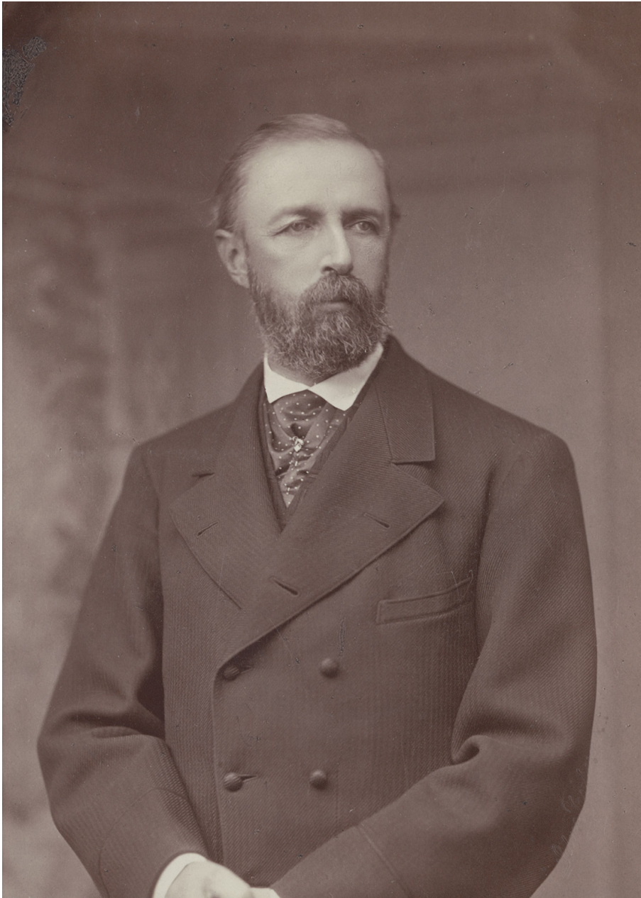
Figure 1. Oscar II, King of Sweden 1872–1907 and King of Norway until 1905.

ism throughout Europe. “Social republicanism,” according to Oscar, was “the disease of this century” (Lindberg 1958:32).