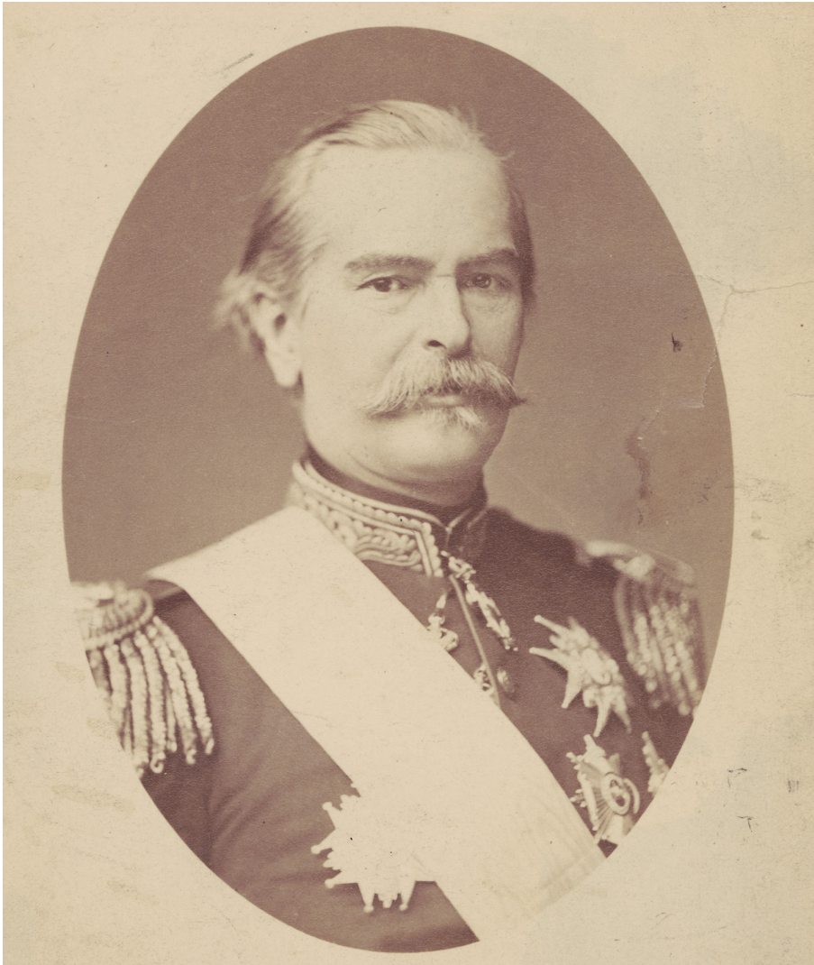
Figure 3. Gillis D.A. Bildt. Swedish envoy in Berlin 1874–86 and prime minister 1888–89.