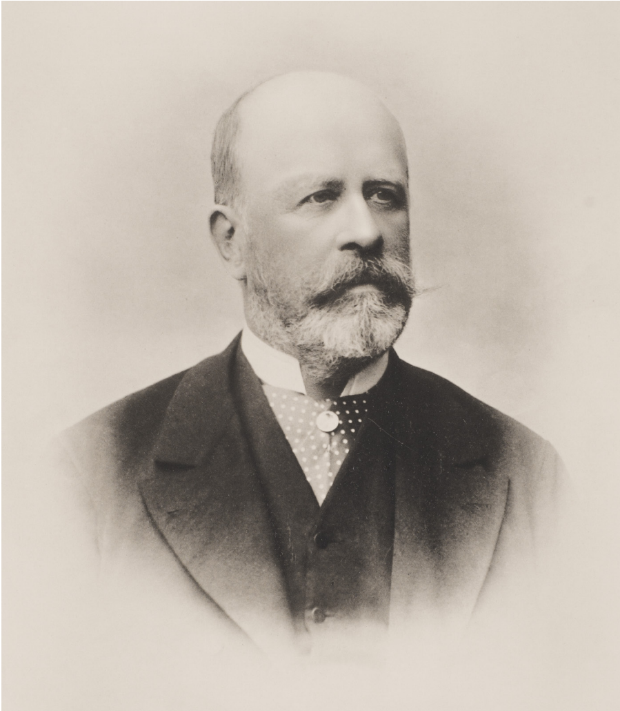
Figure 2. Carl F. L. Hochschild, Minister for Foreign Affairs 1880–85.

Image source: photographer unknown. Porträtt av Carl F. L. Hochschild, Kungliga Biblioteket, KoB Sn.5.