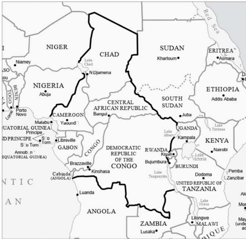
Source Department of Field Support, Cartographic Section, United Nations, November 2011

through an election disputed by the opposition, his failure to make progress with respect to the Libreville peace agreement and his inability to arrest the CAR's worsening fragility precipitated the emergence of the Séléka armed rebellion late in 2012. 8 On 10 December 2012, the Séléka launched an offensive and in just a few weeks swept the CAR army from many major towns and brought Séléka forces to within 40 km of the capital Bangui. 9