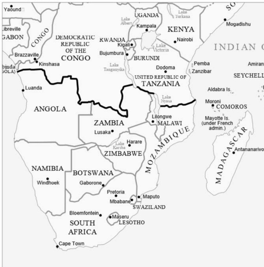
Map 2 Southern Africa (11 countries): Angola, Botswana, Lesotho, Malawi, Mozambique, Namibia, South Africa, Swaziland, Zambia, Zimbabwe and Madagascar