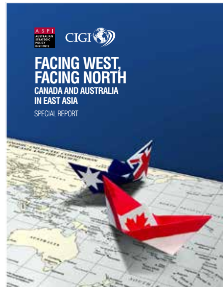
Facing West, Facing North: Canada and Australia in East Asia ASPI-CIGI Special Report

This third edition of the Handbook presents a wide variety of specific experiences of diplomats on the ground, identifying creative, human and material resources. More broadly, it is about the policy-making experience in capitals, as democratic states try to align national interests and democratic values. The Handbook also documents the increasingly prominent role of civil society as the essential building block for successful democratic transitions, with each case study examining specific national experiences in the aspiration for democratic and pluralistic governance, and lessons learned on all sides — for better or for worse.