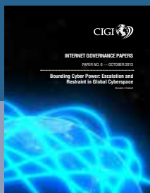
Bounding Cyber Power: Escalation and Restraint in Global Cyberspace Internet Governance Papers No. 6 Ronald J. Deibert

Canada and Australia have shared interests in bolstering economic prosperity and security cooperation across East Asia. This report draws on two regional meetings that featured scholars and practitioners from Australia, Canada and across East Asia and on background papers commissioned for this exercise, which were published by ASPI and CIGI in 2013. This paper calls for policy makers and business leaders in Canada and Australia to consider the broader and longer-term benefits of greater bilateral and multilateral cooperation in East Asia and recommends initiatives.